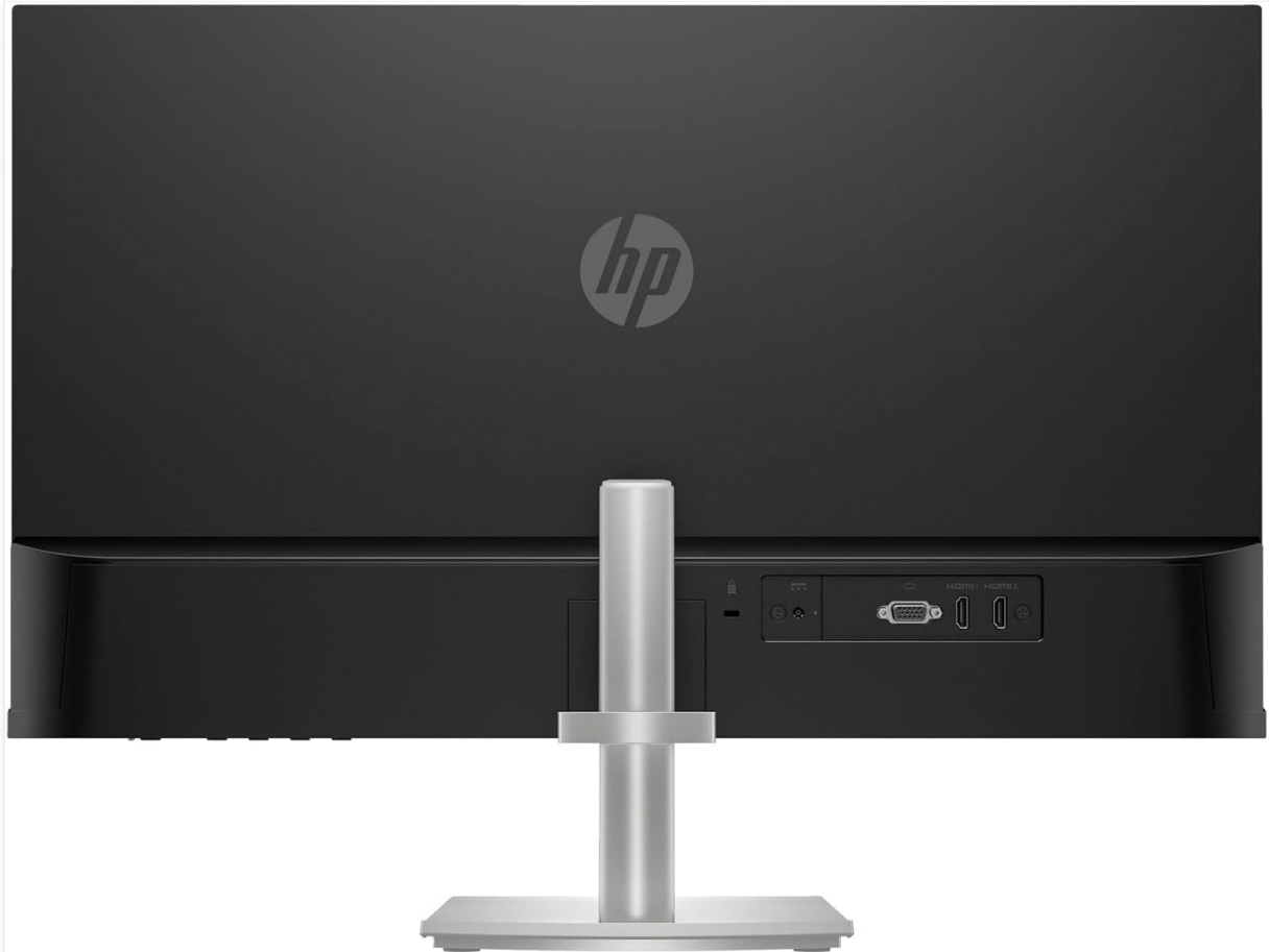
Image: Rear view of the HP 27-inch monitor, highlighting the HDMI, VGA, and power input ports.