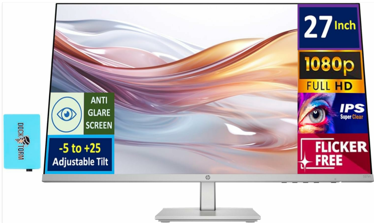
Image: Front view of the HP 27-inch FHD IPS Monitor with the included Doczorm Hub.