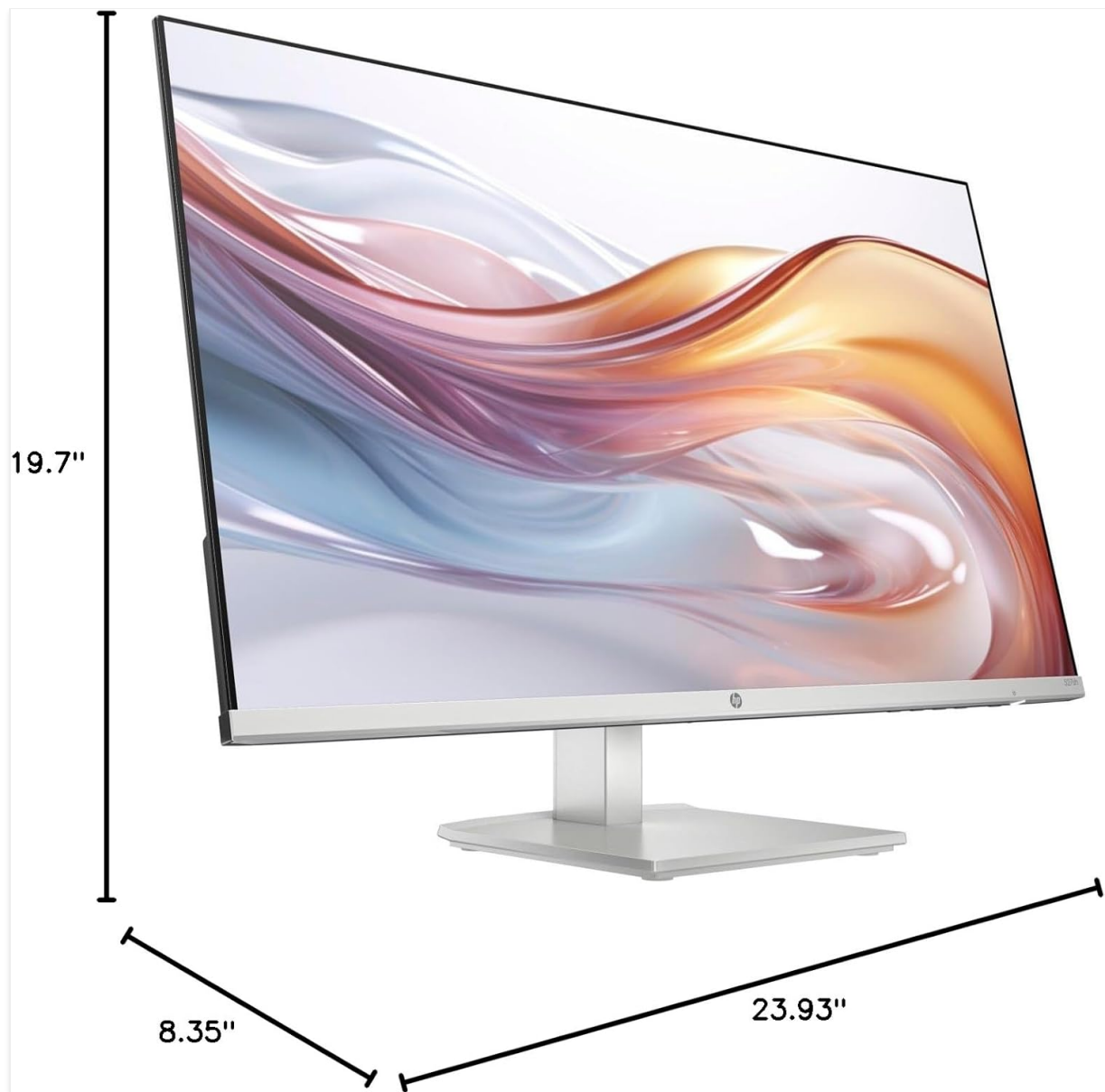
Image: Diagram showing the physical dimensions of the HP 27-inch monitor.