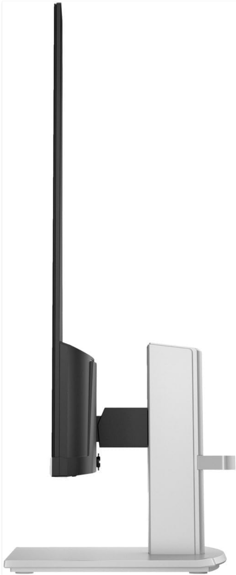
Image: Side view of the HP 27-inch monitor, illustrating the stand's profile and attachment point.