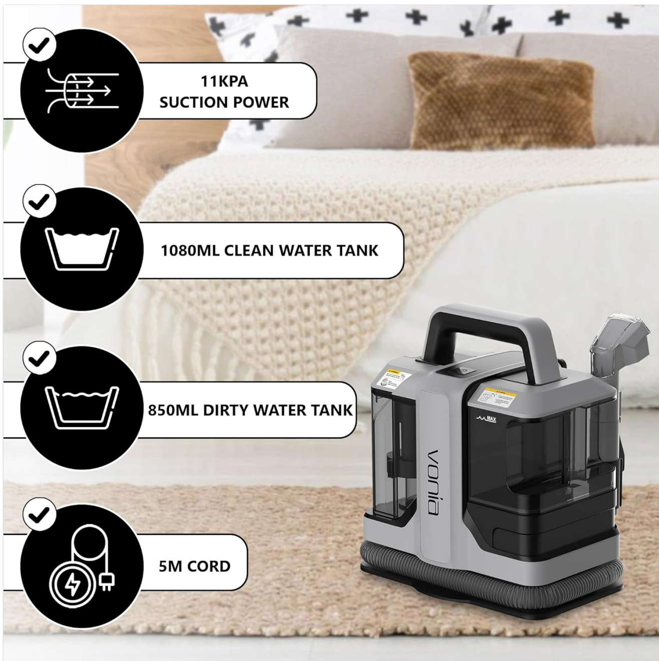
Image: A visual representation of the Vonja Spot Cleaner's key features, including its suction power, tank capacities, and cord length.