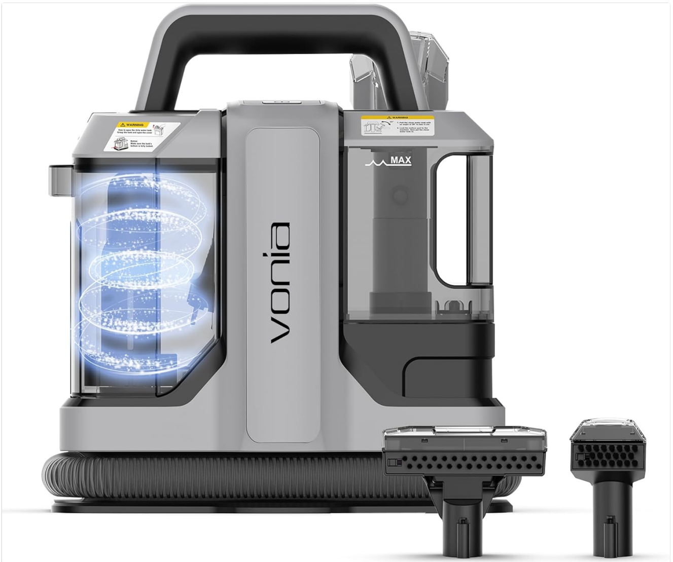
Image: The Vonia Spot Cleaner main unit, showcasing its design and the two included cleaning attachments.