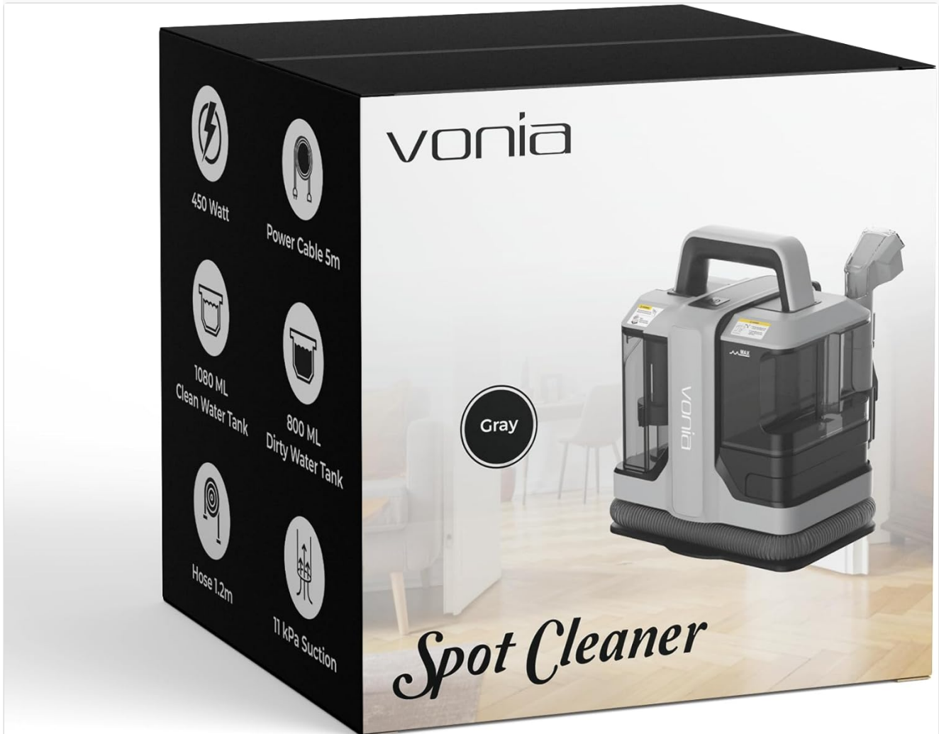
Image: The Vonia Spot Cleaner packaging box, illustrating the main unit and included accessories.