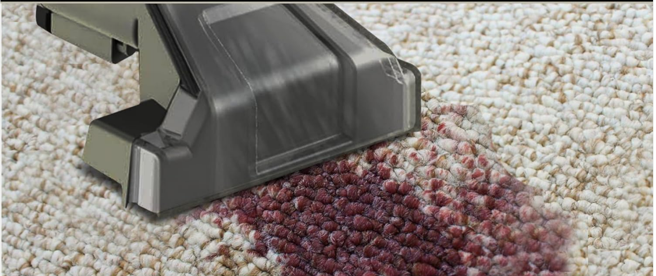
Image: The cleaning nozzle in action, demonstrating its ability to spray solution and extract stains from carpet.