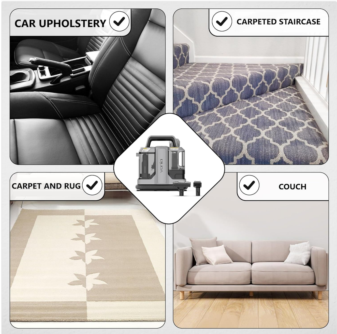
Image: Examples of surfaces suitable for cleaning with the Vonio Spot Cleaner, including car upholstery, carpeted stairs, rugs, and couches.

The Vonio Spot Cleaner is designed for effective cleaning of carpets, rugs, upholstery, and car interiors.