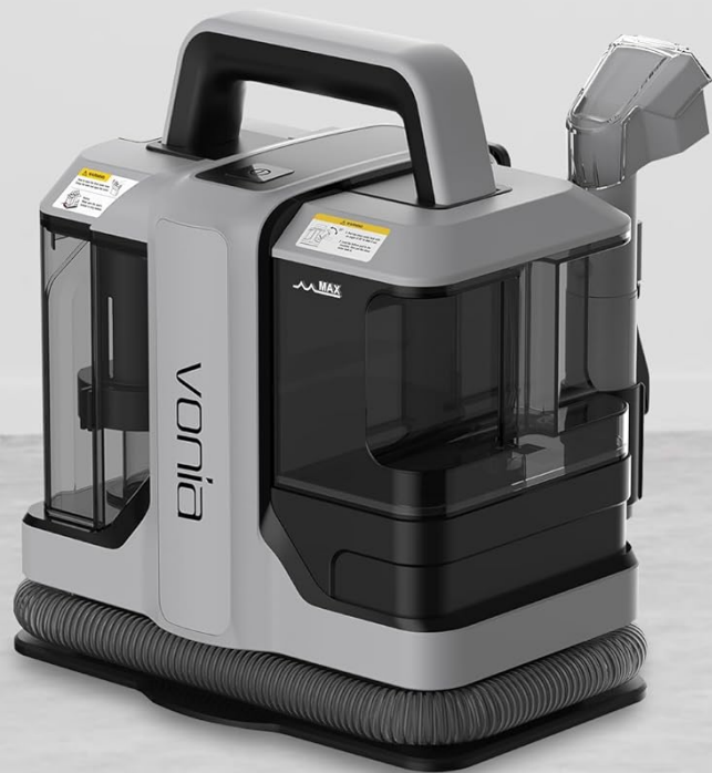
Image: Key features of the Vonja Spot Cleaner, including its power, compact size, and hose length.