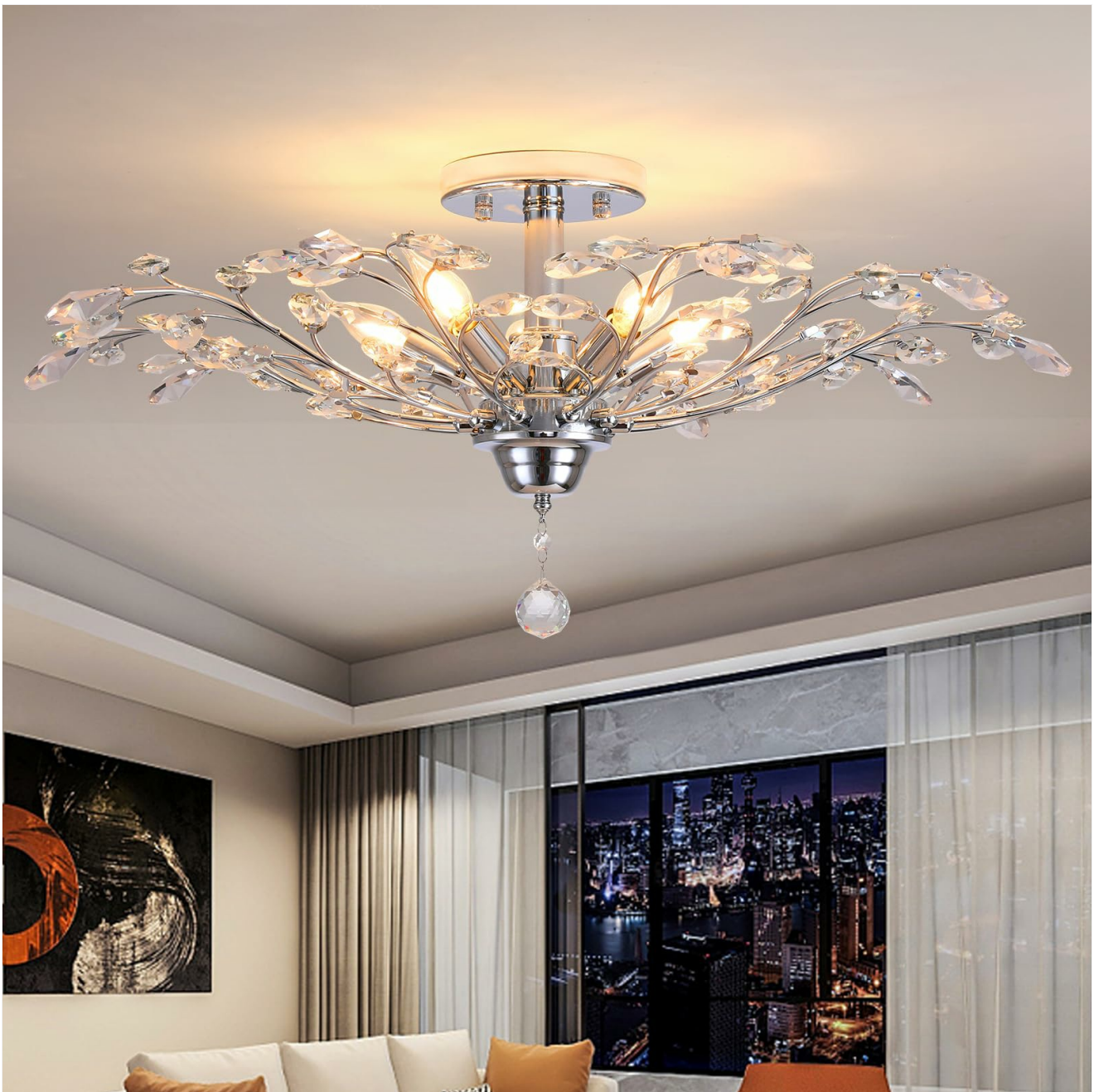
Image 1: Ganeed Frozen Crystal Branch 5-Light Ceiling Chandelier in a living room setting.