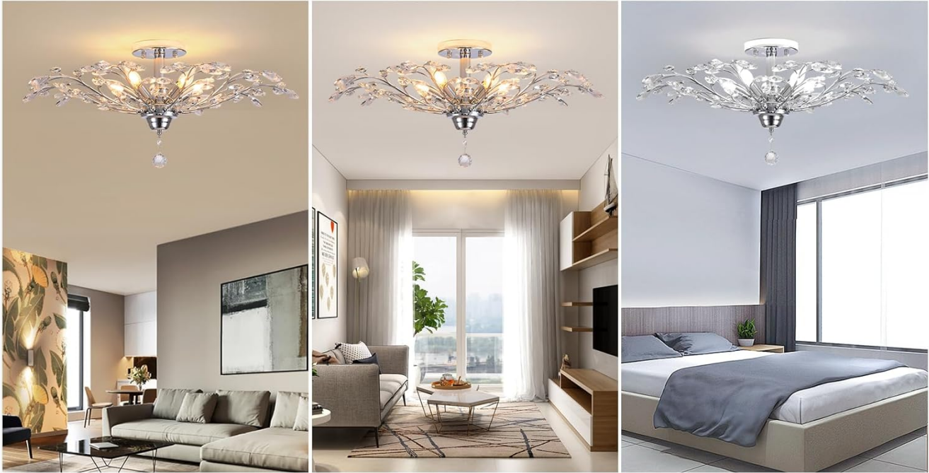
3000K Warm White