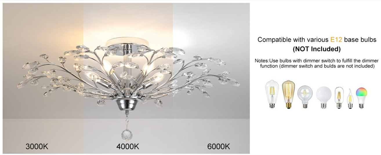
Image 5: Chandelier demonstrating various color temperature effects (3000K, 4000K, 6000K) when used with dimmable bulbs.