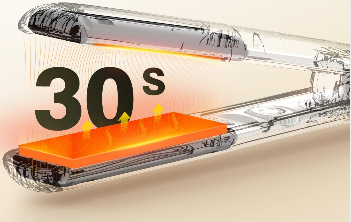
Figure 3: Advanced PTC ceramic heaters enable rapid 30-second heat-up time.