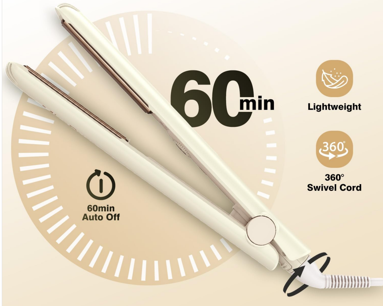
Figure 5: Safety features include a 60-minute auto shut-off and a flexible 360° swivel cord.

The straightening iron will turn off automatically after 60 minutes of non-use. And 360° swivel cord is easy to use