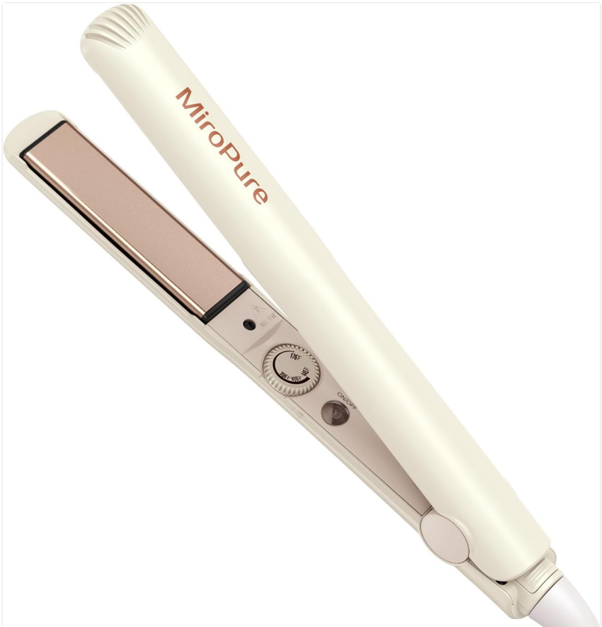
Figure 1: MiroPure 1 Inch 2-in-1 Ceramic Flat Iron (Model EF008)