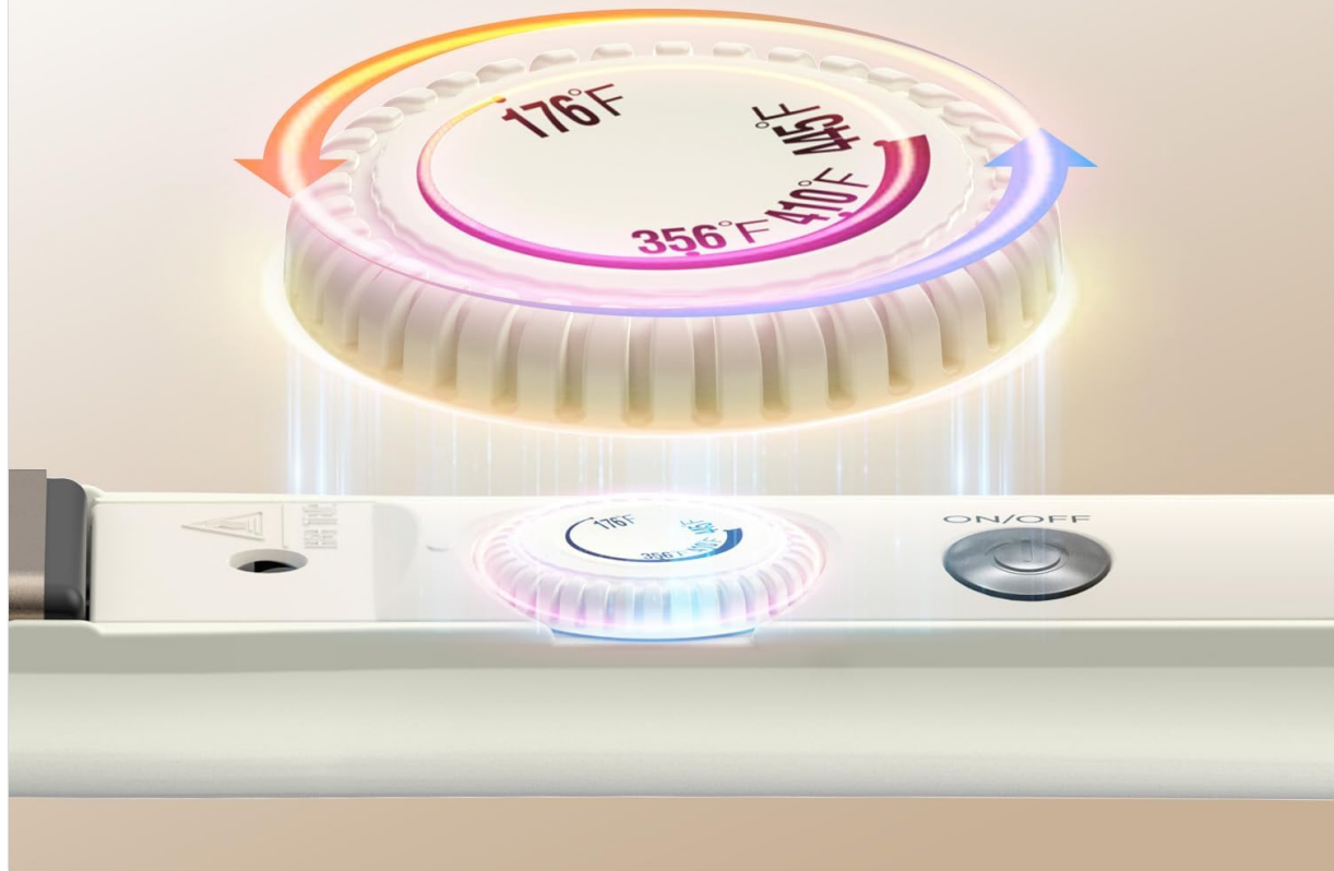
Figure 2: Adjustable temperature dial with settings from 176°F to 445°F.