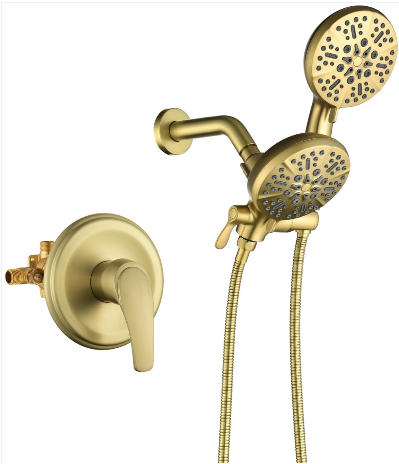
Image: The WELLFOR Single-Handle 2-Spray High-Pressure Shower Faucet in Brushed Gold, showcasing the main faucet body and the dual shower heads.

Key features include a high-quality ABS shower head, a solid brass valve body for reliability, and an easy-to-use 3-way water diverter. The adjustable ball joint allows for personalized comfort by enabling 360° rotation of the showerheads.