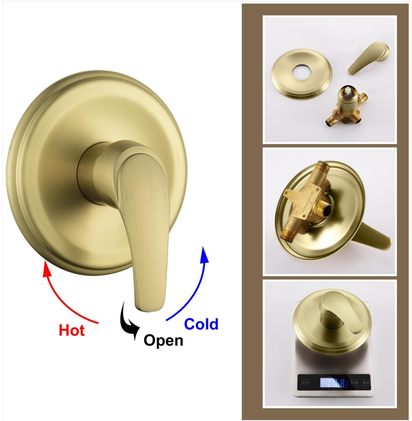
Image: Illustration of the single handle operation. Rotate the handle left for hot water, right for cold water, and lift to open the water flow.

The single handle controls both water temperature and flow. Rotate the handle to the left for hotter water and to the right for colder water. Lift the handle to turn on the water flow and push down to turn it off.