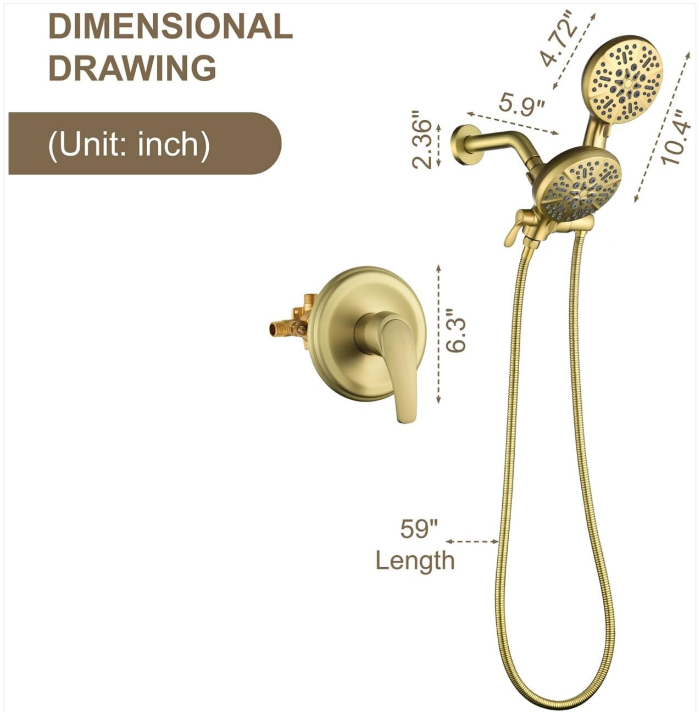
Image: A dimensional drawing illustrating the key measurements of the WELLFOR shower faucet system, including the fixed shower head, handheld shower head, and the main valve body. All measurements are in inches.