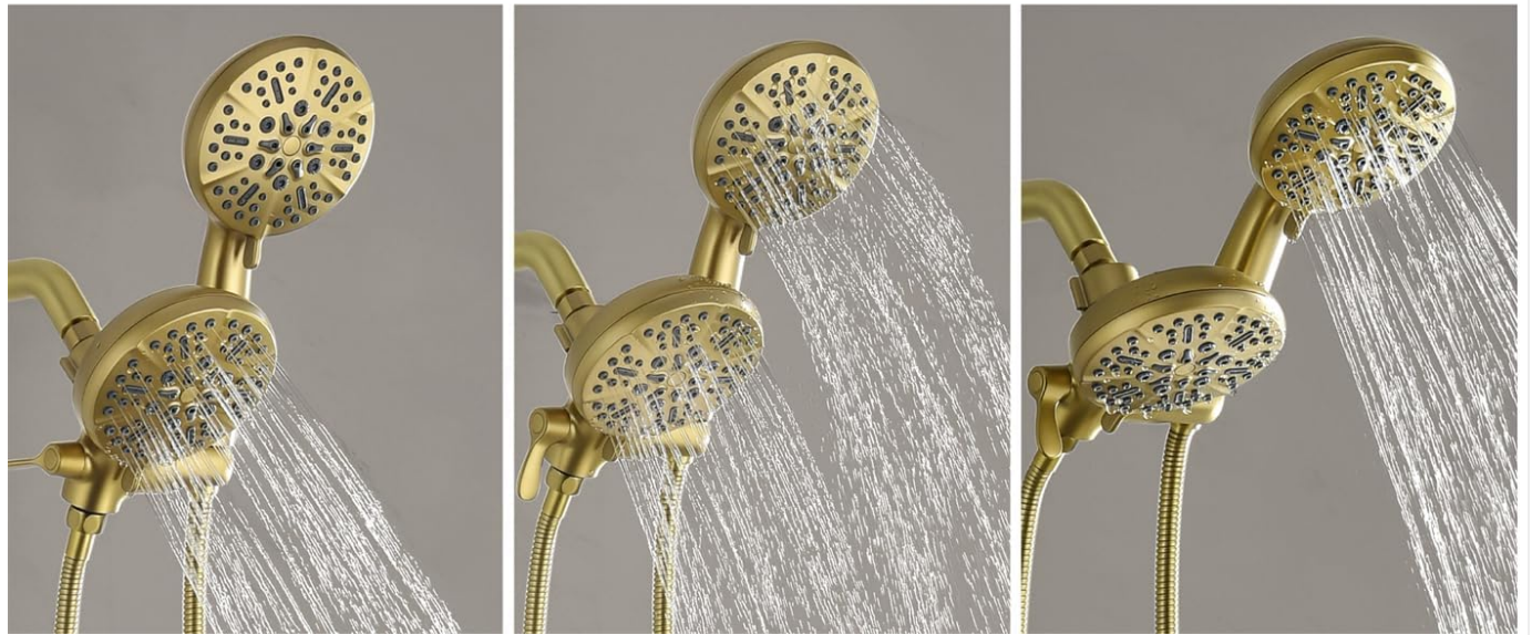
Image: Visual representation of the 3-way diverter, showing how to switch between the fixed shower head, handheld shower head, or both operating at the same time.