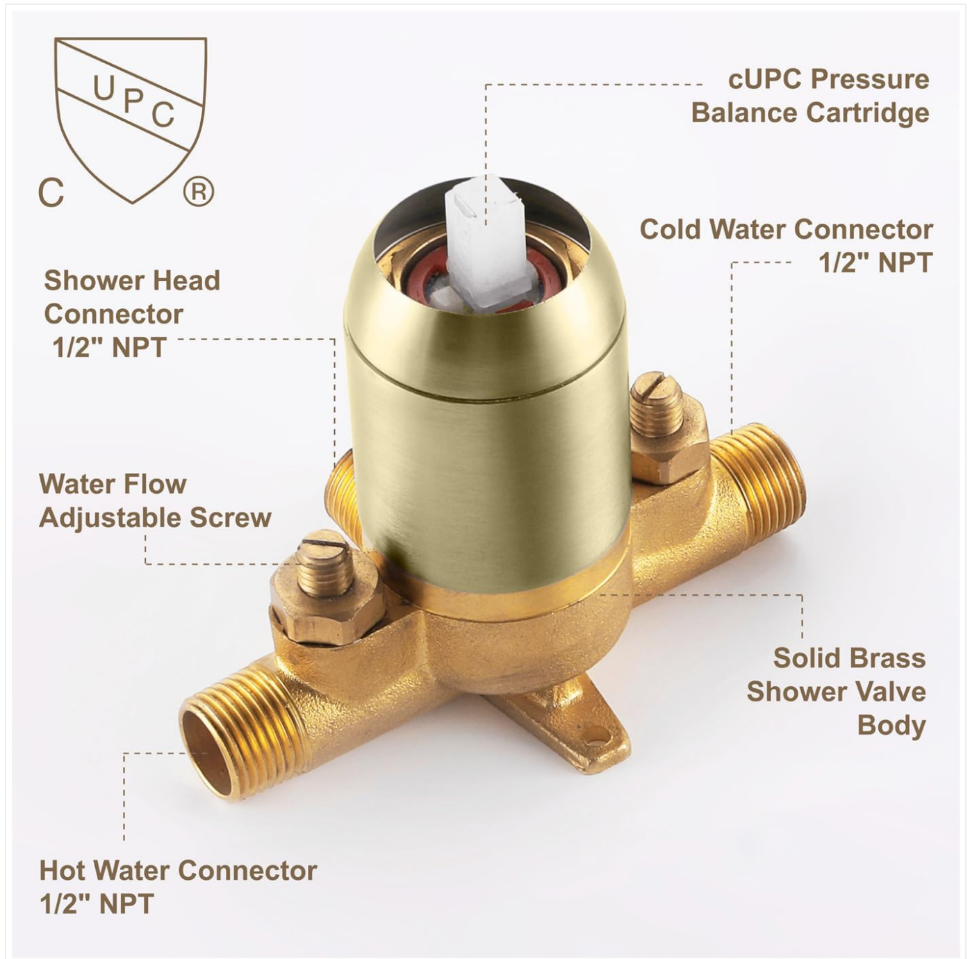
Image: A detailed view of the premium brass rough-in valve, highlighting the cUPC Pressure Balance Cartridge, hot and cold water connectors (1/2" NPT), shower head connector (1/2" NPT), and the water flow adjustable screw.