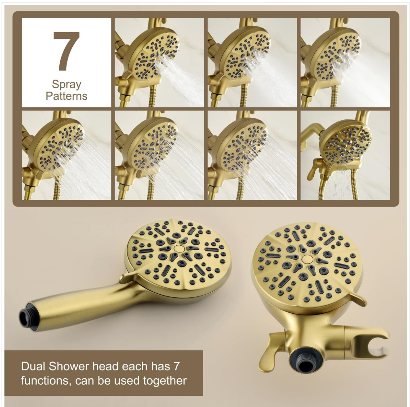
Image: A collage demonstrating the 7 different spray patterns available on both the fixed and handheld shower heads, illustrating the variety of water flows.