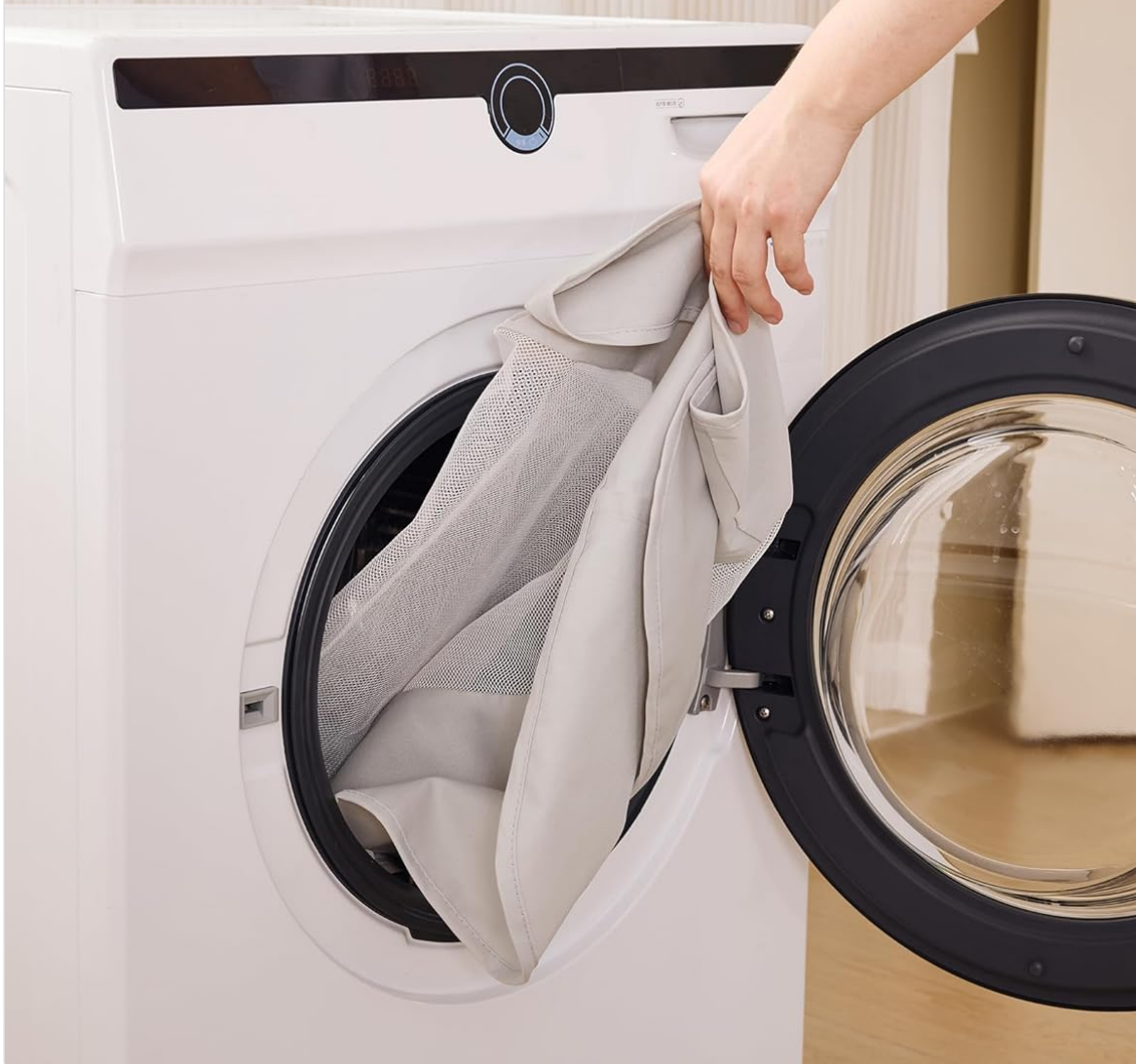
Figure 4: The removable fabric cover can be easily machine-washed for hygiene.

Maintain toddler bed rails clean for a hygienic sleep space