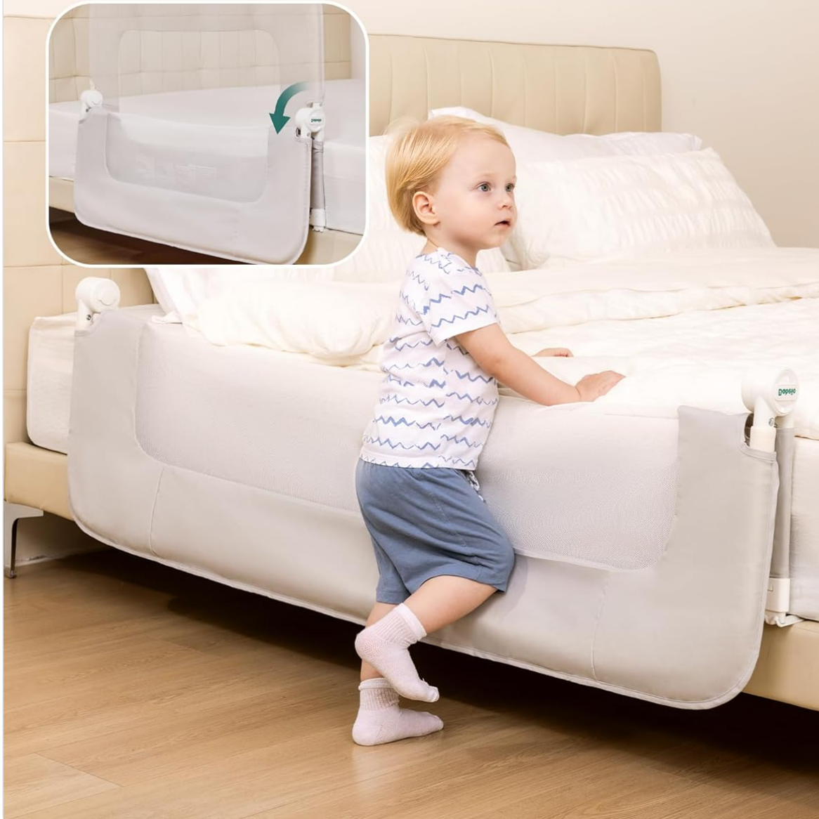
Figure 1: Bed rail in swing-down position, showing easy access for a toddler.