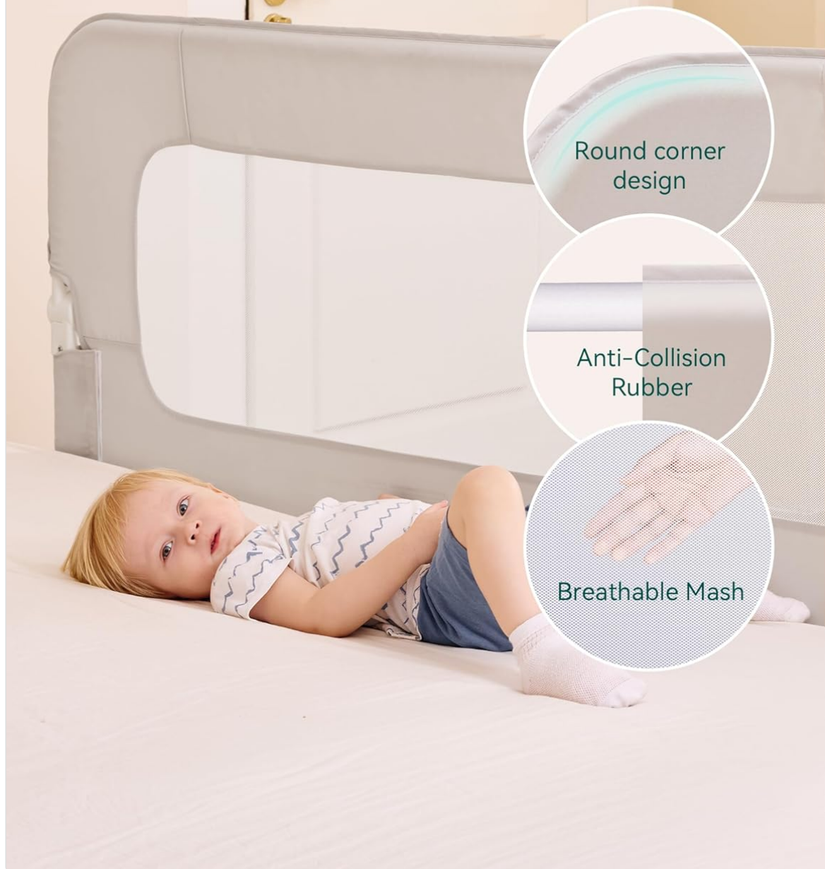
Figure 5: Key safety features of the BABELIO bed rail.