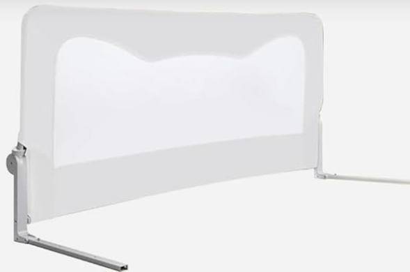
Figure 6: The stable U-shape base design for superior stability.