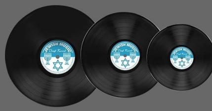
Image: Illustration showing three common vinyl record sizes: 7-inch (45 RPM), 10-inch (45 RPM), and 12-inch (33-1/3 RPM).