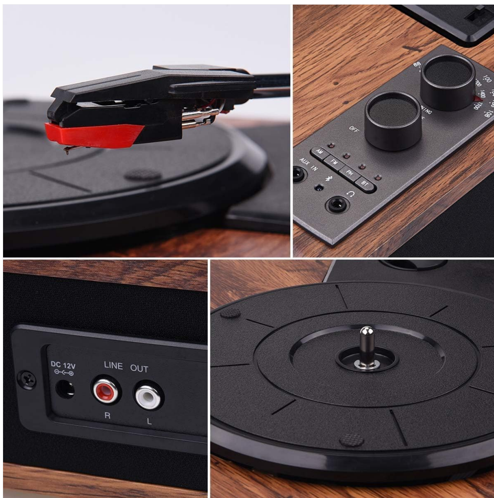
Image: Close-up of the control panel, showing the power/volume knob, tuning knob, mode selection buttons (AM, FM, AUX IN, BT), and headphone jack.