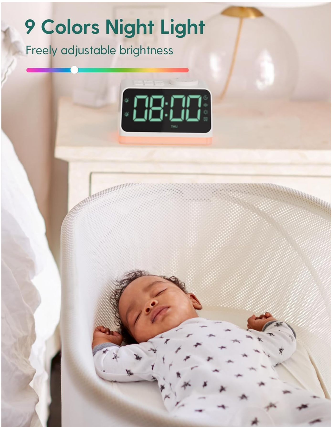
Figure 5: The night light feature with adjustable colors and brightness.