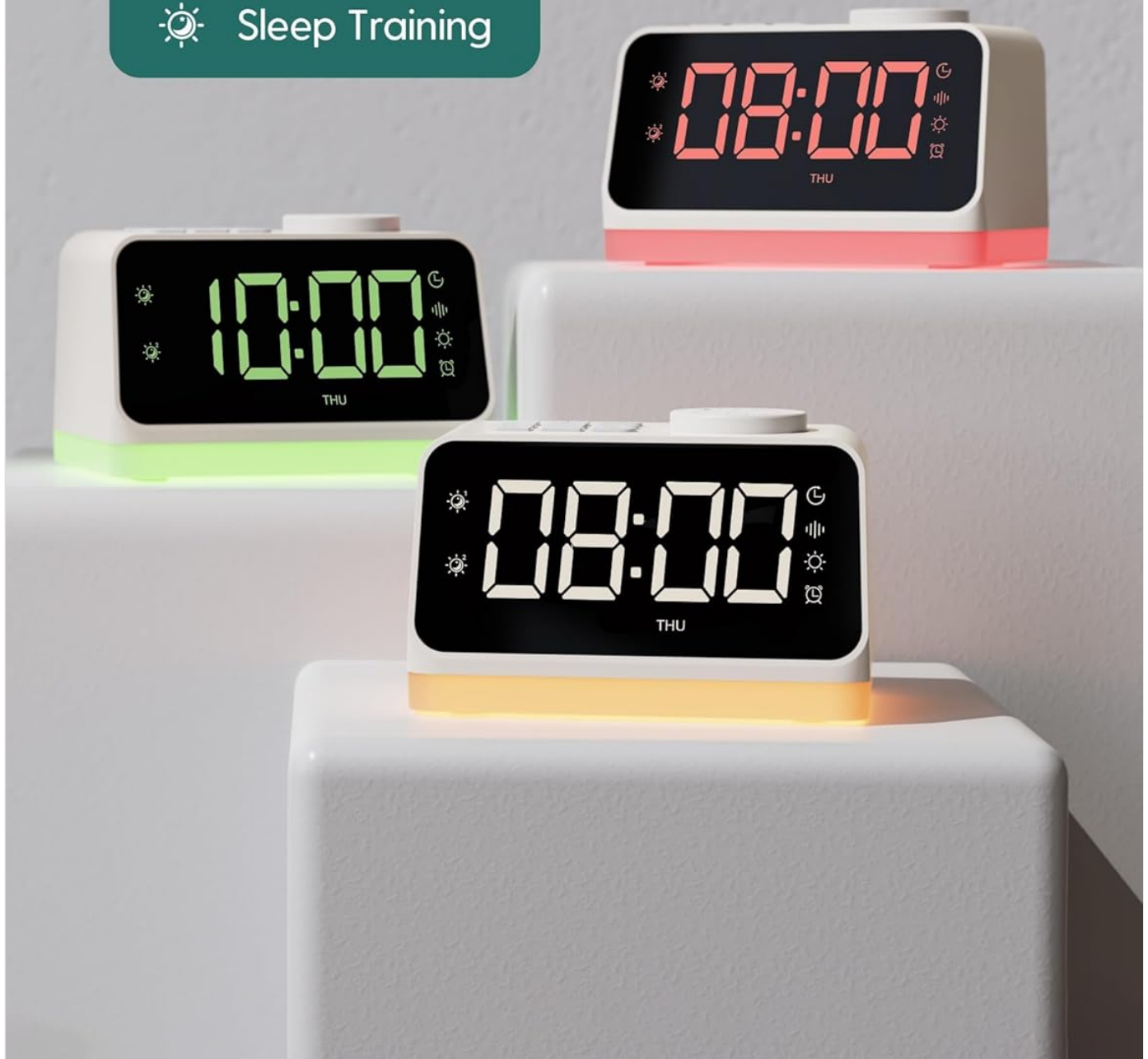
Figure 2: Overview of the device's four primary functions.