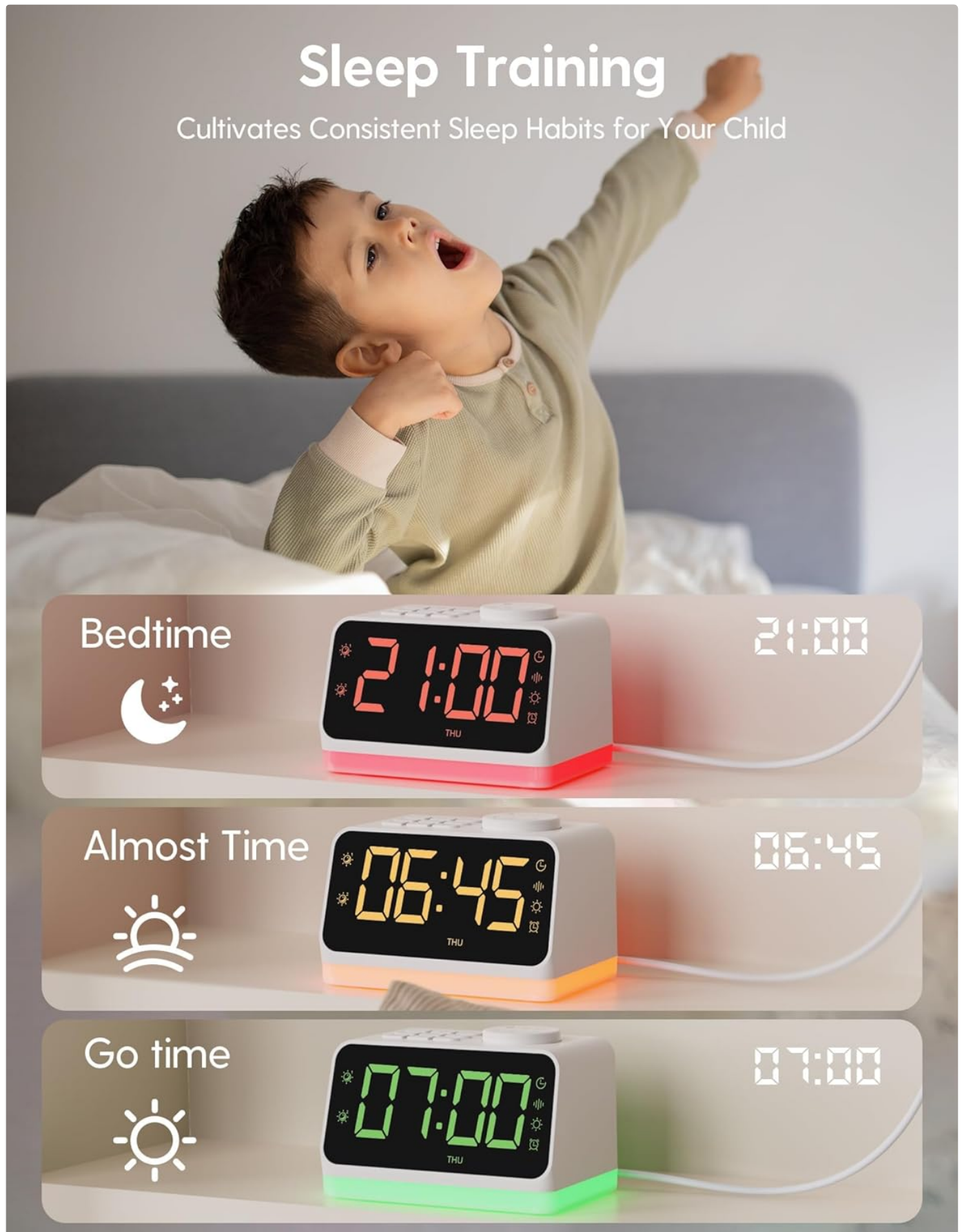
Figure 6: Sleep training light cues for consistent habits.

The sleep training feature uses light cues to help establish consistent sleep habits.