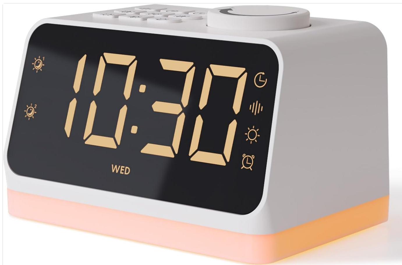
Figure 1: Front view of the BABELIO Alarm Clock Sound Machine.

The BABELIO Alarm Clock Sound Machine is a versatile 4-in-1 device designed to enhance sleep and wake-up routines for all ages. It integrates a sound machine, alarm clock, sleep trainer, and night light into a single compact unit. This manual provides comprehensive instructions for setup, operation, and maintenance.