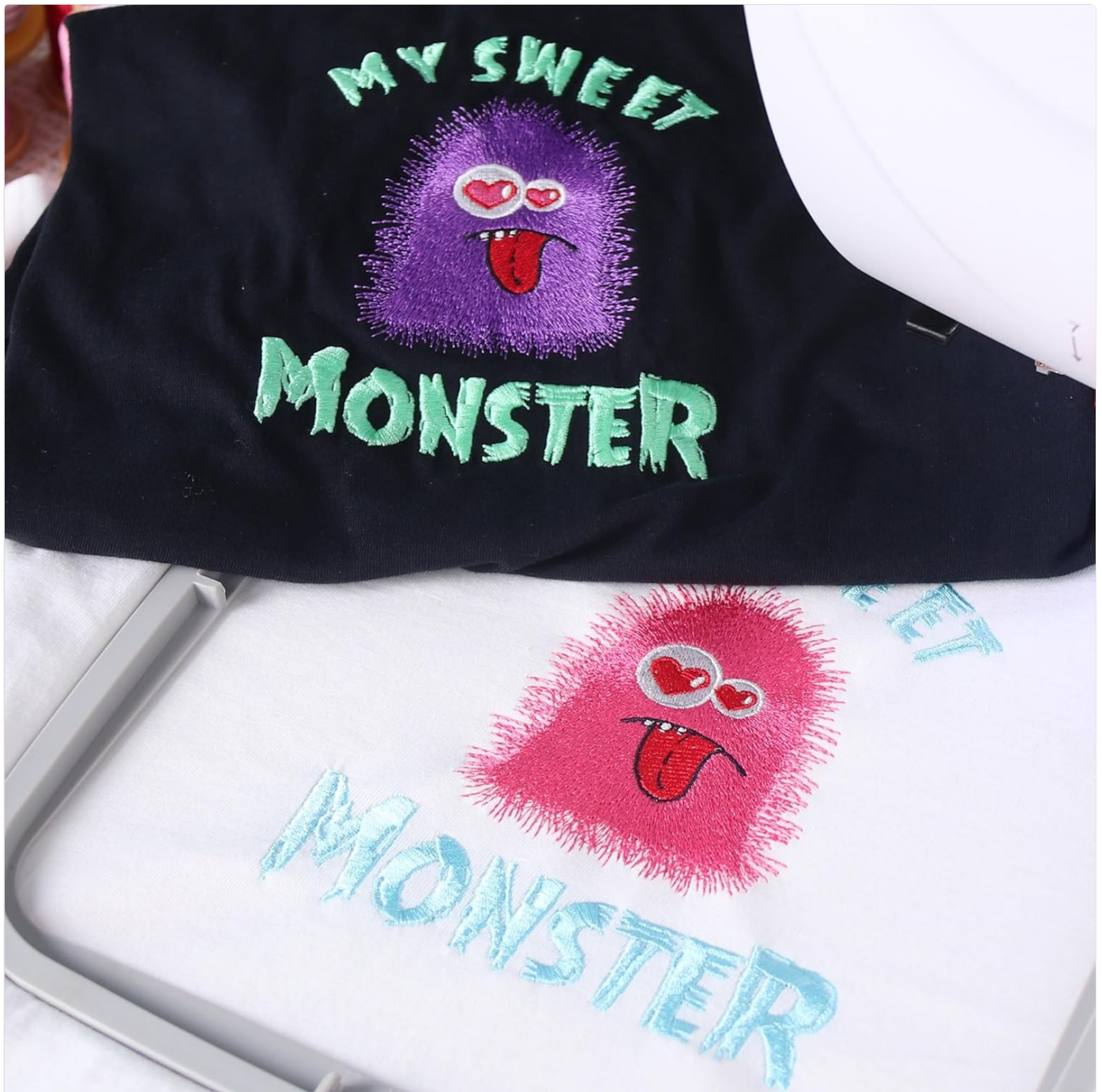
Image: Examples of embroidered designs on clothing, showcasing the machine's capability to create detailed patterns on various garments.