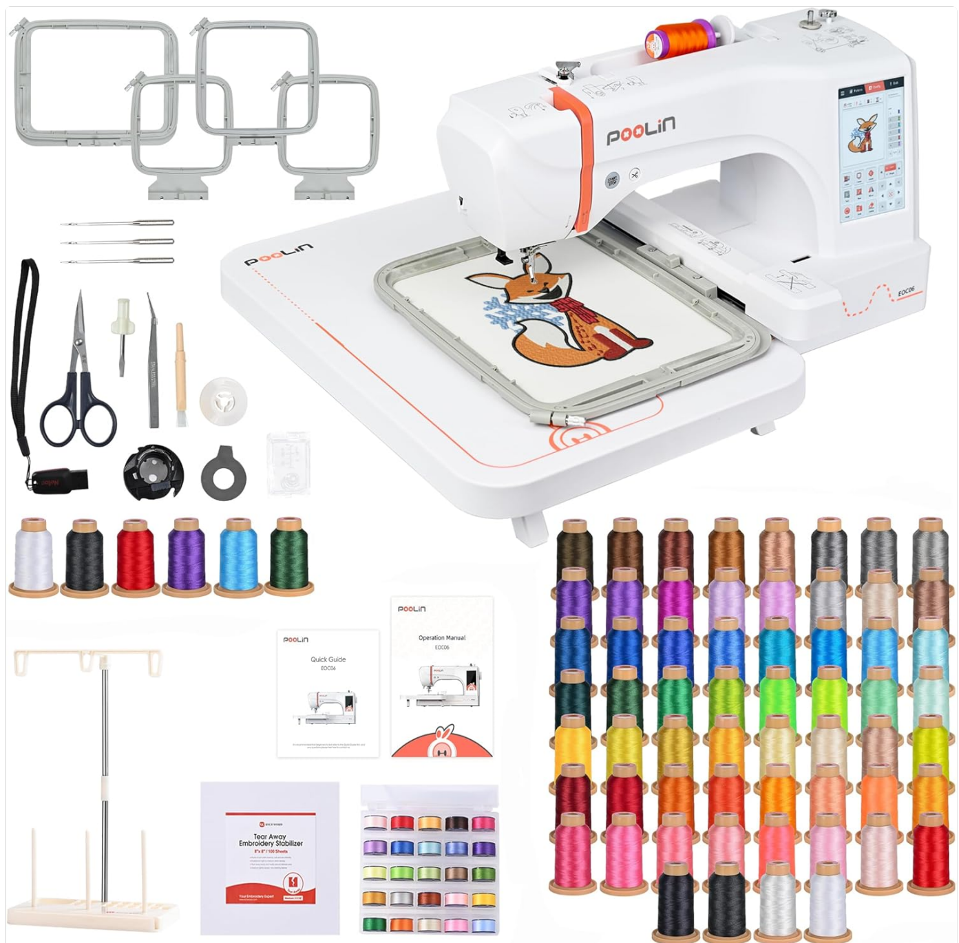
Image: Overview of the POOLIN EOC06 Embroidery Machine along with its comprehensive set of included accessories, such as various hoops, thread spools, and essential tools for embroidery.