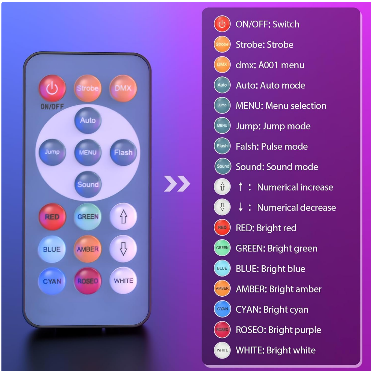
Image: The remote control layout with clear labels for each button's function, including ON/OFF, Strobe, DMX, Auto, Jump, Pulse, Sound, numerical increase/decrease, and direct color selection (Red, Green, Blue, Amber, Cyan, Roseo, White).