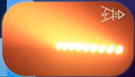
Image: The light bar demonstrating its 25-degree beam angle and wide spread, illuminating different room environments with vibrant colors.