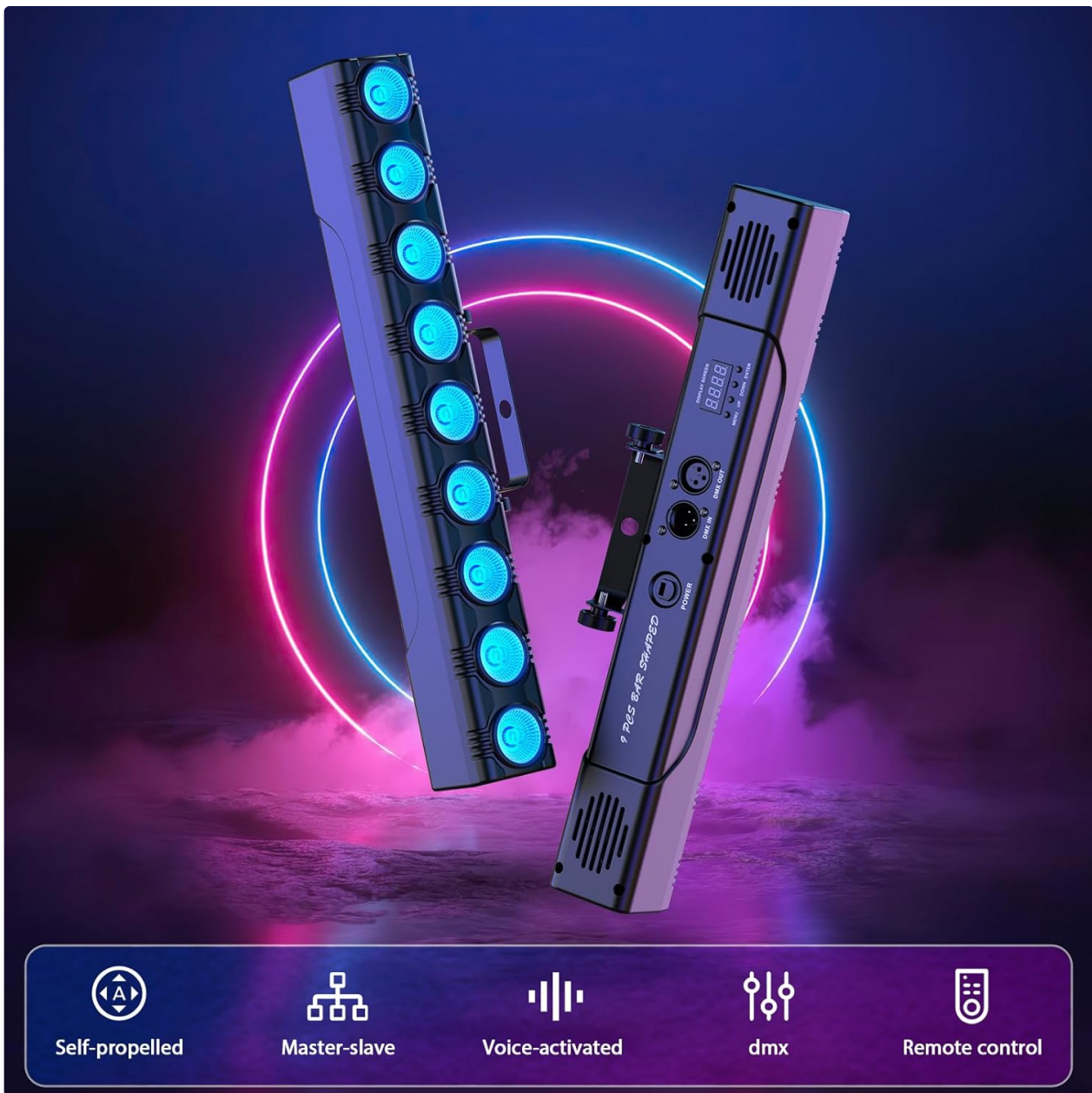
Image: The light bar illustrating its various control modes: Self-propelled, Master-slave, Voice-activated, DMX, and Remote control.