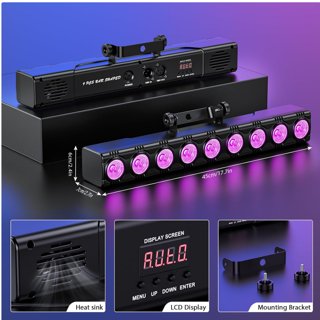
Image: Detailed view of the light bar, highlighting its dimensions, integrated heat sink, LCD display for settings, and the included mounting bracket.