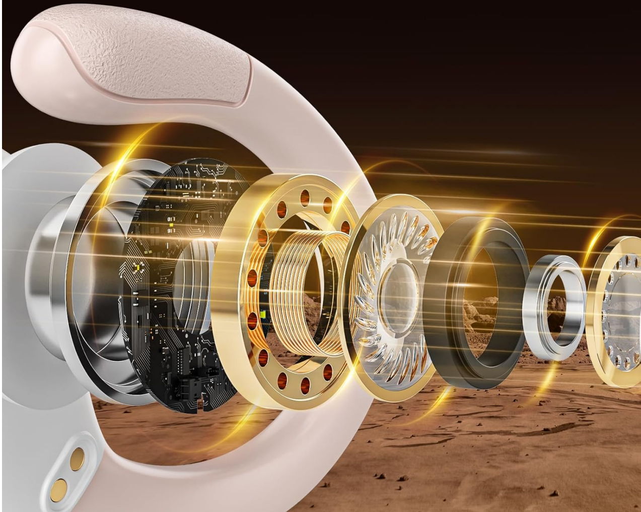
Image: Exploded view of the earbud's internal components, showcasing the 14.3mm Graphene Diaphragm for high-quality stereo sound.