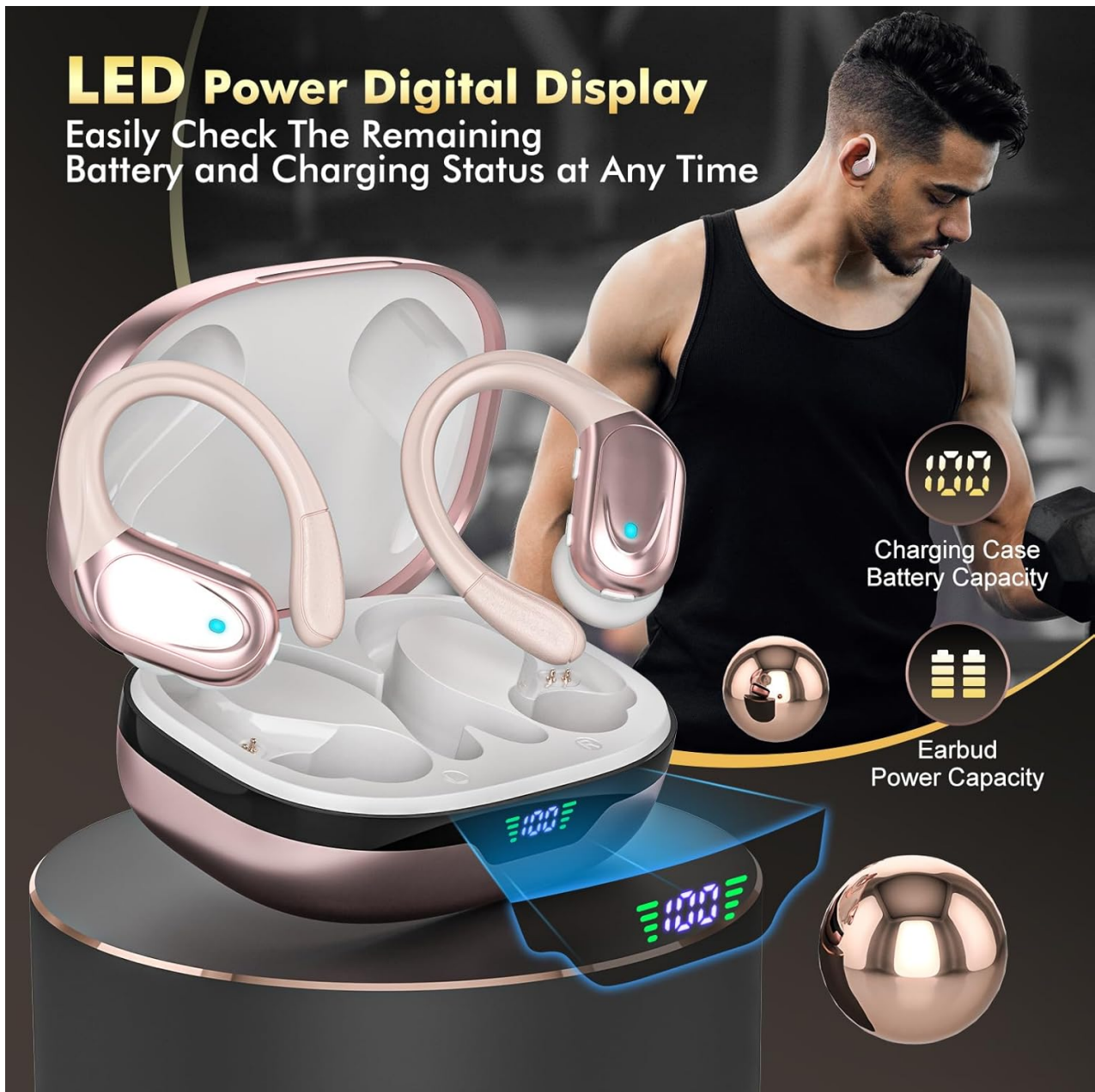
Image: The charging case with its lid open, showing the earbuds inside and the LED digital display indicating the battery levels of both the case and the individual earbuds.

Easily Check The Remaining Battery and Charging Status at Any Time