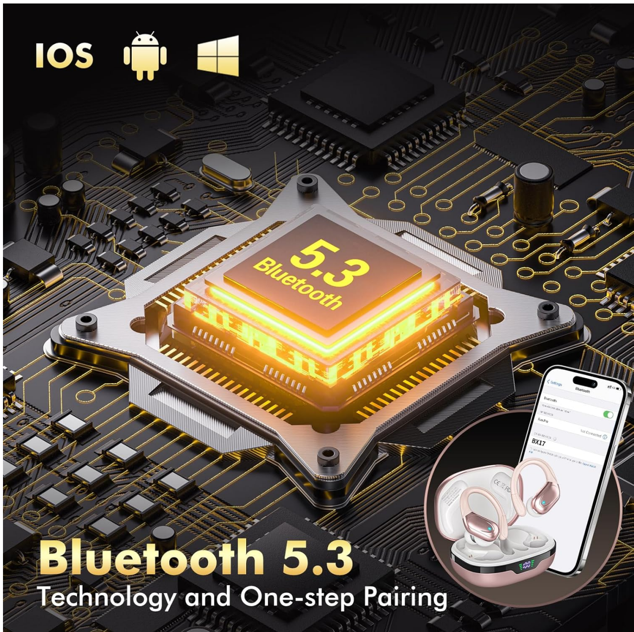
Image: A visual representation of the Bluetooth 5.3 chip and a smartphone screen showing the "BX17" earbuds connected, illustrating the one-step pairing process.