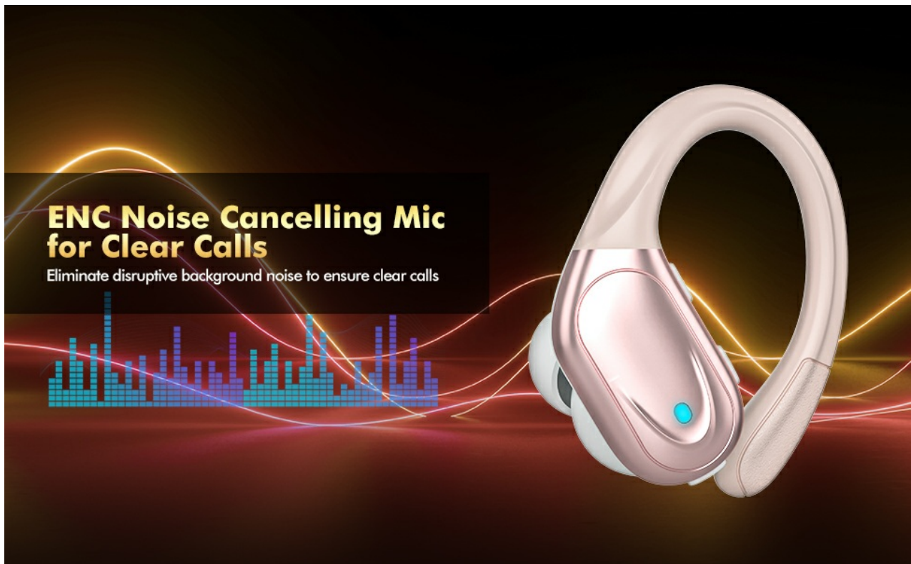
Image: A single earbud with a visual representation of sound waves, indicating the ENC Noise Cancelling Mic for clear calls by eliminating background noise.