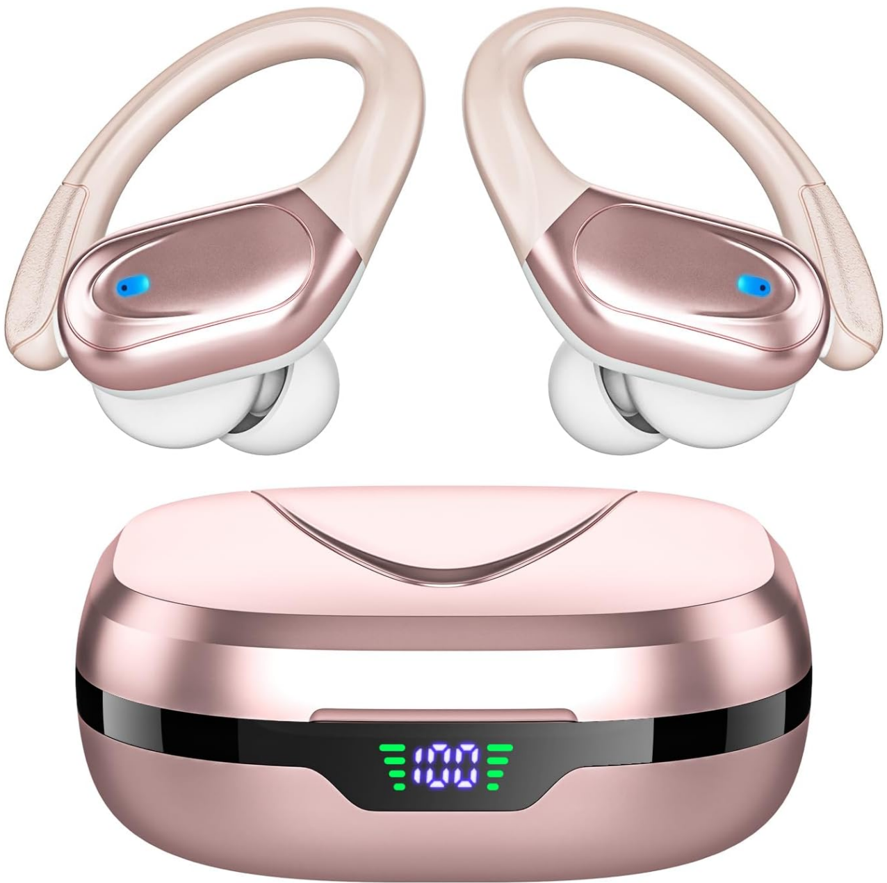
Image: Catitru BX17 Wireless Earbuds in rose gold, shown with their charging case. The case features a digital LED power display.

The Catitru BX17 earbuds feature an ergonomic design with elastic and soft ear hooks for a secure and comfortable fit during extended use. They come with three different sized eartips (S, M, L) to ensure optimal comfort and sound isolation for various ear sizes. The earbuds are IPX7 waterproof, making them resistant to splashes and sweat, suitable for sports and outdoor activities.