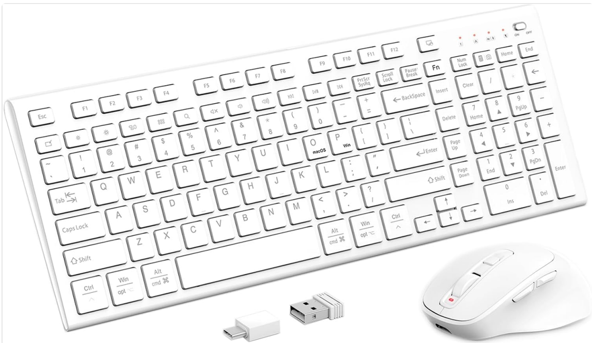
Figure 1: FENIFOX Wireless Keyboard and Mouse Combo with USB receiver. This image displays the full white wireless keyboard, the ergonomic white wireless mouse, and the compact USB receiver.

This manual provides instructions for the FENIFOX Wireless Keyboard and Mouse Combo. This combo is designed for use with various operating systems, including Windows, macOS, and iOS, offering a convenient and efficient input solution.