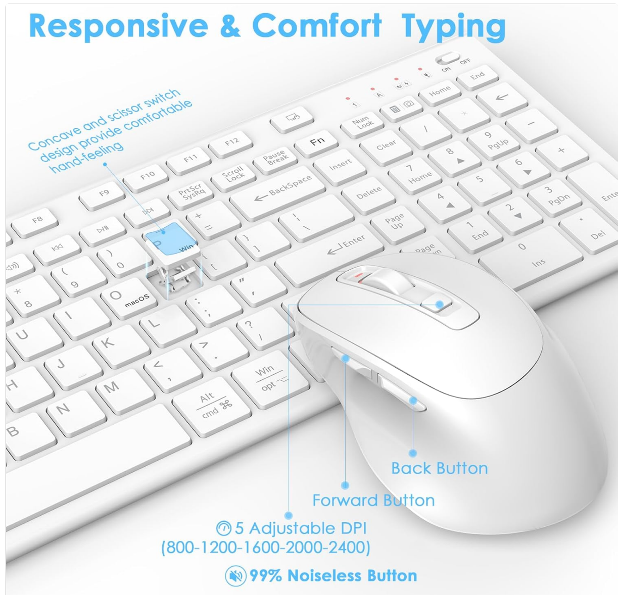
Figure 4: Mouse Features. This image details the ergonomic design of the mouse, pointing out the back and forward buttons, and mentioning the 5 adjustable DPI settings and 99% noiseless buttons.