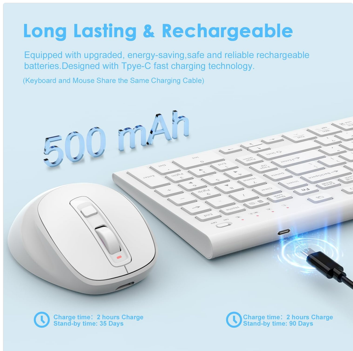
Figure 2: Charging the Wireless Keyboard and Mouse. This image shows the white wireless mouse and a portion of the

Standby Time: Keyboard: Up to 90 days; Mouse: Up to 35 days.