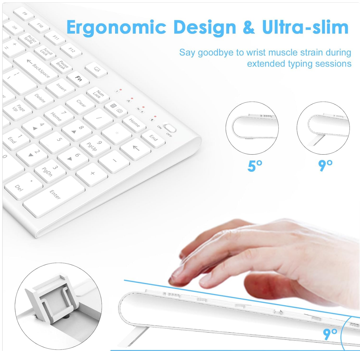
Figure 5: Ergonomic Keyboard Design. This image illustrates the ultra-slim profile and adjustable tilt angles (5° and 9°) of the keyboard, designed for comfortable typing.