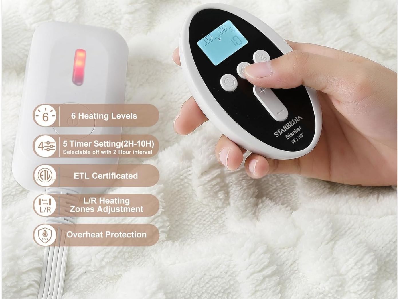
Figure 3: Wireless Controller and its features.