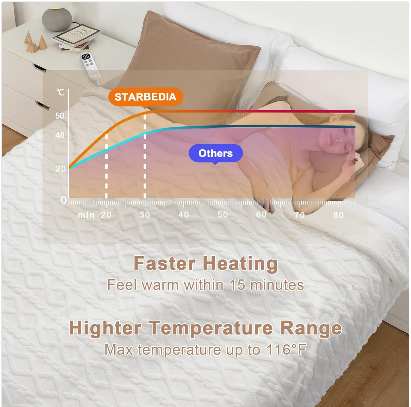
Figure 4: Heating performance comparison.