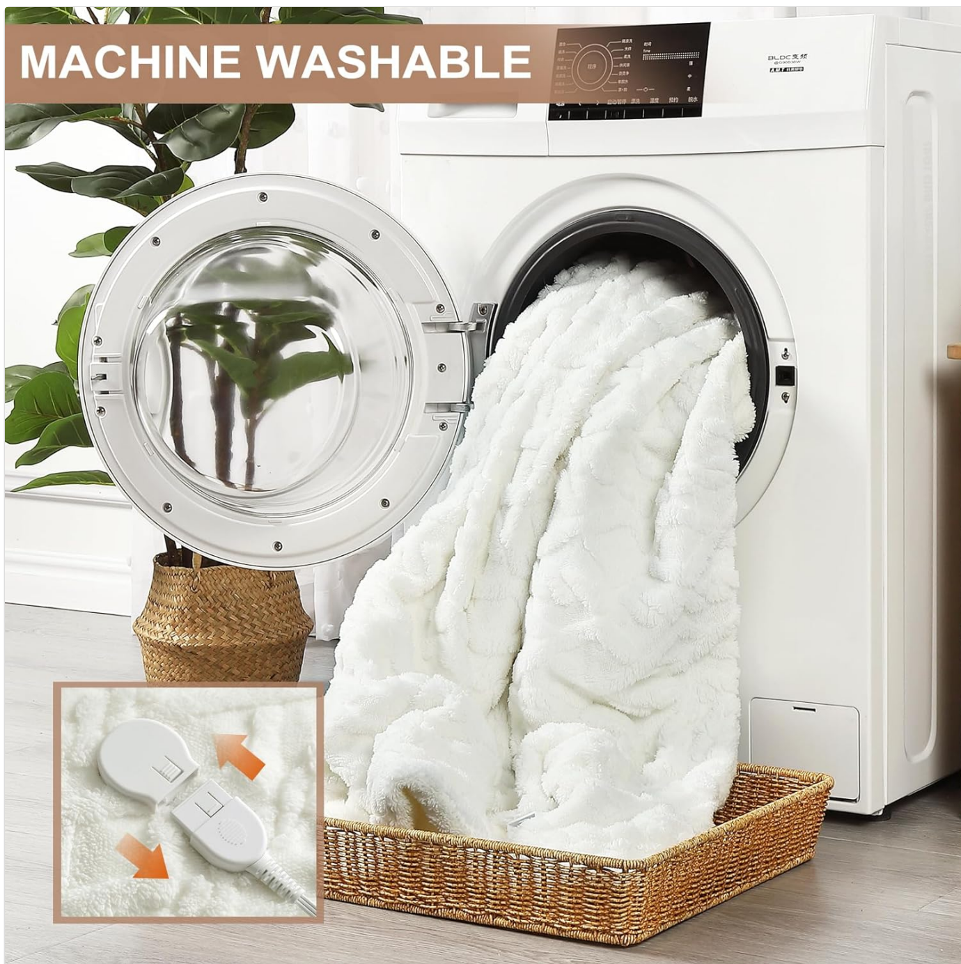
Figure 6: Detaching the controller for machine washing.