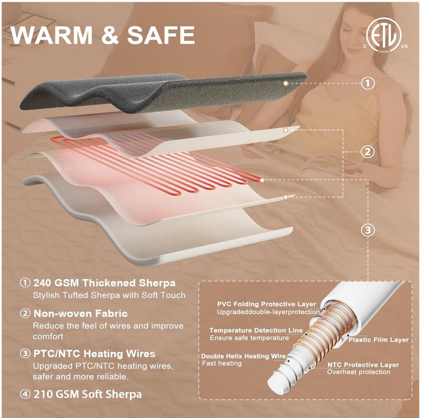
Figure 1: Internal structure and heating wire technology for safety and warmth.