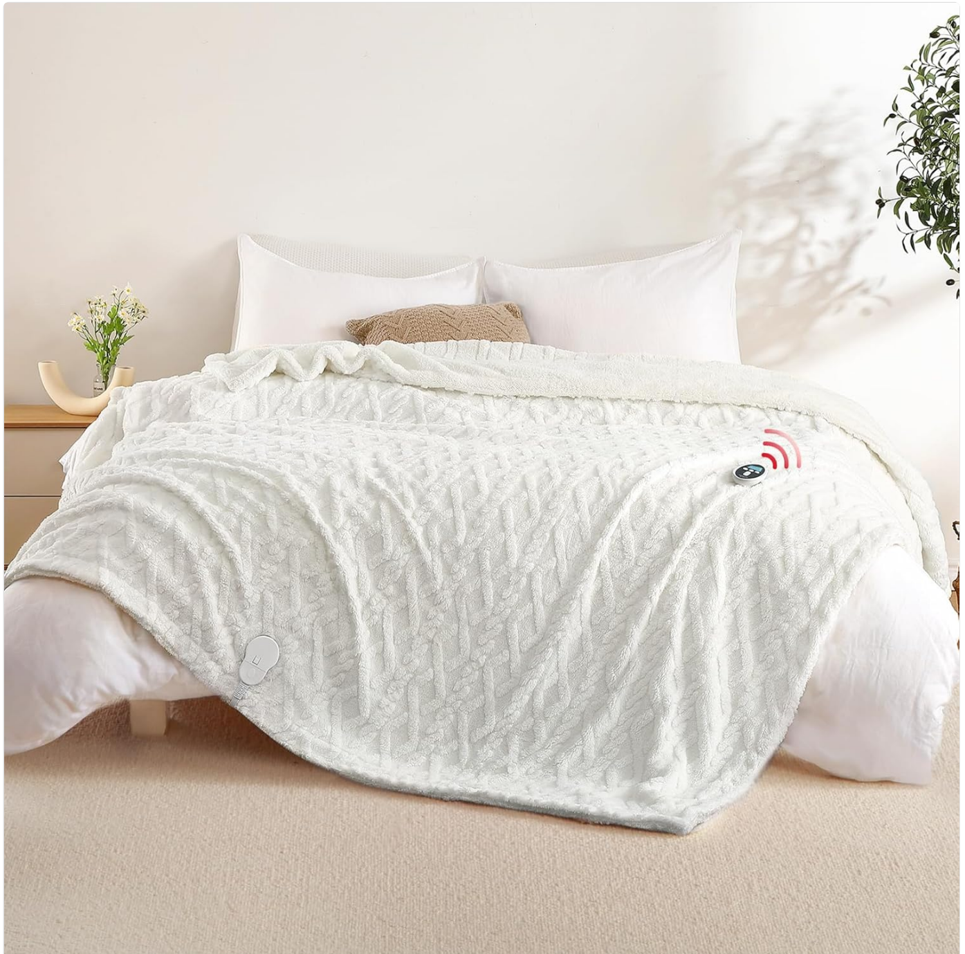
Figure 2: Proper placement of the electric blanket on a bed.