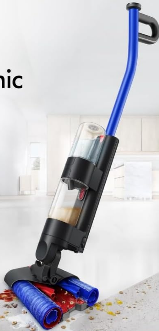
Image: The Dyson Wash G1 in action, demonstrating its ability to clean spills on hard floors. This image highlights the powerful and hygienic floor washing capabilities of the device.