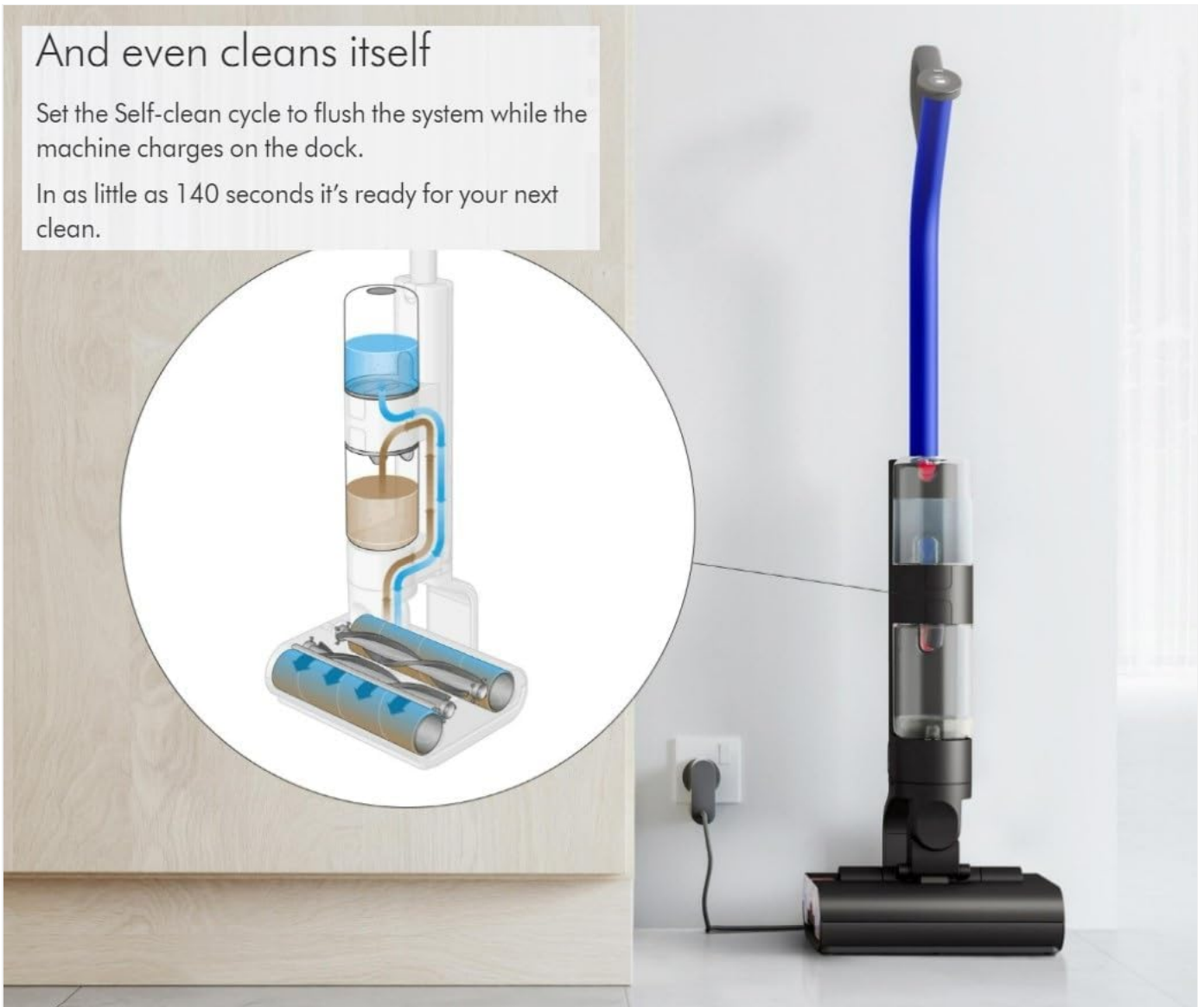
Image: The Dyson Wash G1 positioned on its charging dock, accompanied by a diagram illustrating the self-clean cycle. This visual explains how the machine cleans itself automatically.