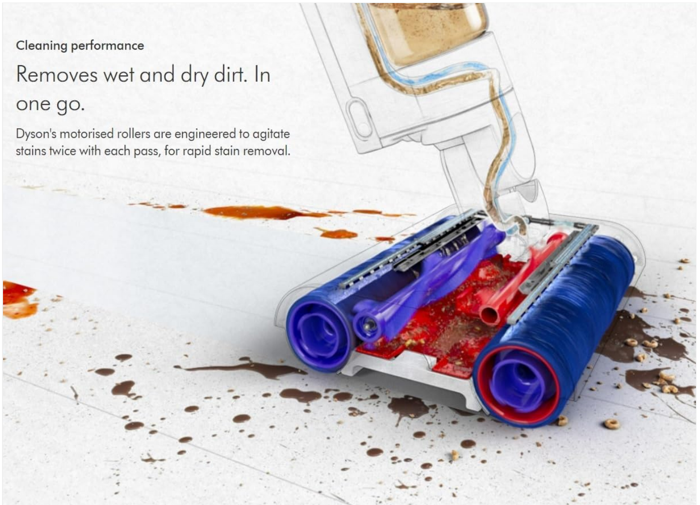
Image: An illustrative diagram detailing the internal mechanism of the Dyson Wash G1, specifically how it separates wet and dry dirt during the cleaning process. This highlights the efficient debris management system.

Dyson's motorised rollers are engineered to agitate stains twice with each pass, for rapid stain removal.