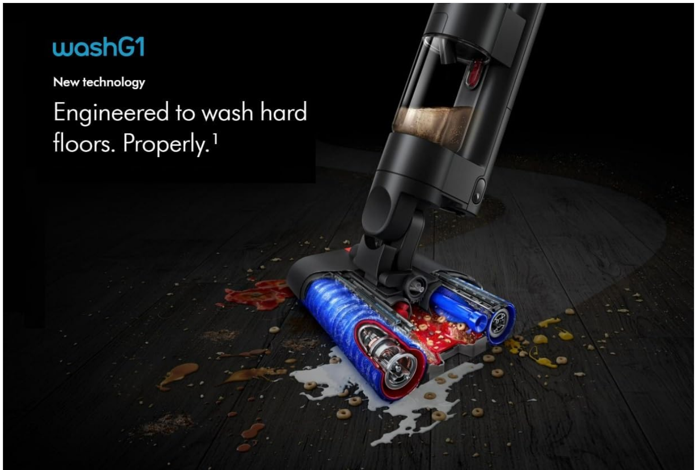
Image: A detailed view of the Dyson Wash G1's cleaning head, showing the counter-rotating rollers actively cleaning a spill. This illustrates the advanced technology designed for effective hard floor washing.

Select the desired mode using the mode selection button on the handle. The hydration level will adjust accordingly, ensuring optimal water distribution across the rollers.