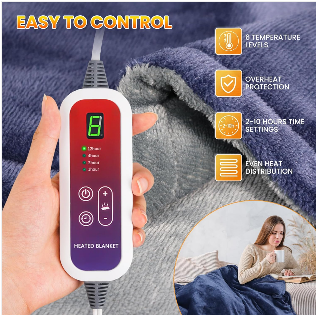
Image: A detailed view of the heated blanket's controller, showing the digital display for heat level and indicator lights for timer settings (1, 2, 4, 12 hours), along with buttons for power, heat adjustment, and timer control.