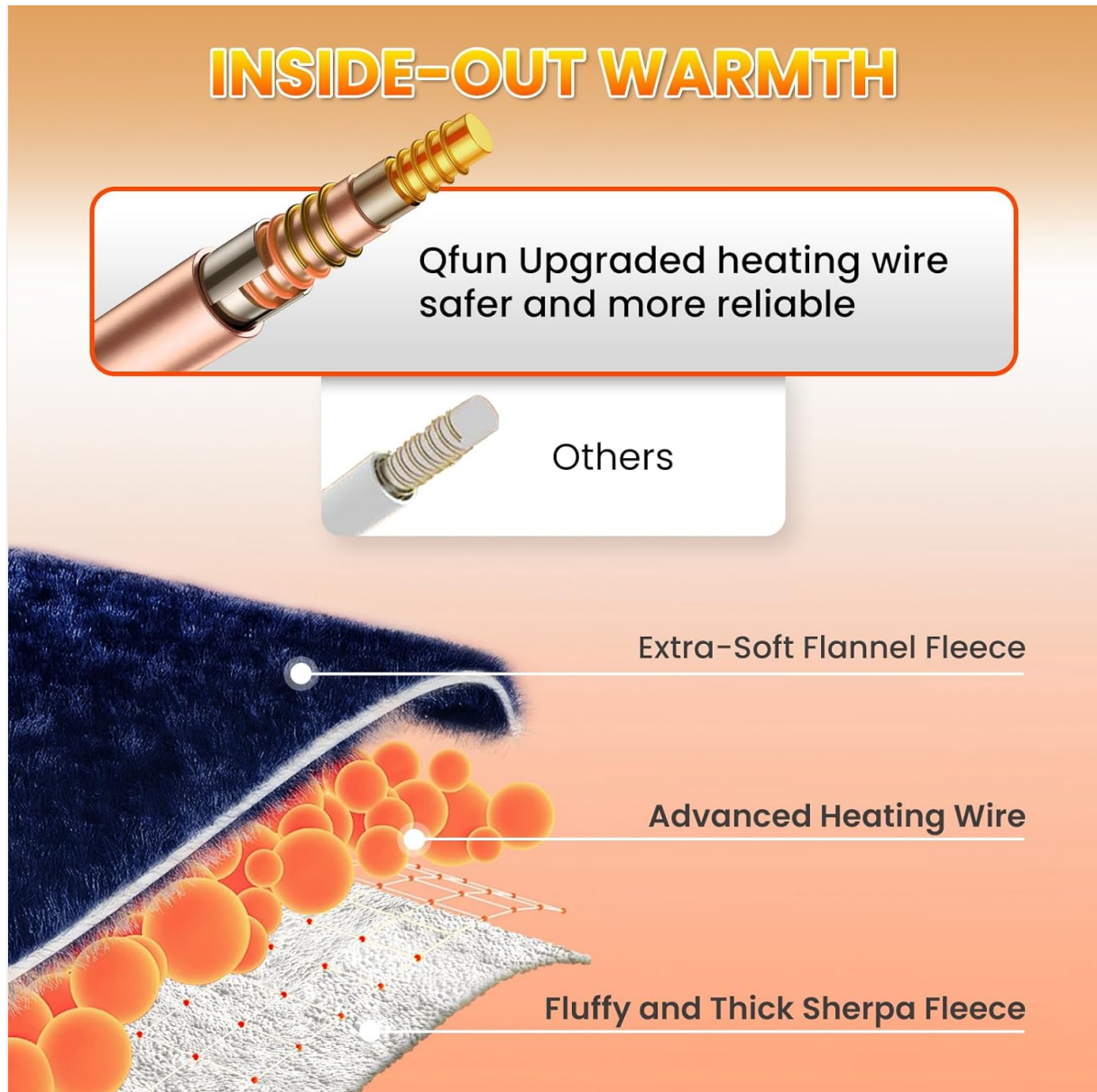
Image: An exploded view diagram illustrating the construction of the Qfun heated blanket, highlighting its layers: extra-soft flannel fleece, advanced heating wires for even distribution, and fluffy Sherpa fleece for warmth.

The blanket features advanced dual-helix technology for consistent and even heat distribution, ensuring no cold spots.