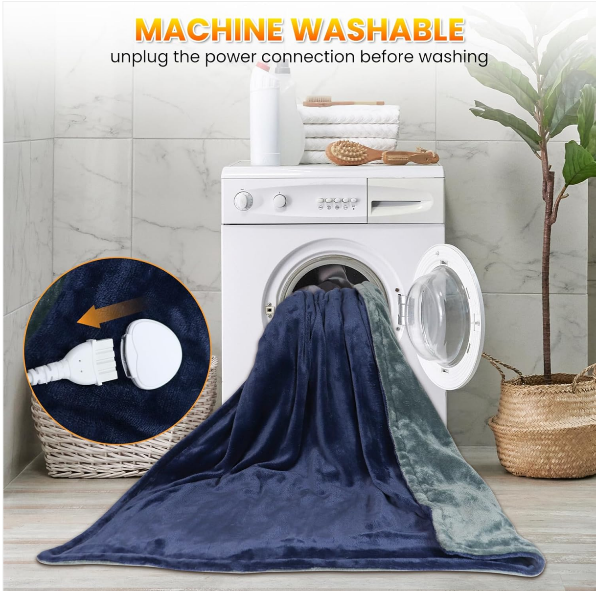
Image: The Qfun heated blanket being prepared for washing, with an emphasis on detaching the power connection before placing it into a washing machine, illustrating its machine-washable feature.