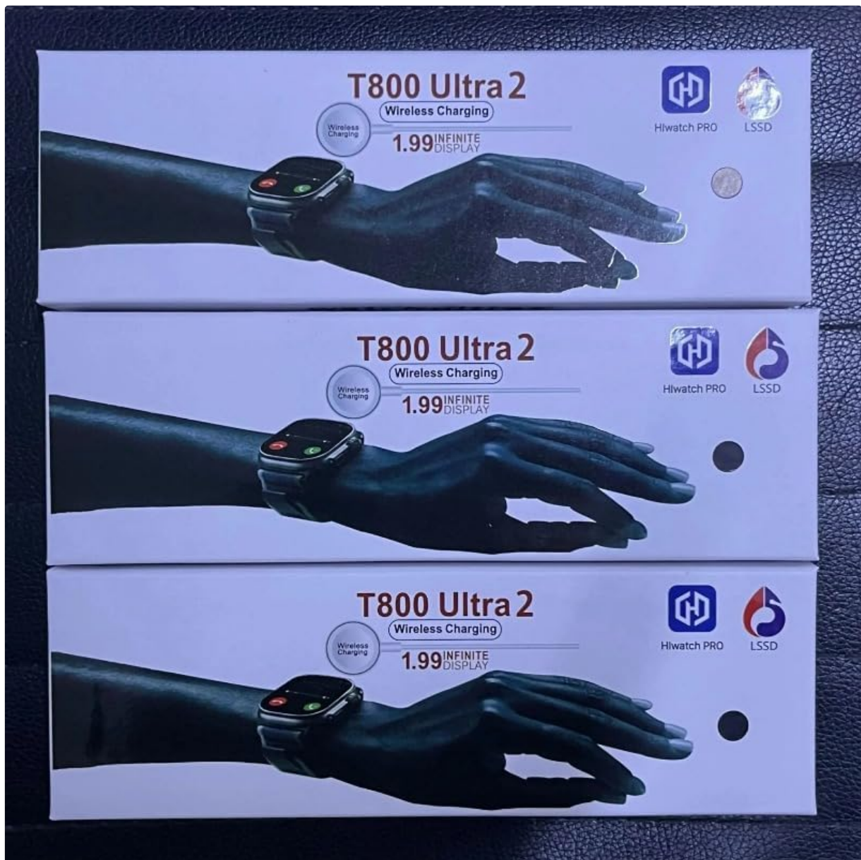
Figure 2: Smartwatch and accessories in retail box