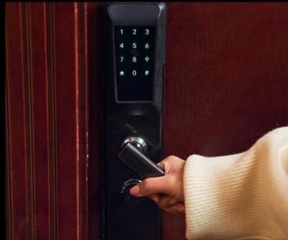
NFC access card