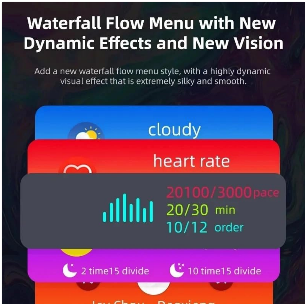
Figure 3: Dynamic Waterfall Flow Menu