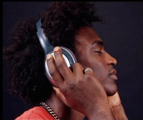
play and switch music.