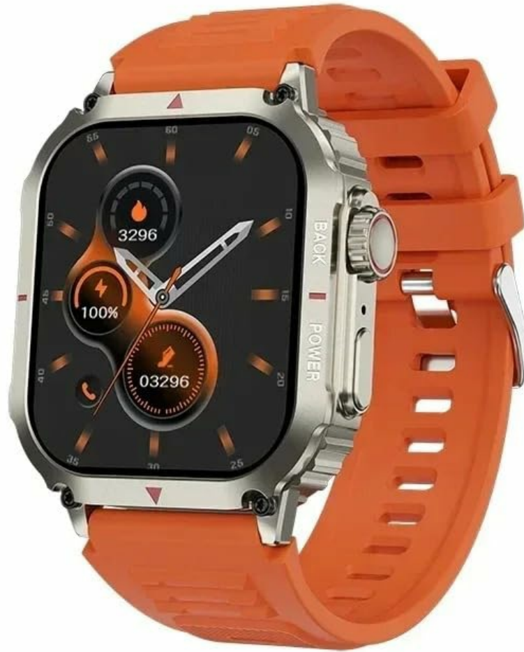
Figure 1: JINSHANGZI T800 Ultra 2 Smartwatch