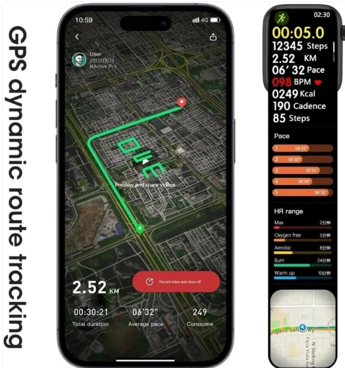
Figure 5: GPS dynamic route tracking via the app