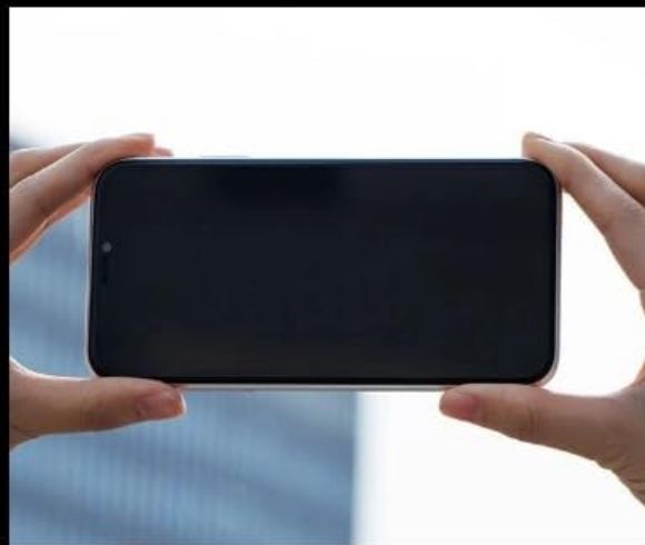
Remote camera control