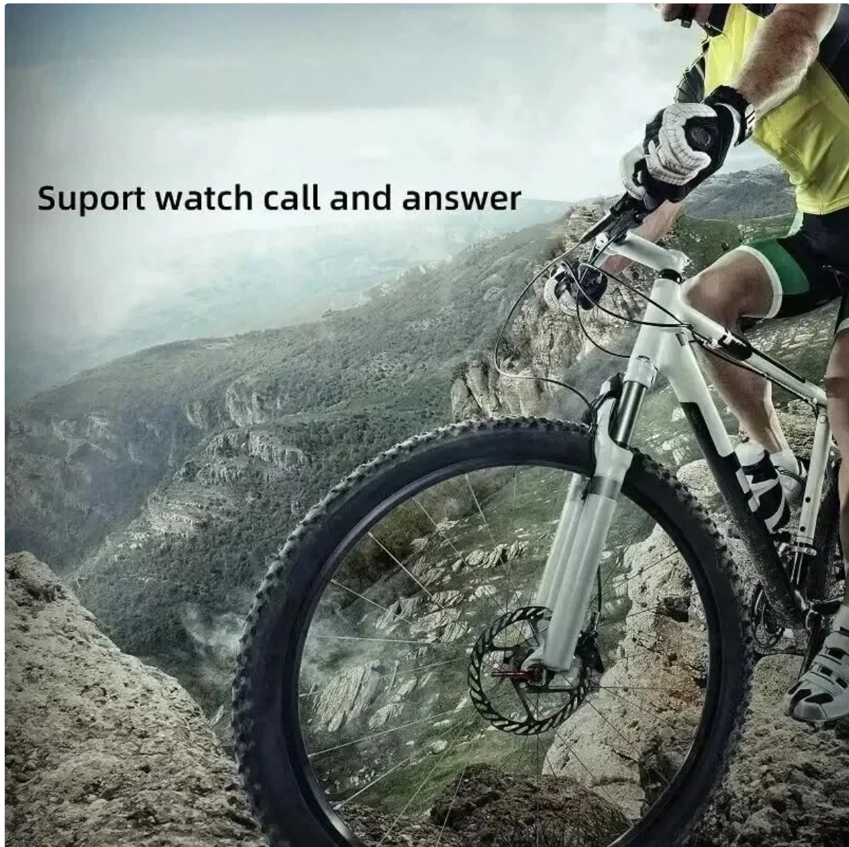
Figure 4: Using the call function while cycling