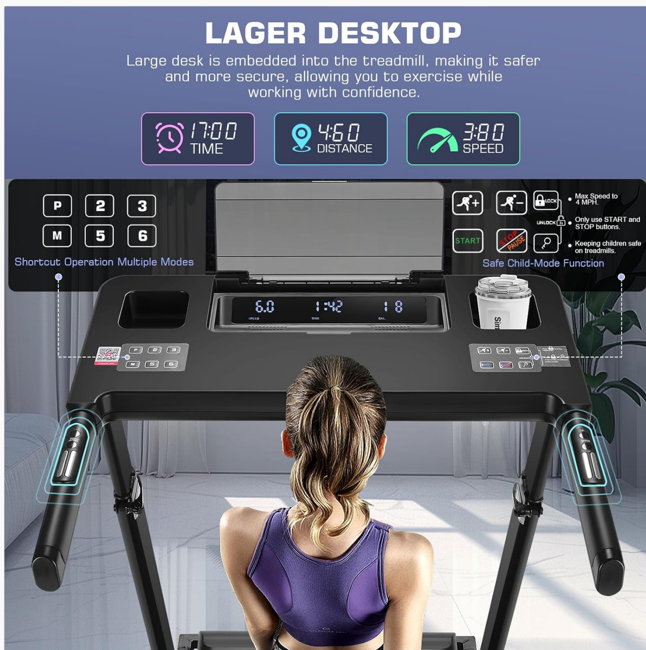
Figure 4.1: The control panel with LED display, showing time, distance, and speed, along with various control buttons.