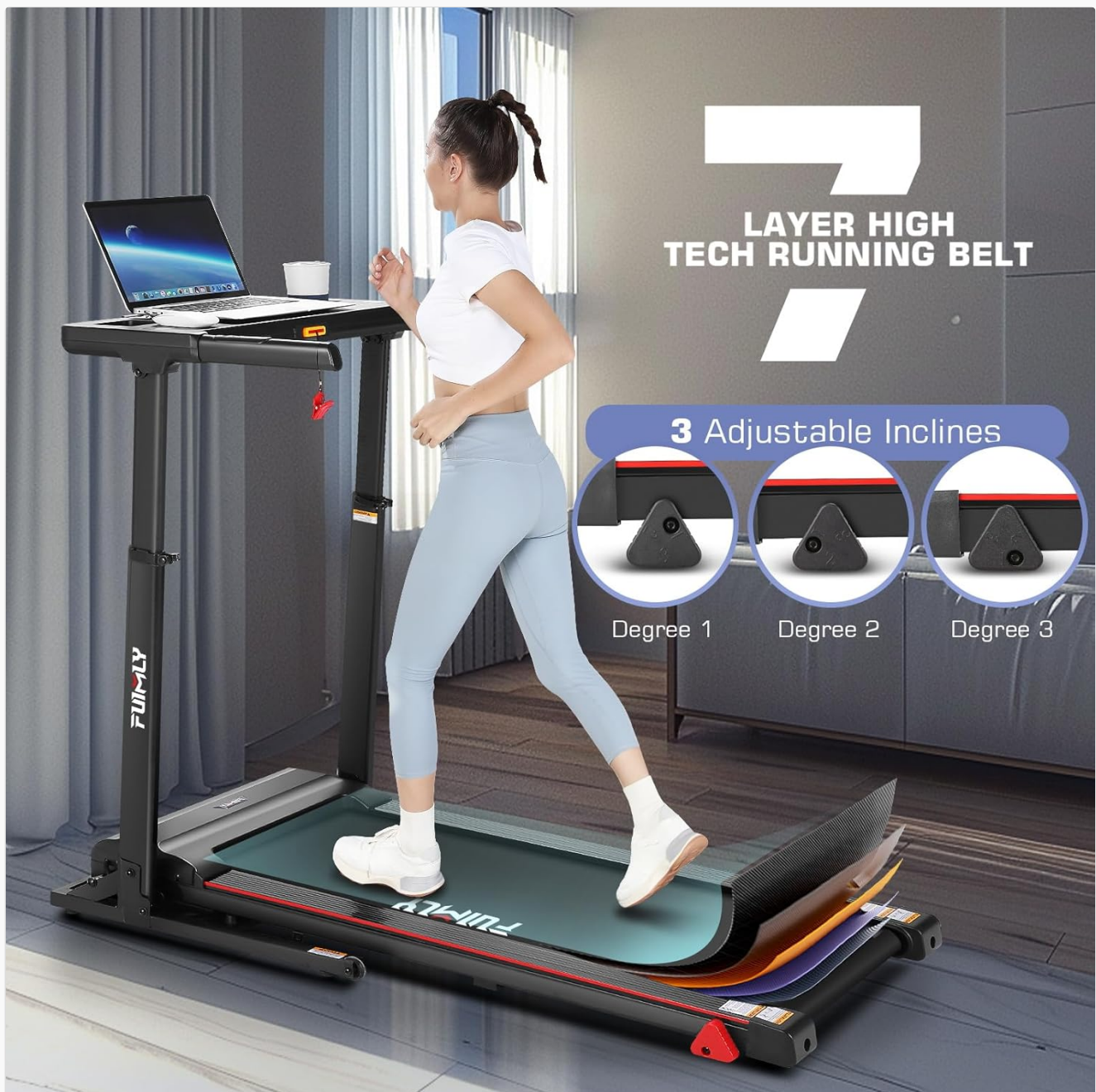
Figure 4.2: The 7-layer running belt construction and the three manual incline adjustment options.