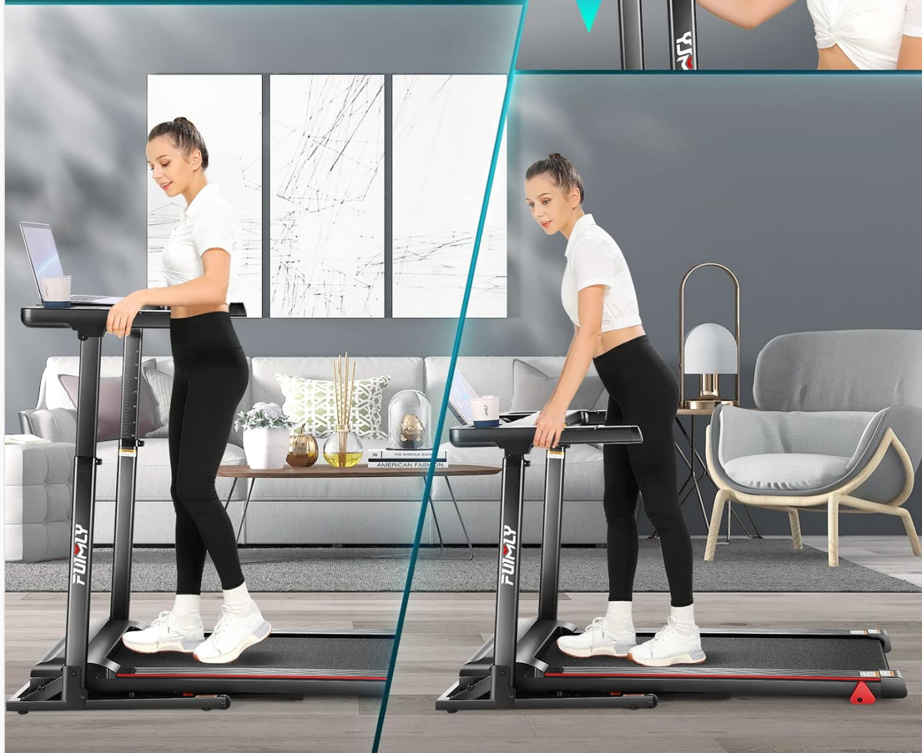
Figure 3.1: Illustration of the adjustable desk height mechanism, ranging from 33.5 to 49.6 inches.

— Meet the Height Requirements of Family Members