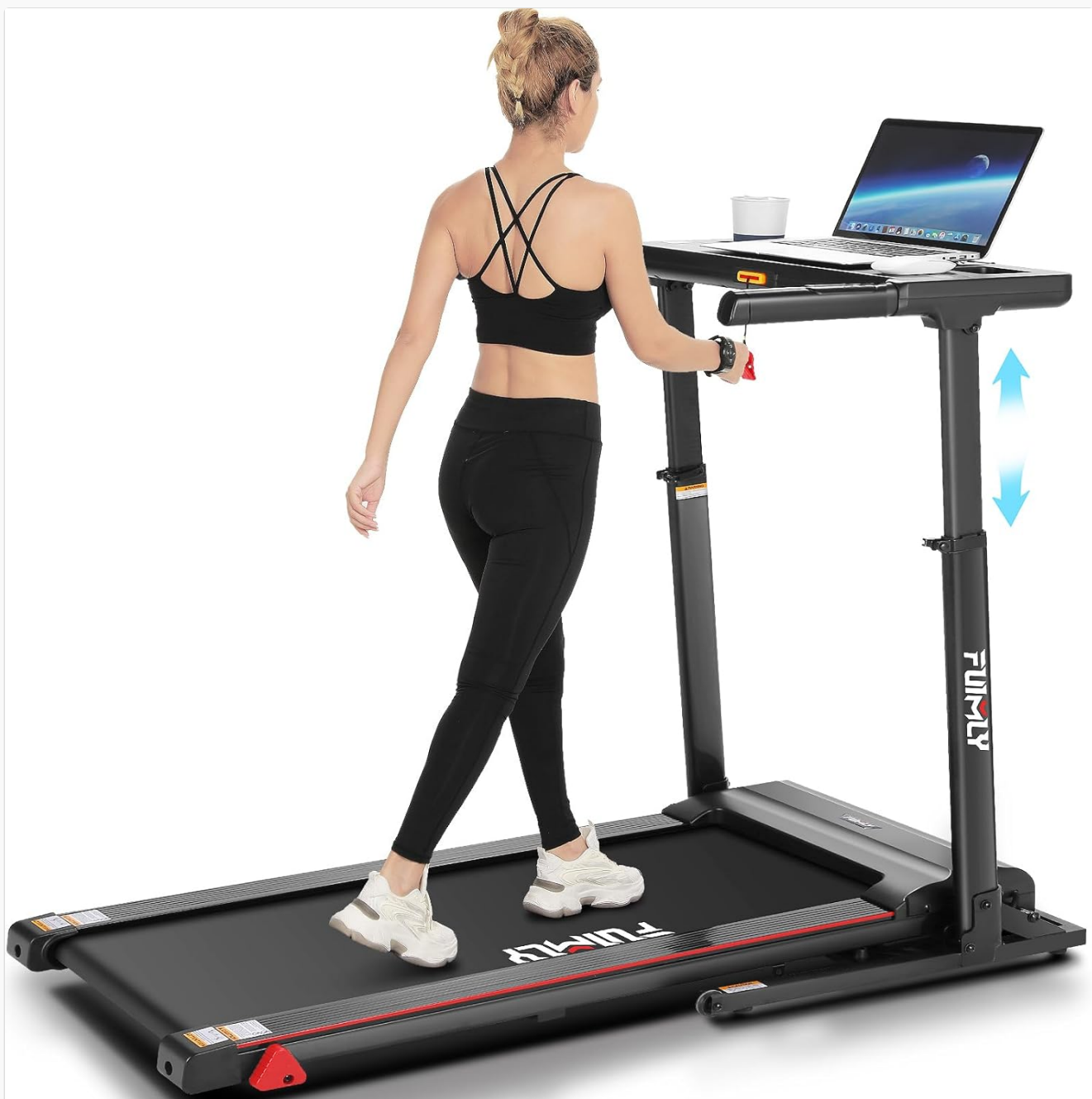
Figure 2.1: Overview of the FUNMILY Walking Pad Treadmill with its integrated adjustable desk.