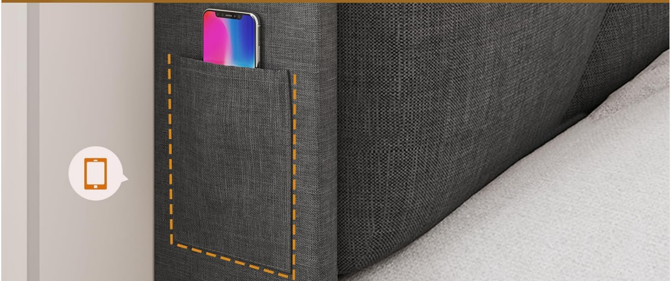
Image: Close-up of the side pockets on the headboard, designed to hold a remote control and a smartphone.