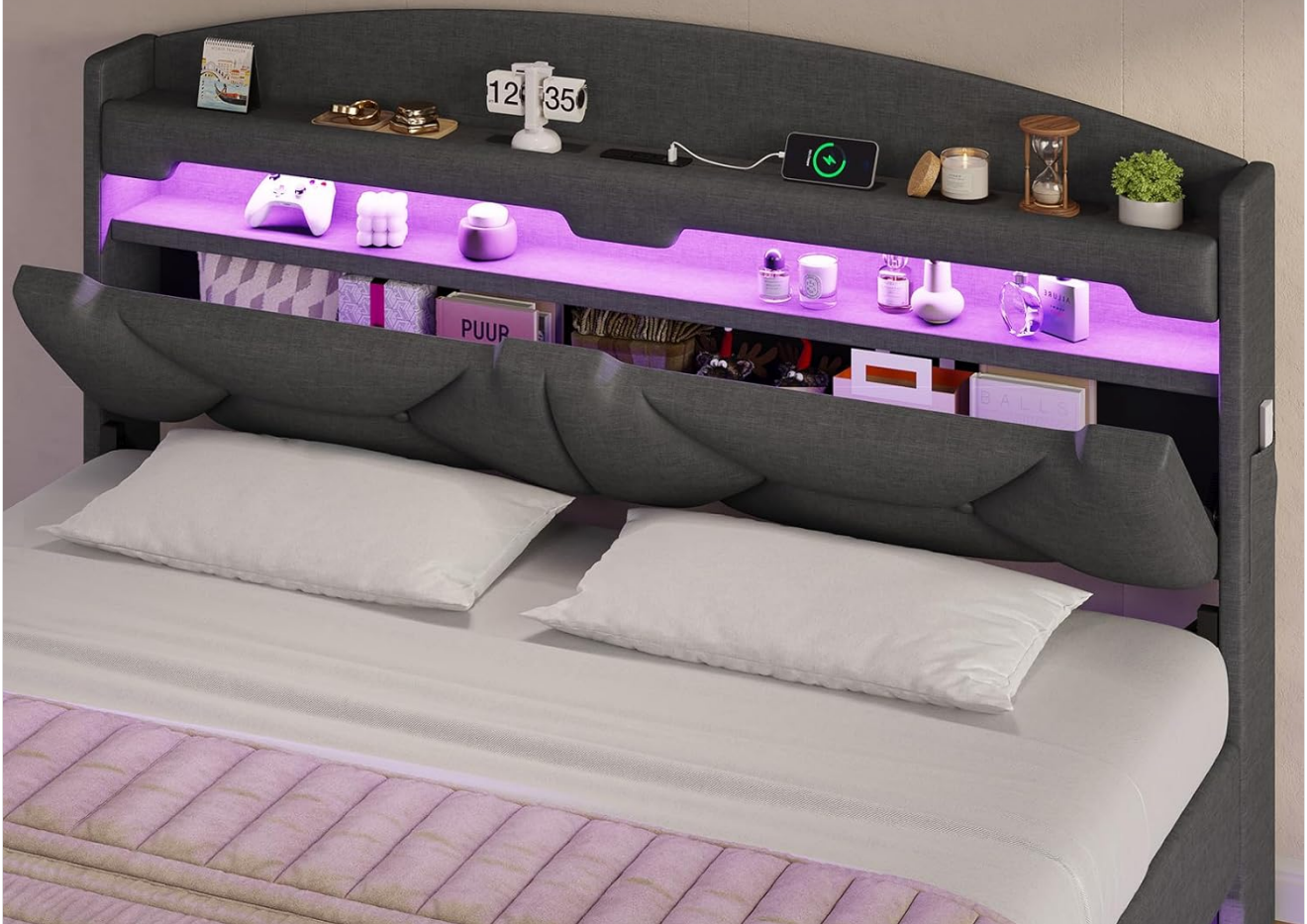
Image: The headboard featuring an open shelf and a hidden storage cubby, revealing items stored within.