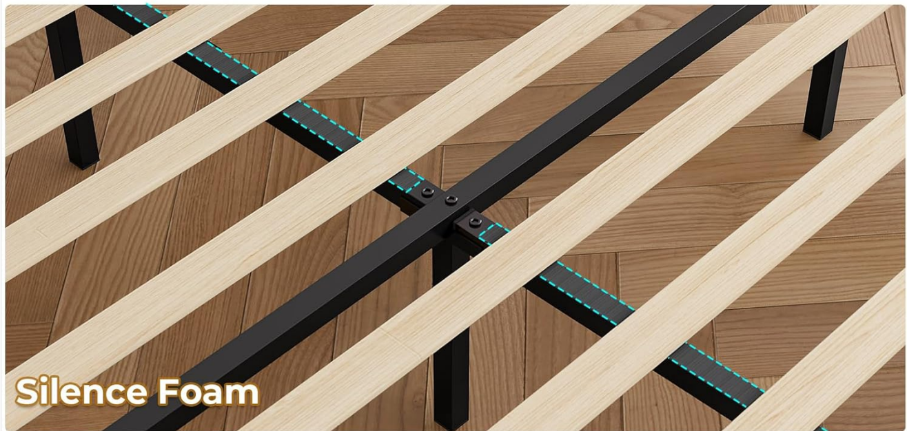
Image: Close-up of the innovative bed frame structure, showing Velcro slats and silence foam for noise reduction.