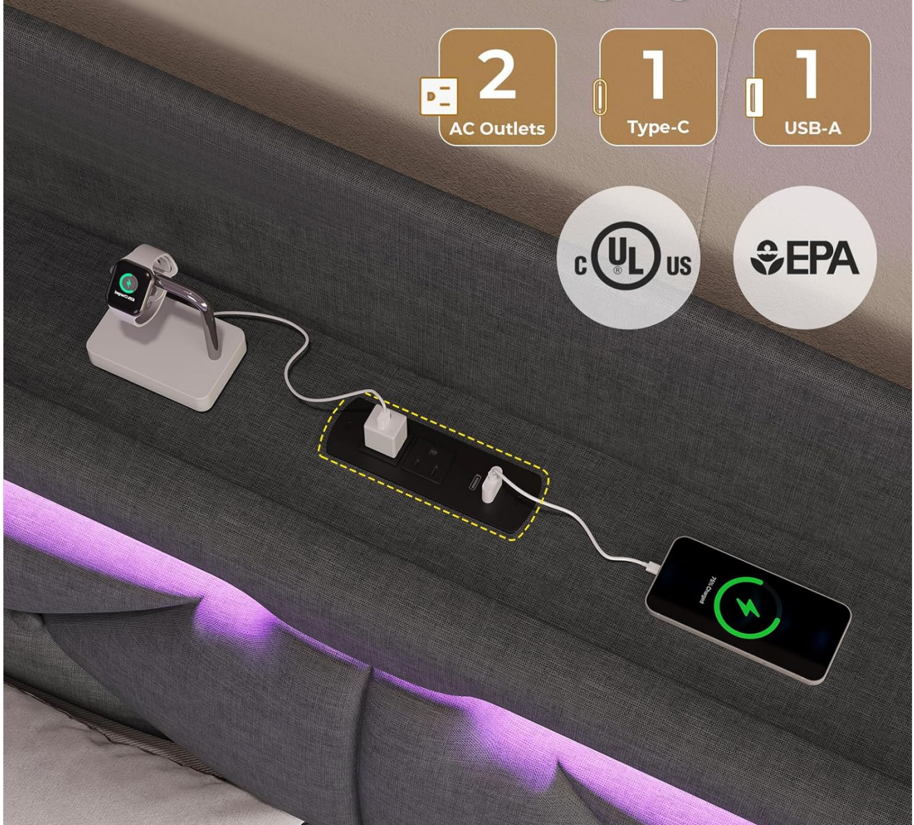
Image: Close-up of the functional charging station integrated into the headboard, showing AC outlets, USB-A, and Type-C ports.