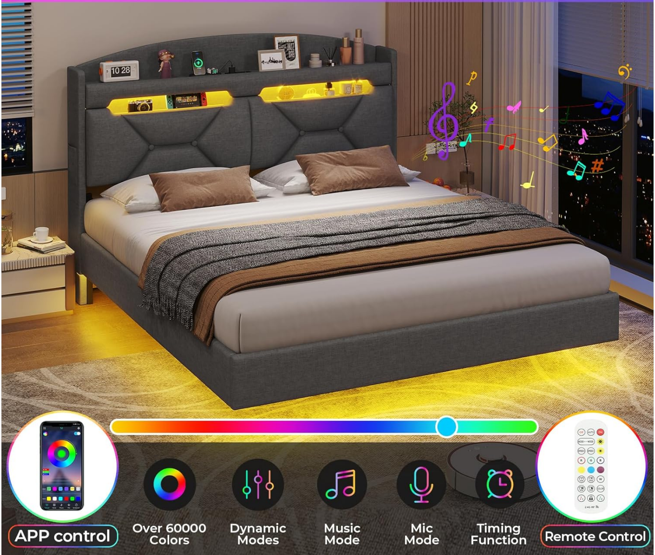
Image: Overview of the RGB lighting system, showing the bed frame illuminated and options for remote and app control.

The lights flash, dance, and change color in tune with the beat of your music