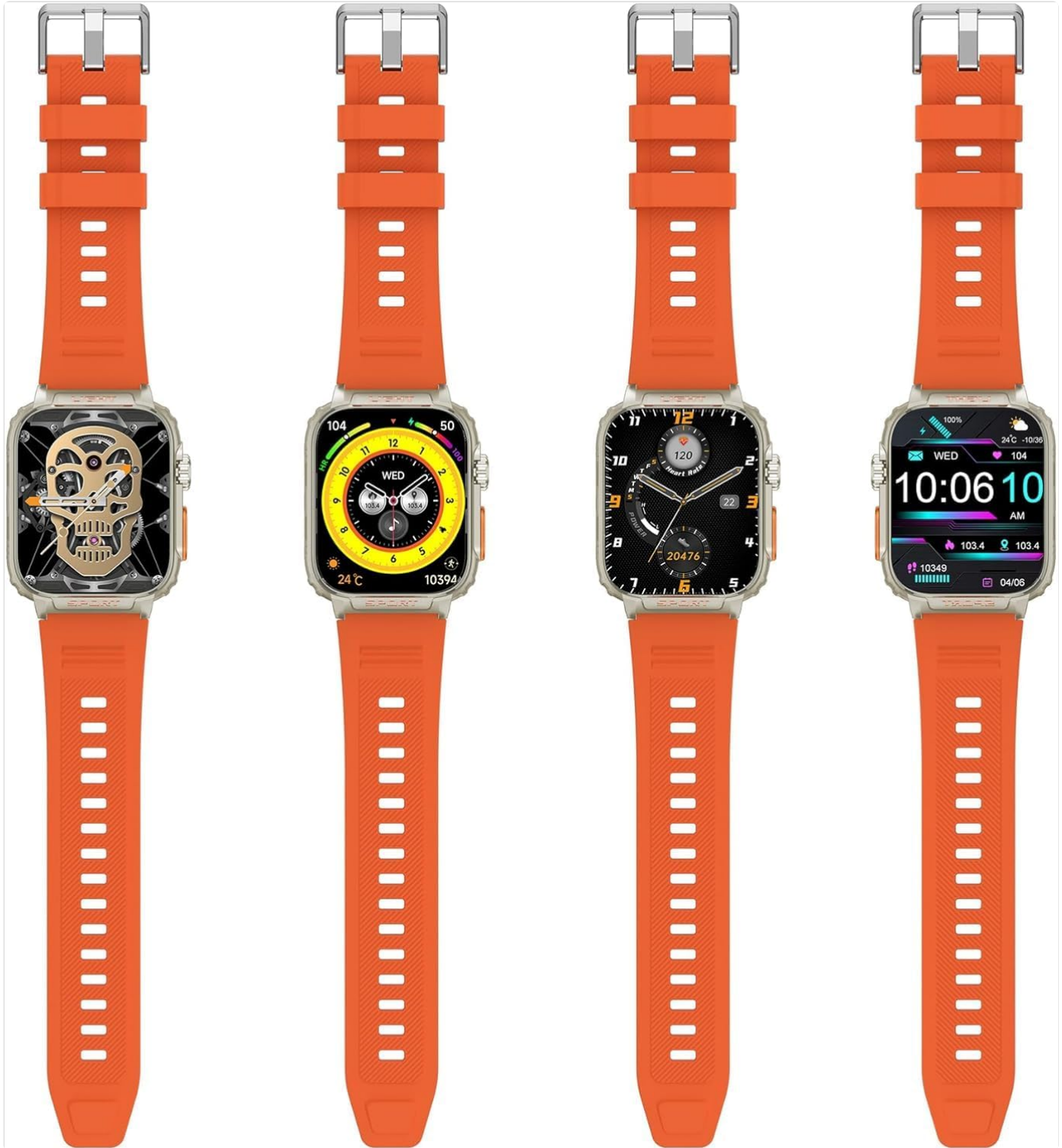
Image: A collection of different watch faces available for the VIRAN Smart Watch W101, showcasing customization options.