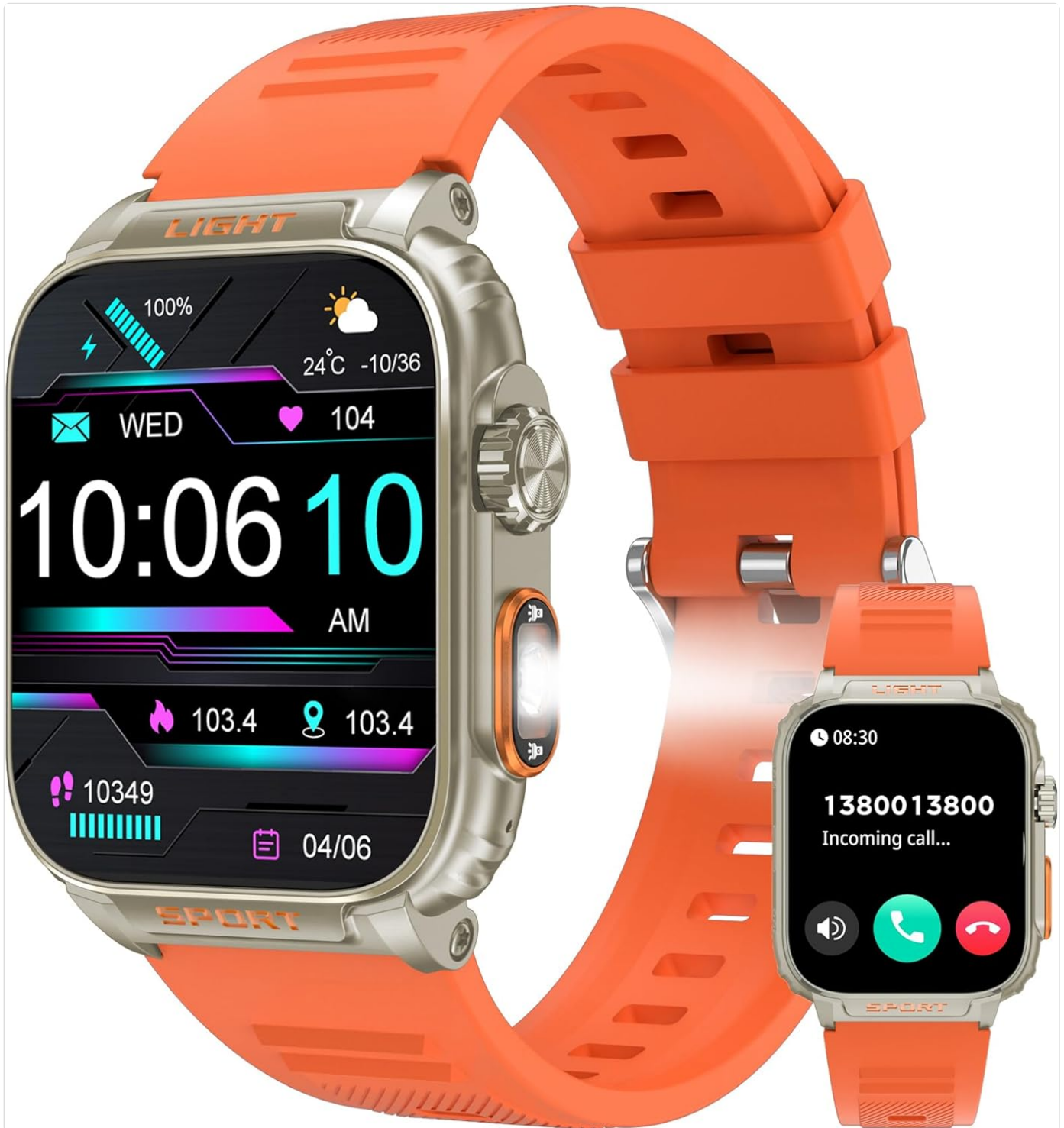
Image: The VIRAN Smart Watch W101 main display, showing various metrics like time, date, battery level, weather, heart rate, and step count.