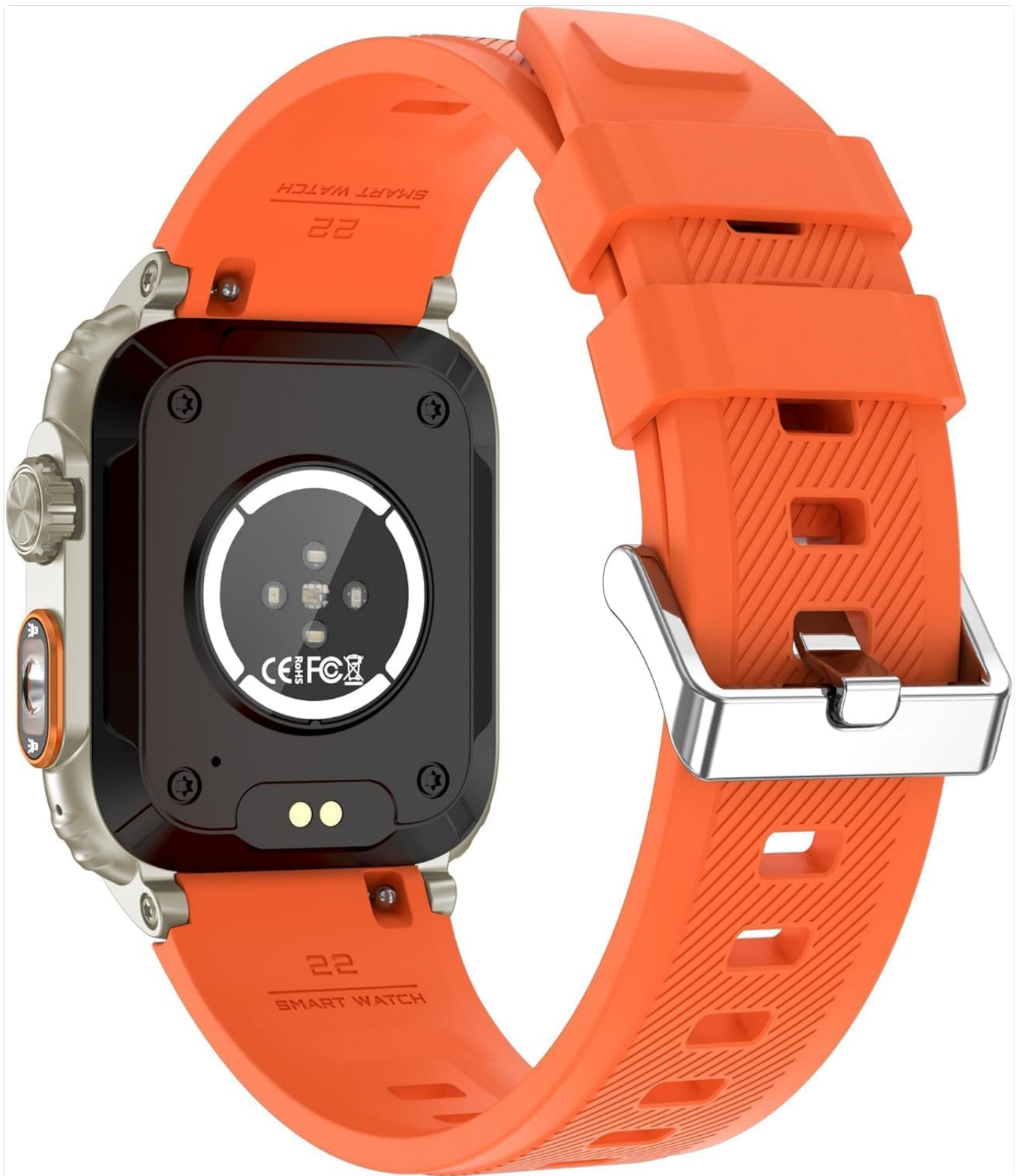
Image: The back of the VIRAN Smart Watch W101, displaying the optical heart rate sensor and two magnetic charging pins.