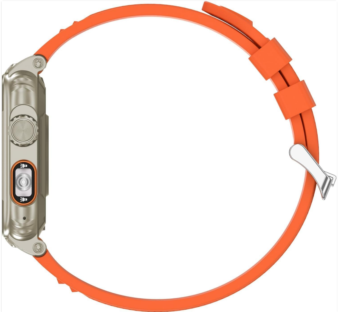
Image: Side profile of the VIRAN Smart Watch W101, highlighting the rotatable crown and the dedicated flashlight button.