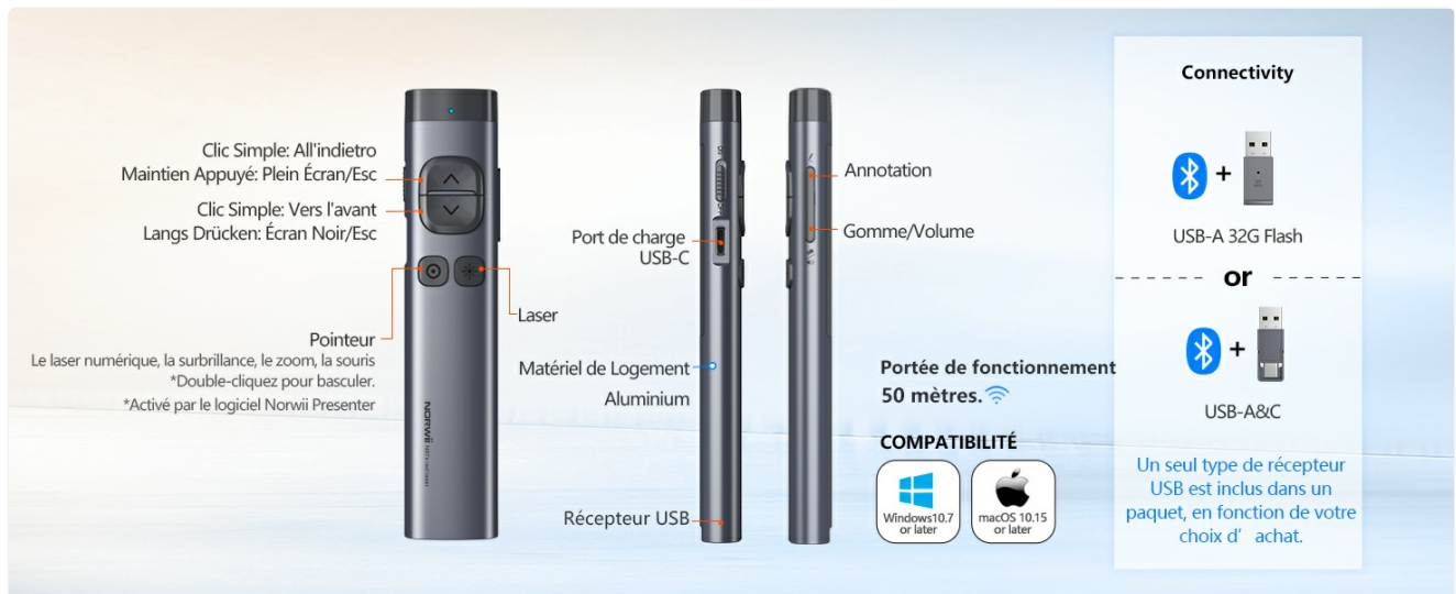
Image: Norwii N97 Presentation Clicker with key features labeled.

The Norwii N97 is a versatile wireless presentation clicker designed for seamless control of presentations on both TV screens and projection screens. It features advanced digital pointer capabilities, including highlighting, magnification, and mouse cursor control, all activated via the Norwii Presenter software. The device offers dual connectivity through Bluetooth Low Energy (BLE) and a 2.4G USB-A receiver, ensuring broad compatibility with various operating systems and presentation software.