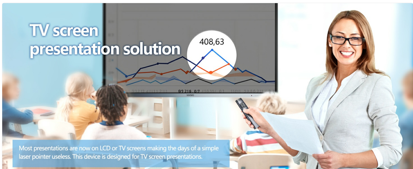
Image: The Norwii N97 demonstrating digital pointer, highlight, and magnifier features on a TV screen.