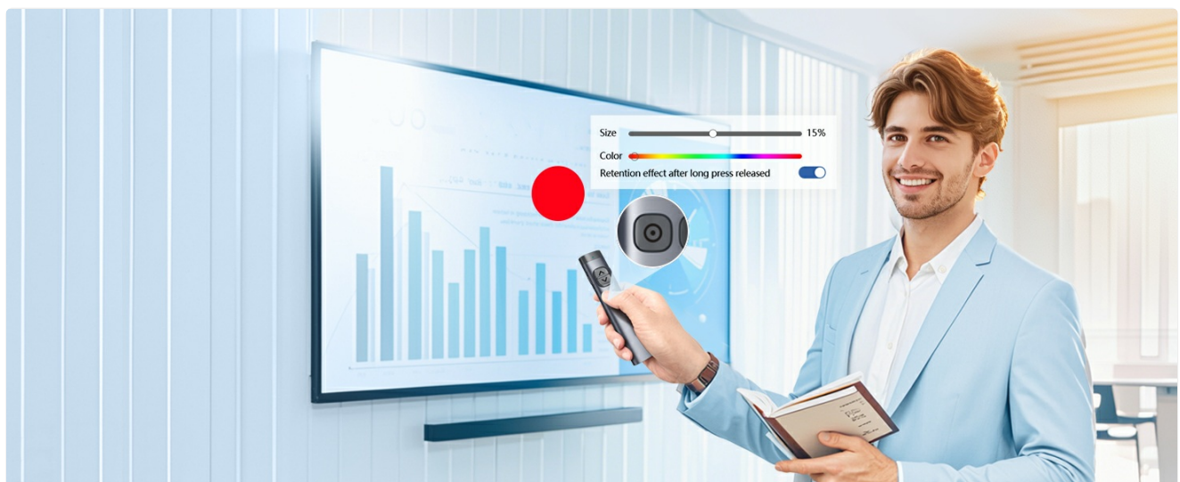
Image: Screenshot of the Norwii Presenter software interface, showing various settings and options.

Ensure the software is running and the presenter is connected for optimal functionality. The software will indicate "Presenter connected" when successfully linked.