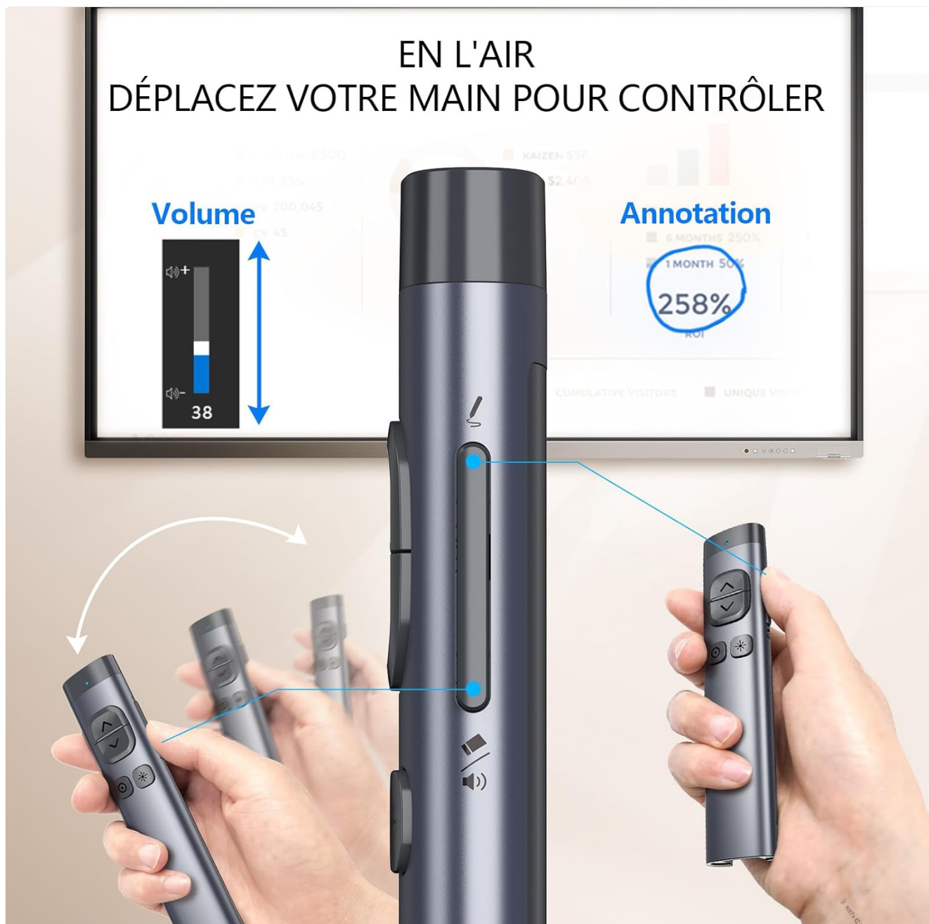
Image: A diagram illustrating the four different modes for the Norwii N97's navigation buttons.