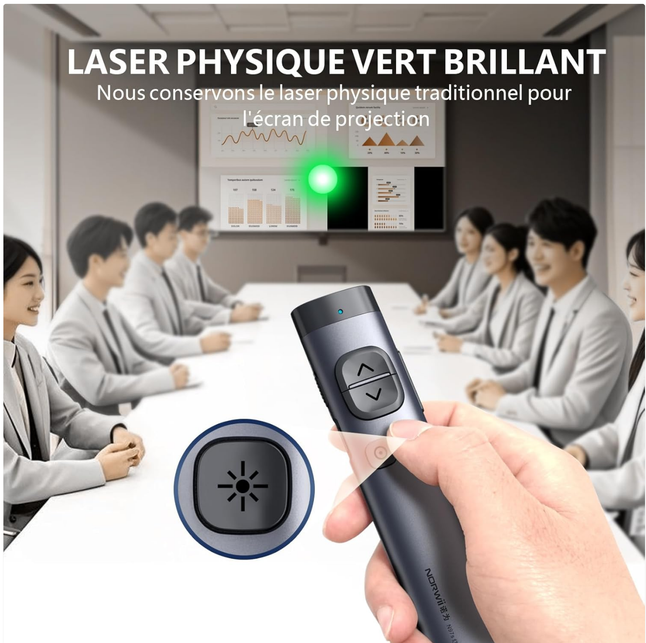
Image: The Norwii N97 emitting a green physical laser on a projection screen during a presentation.

The Norwii N97 includes a traditional green physical laser pointer, ideal for use on projection screens. This feature does not require the Norwii Presenter software.