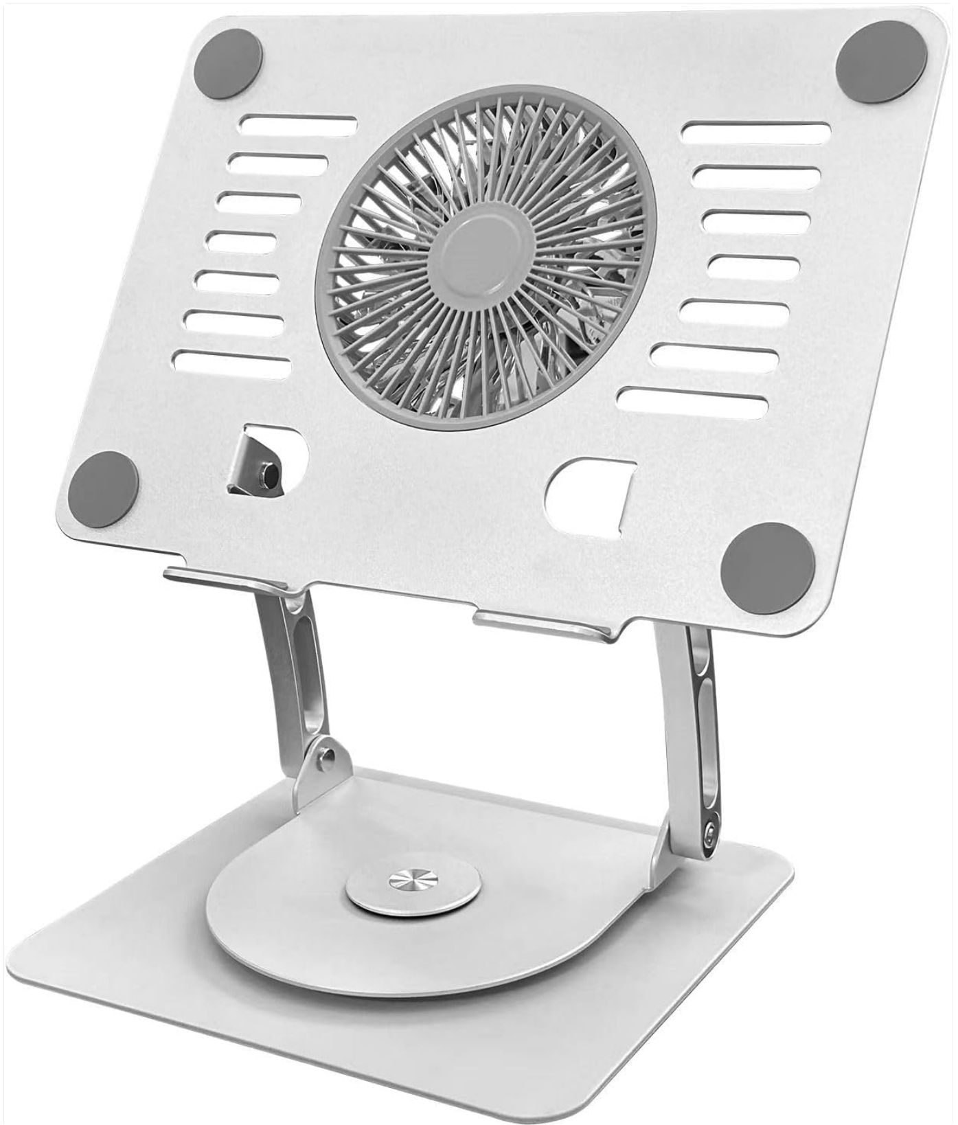
Image 1: Overview of the SHUWEI T628G MAX Laptop Cooling Stand. This image displays the stand in its upright position, highlighting its silver finish, the integrated cooling fan, and the non-slip pads on the laptop platform and base.