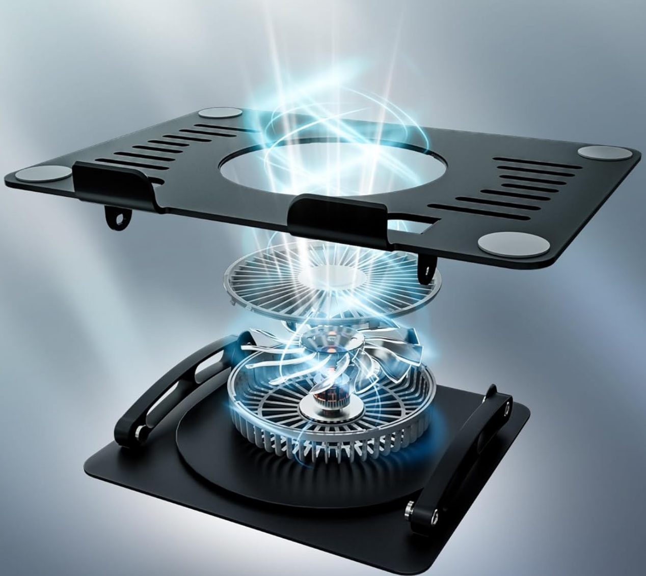
Image 5: Detailed view of the powerful 5.1-inch cooling fan. This image highlights the fan's size and its three-speed functionality, indicating the airflow generated for effective laptop cooling.