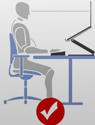
Image 2: Illustration of the stand's adjustable height and angle. This image demonstrates the range of motion for the laptop platform, allowing users to set it between 2 and 11.8 inches in height and tilt it up to 120 degrees for optimal ergonomic viewing.