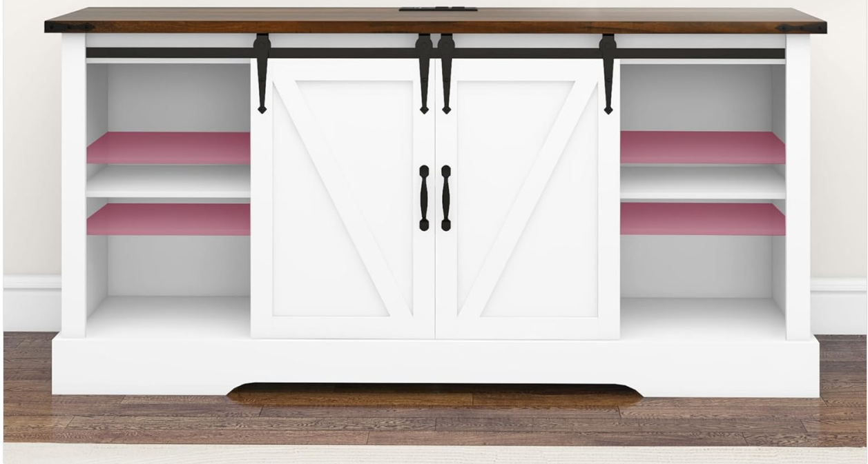
Figure 2: Adjustable shelf mechanism and possible height adjustments.