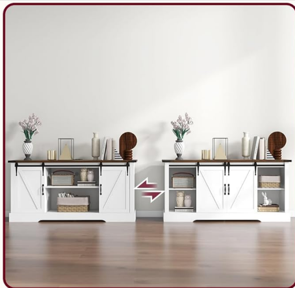
Sliding Barn Door