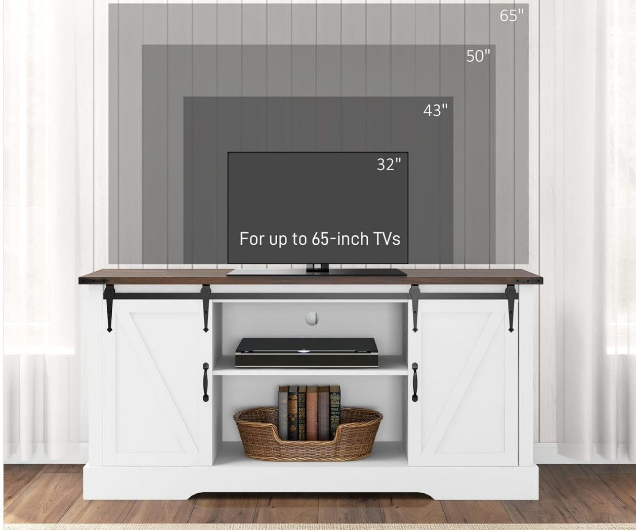
Figure 6: TV size compatibility for the stand, up to 65 inches.