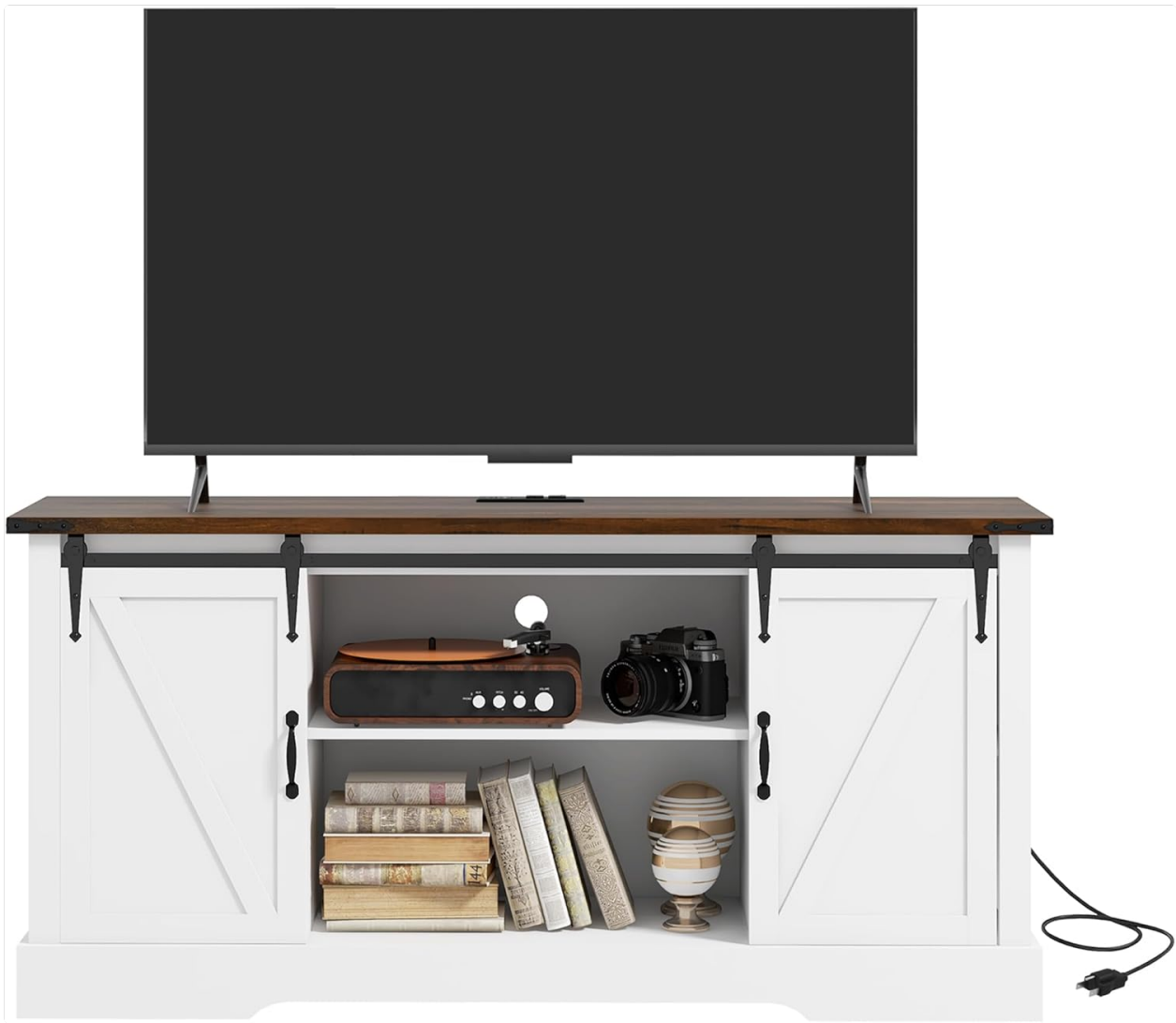
Figure 1: HOMCOM TV Stand Cabinet in a living room setting.