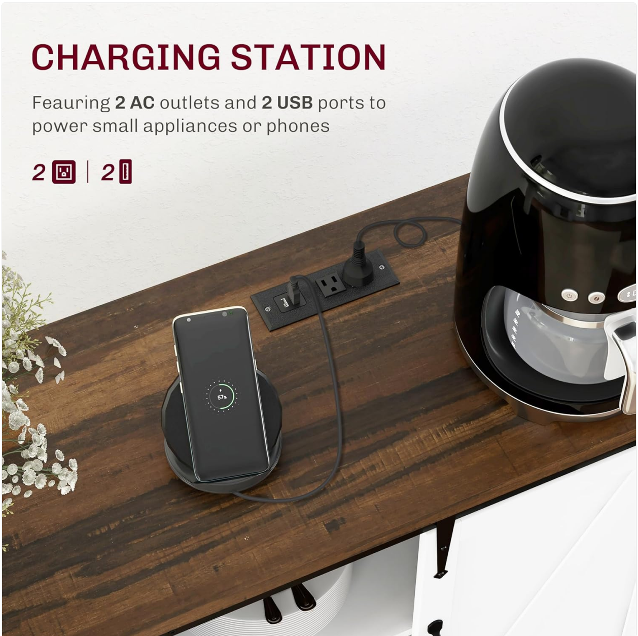
Figure 3: Integrated charging station with AC outlets and USB ports.