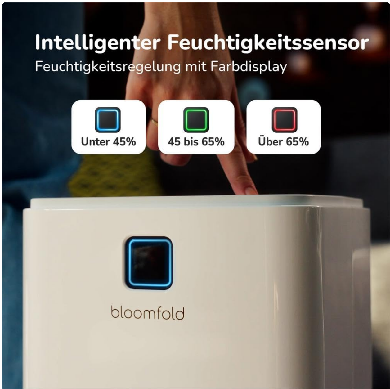
Figure 6.5: The dehumidifier is suitable for use in bathrooms, cellars, living rooms, laundry rooms, and bedrooms.