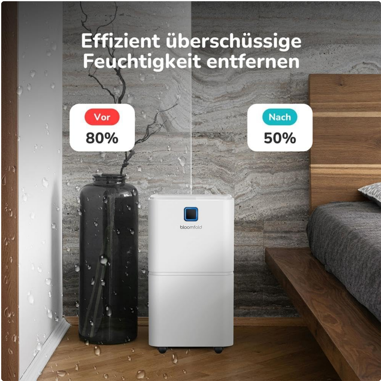
Figure 6.2: The intelligent humidity sensor with color-coded display for current humidity levels.