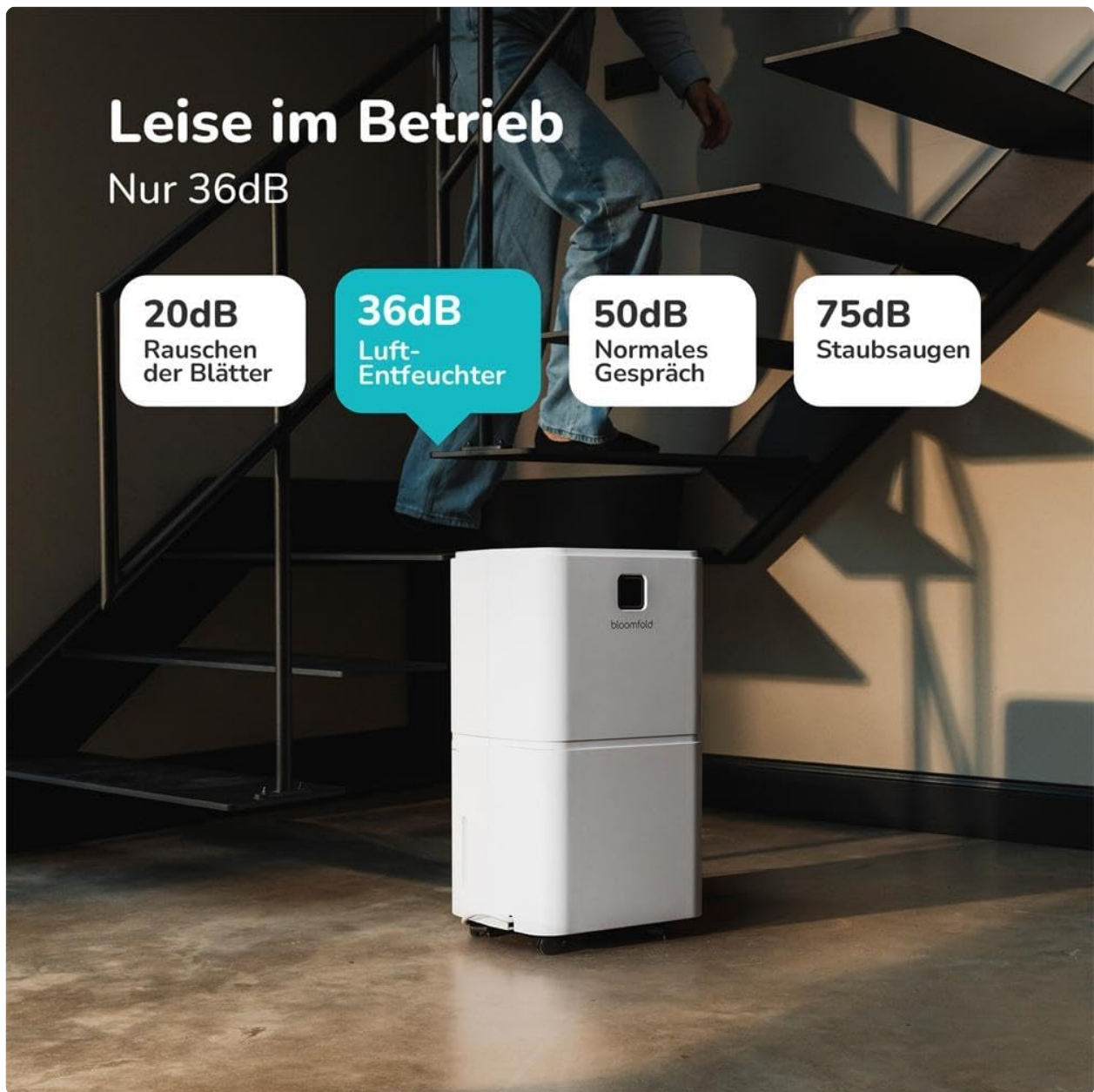
Figure 4.2: Key features of the Bloomfold Dehumidifier, including mold prevention, laundry drying, quiet operation, and energy efficiency.