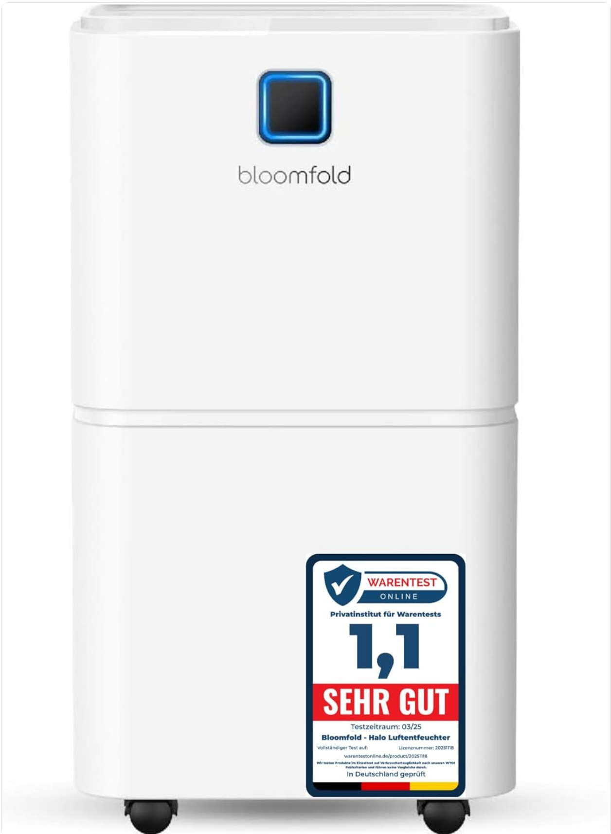
Figure 4.1: Front view of the Bloomfold 12L Dehumidifier.