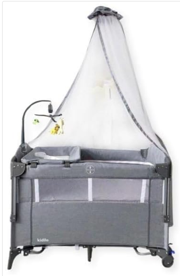
Figure 2: Kidilo Baby Bed P02 in co-sleeping configuration.