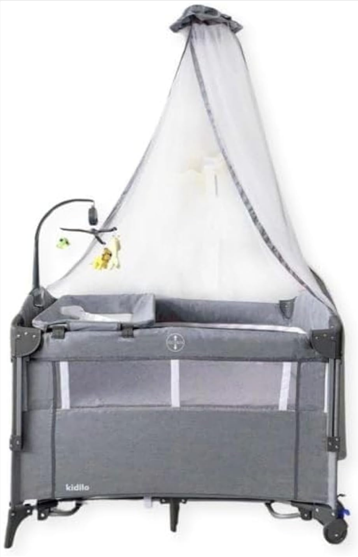
Figure 1: Fully assembled Kidilo Baby Bed P02 with all accessories.