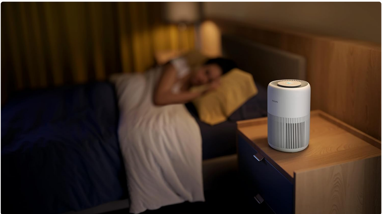
Image: Air purifier operating quietly in a bedroom at night, demonstrating Sleep Mode.