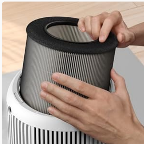
Image: A hand demonstrating the process of replacing the air filter in the purifier.