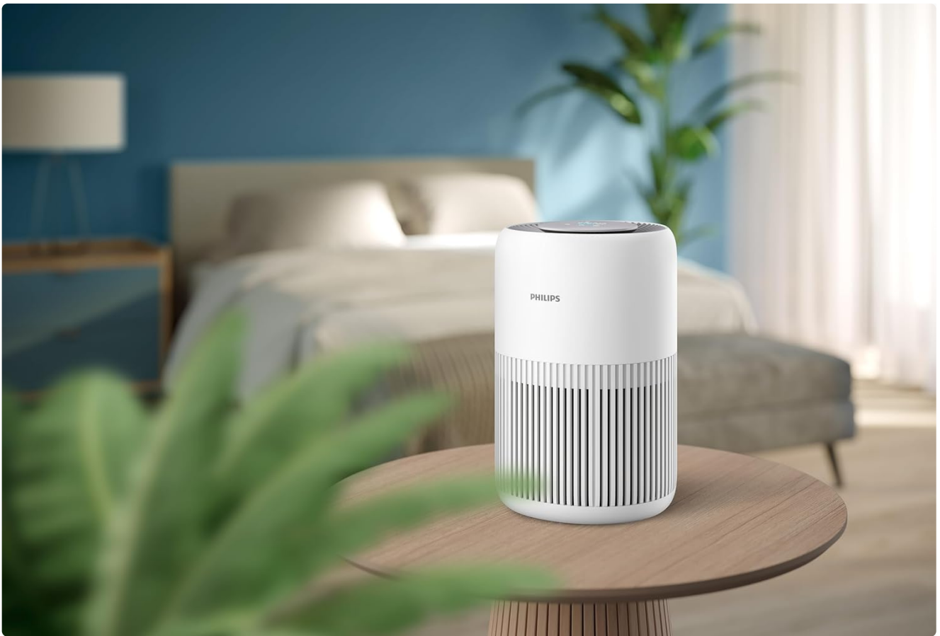
Image: Air purifier positioned on a bedside table in a bedroom, illustrating suitable placement.