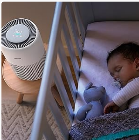
Image: Air purifier placed near a baby's crib, highlighting its quiet operation and child-friendly features.

display will show a lock icon. To deactivate, press and hold the button again for 3 seconds.