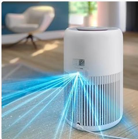
Image: Rear view of the air purifier demonstrating air intake and purification process.