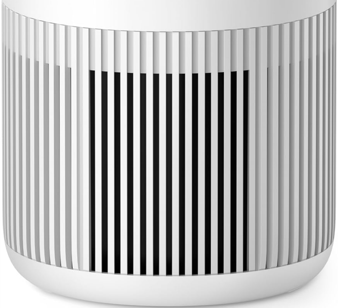
Image: Front view of the Philips PureProtect Mini Air Purifier, showing the control panel on top and air intake grille.