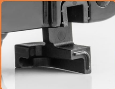
Sturdy Support Legs