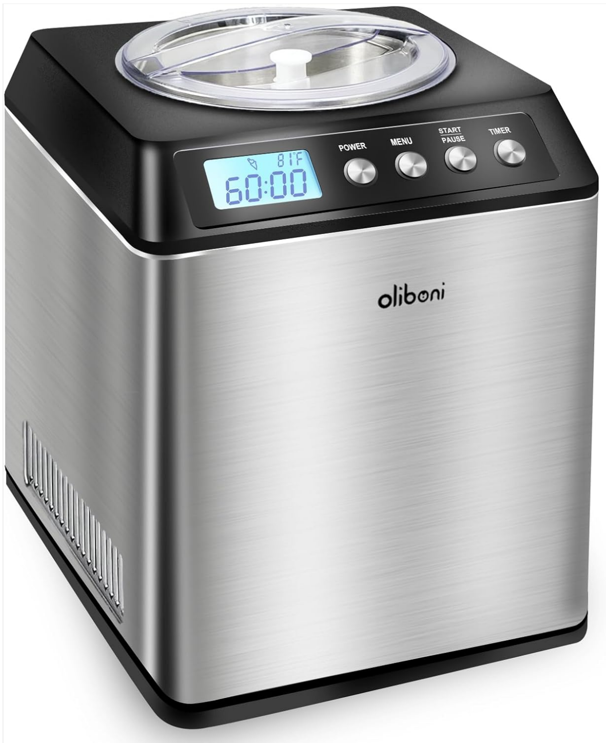
Image: The Oliboni 2.6 Qt Ice Cream Maker, a compact stainless steel appliance with a digital display and control buttons on top.