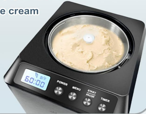
Image: A view of the ice cream maker's internal bucket and mixing blade, showing where ingredients are added.