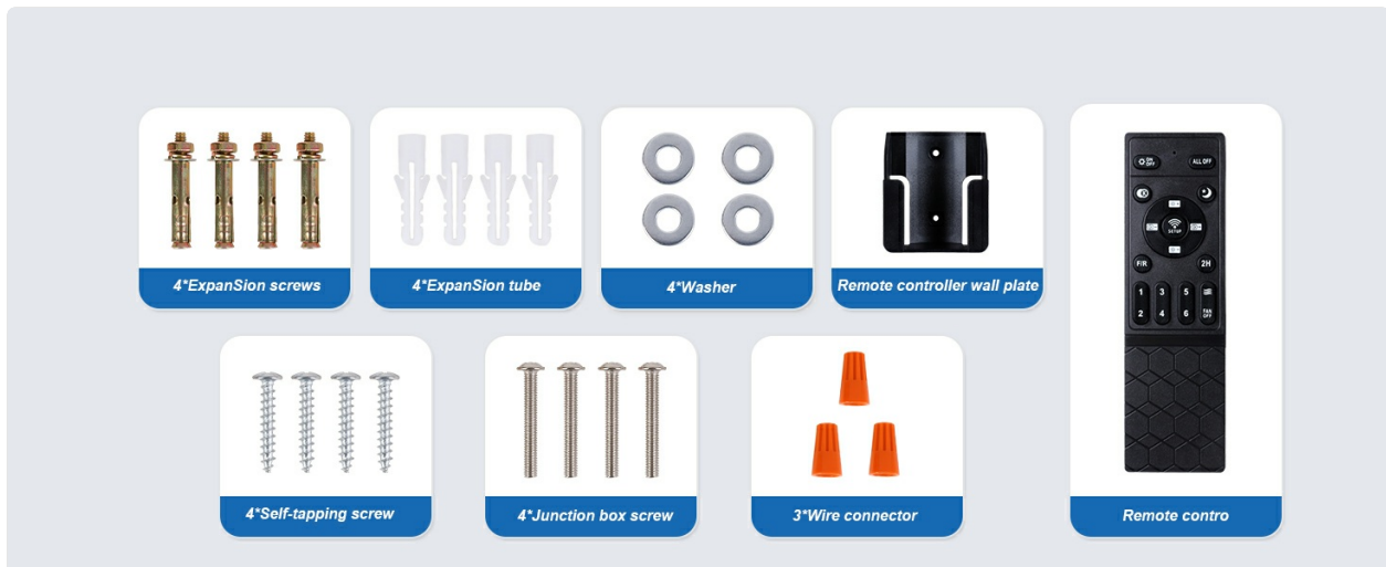
Figure 3.1: All components included in the AQUBT 20-inch Ceiling Fan package.