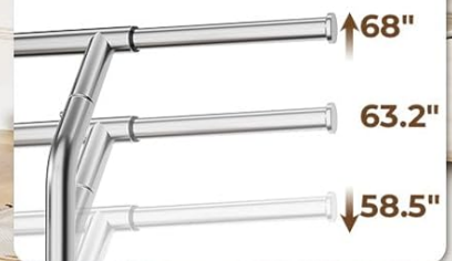
Image: This image illustrates the impressive load capacity of the clothes rack, capable of holding over 200 pieces of clothing and 10+ pairs of shoes, alongside its extendable and adjustable design.