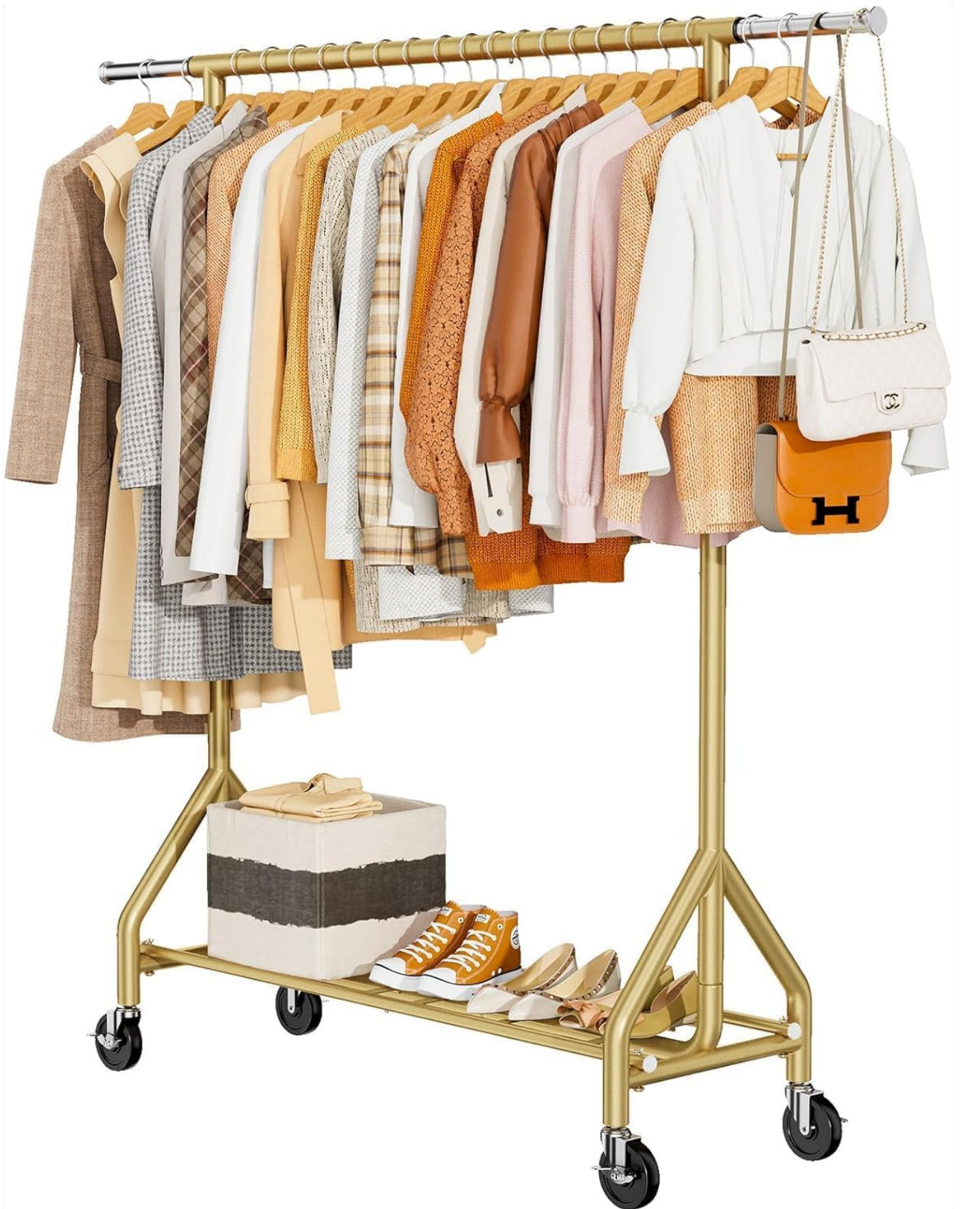
Image: The HYSEYY Heavy Duty Clothes Rack, showcasing its gold finish, sturdy design, and capacity for hanging clothes and storing items on its bottom shelf.