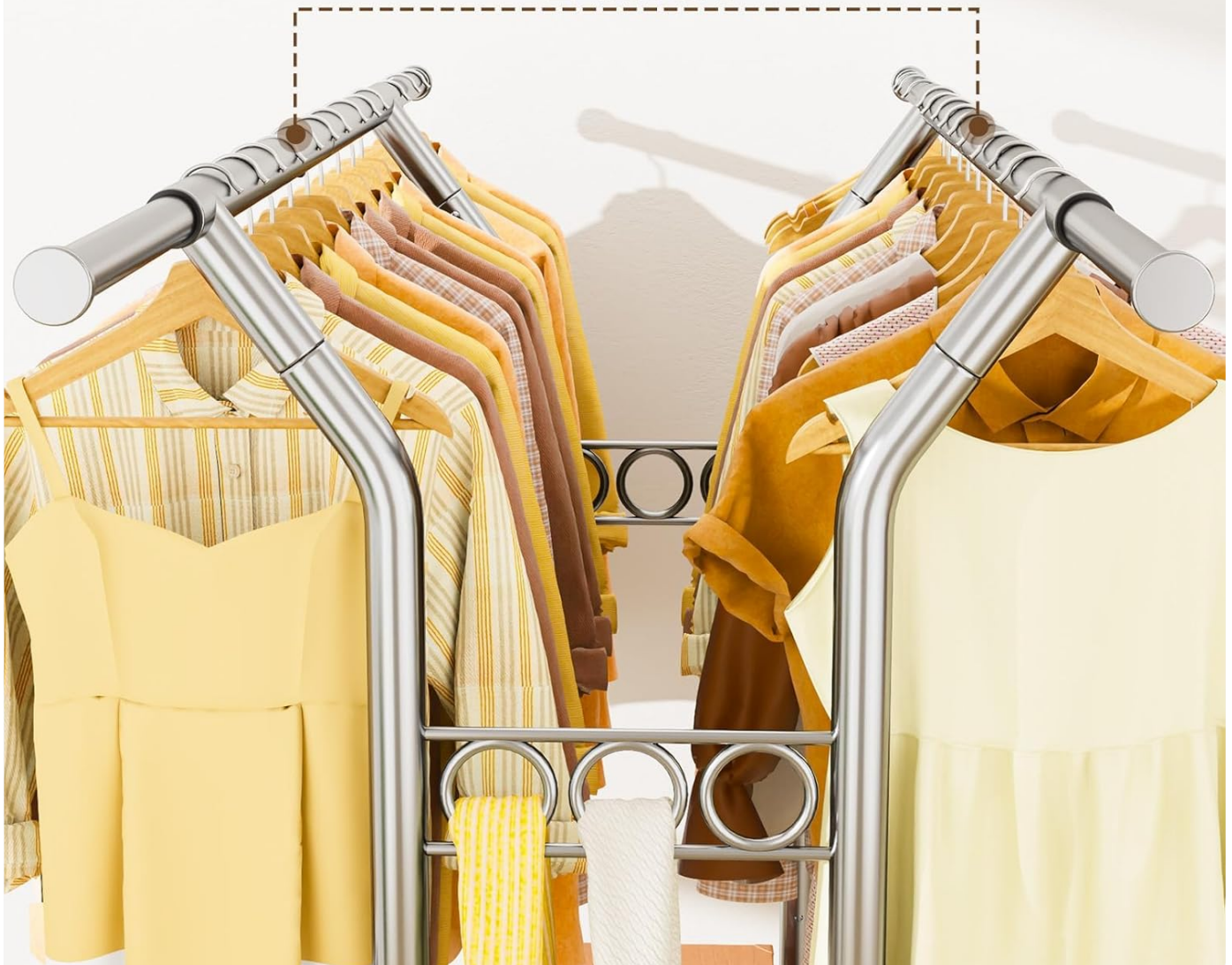
Image: A detailed view highlighting the 24-inch spacing between the hanging rods, designed to prevent clothes from overlapping and allow for easy access.