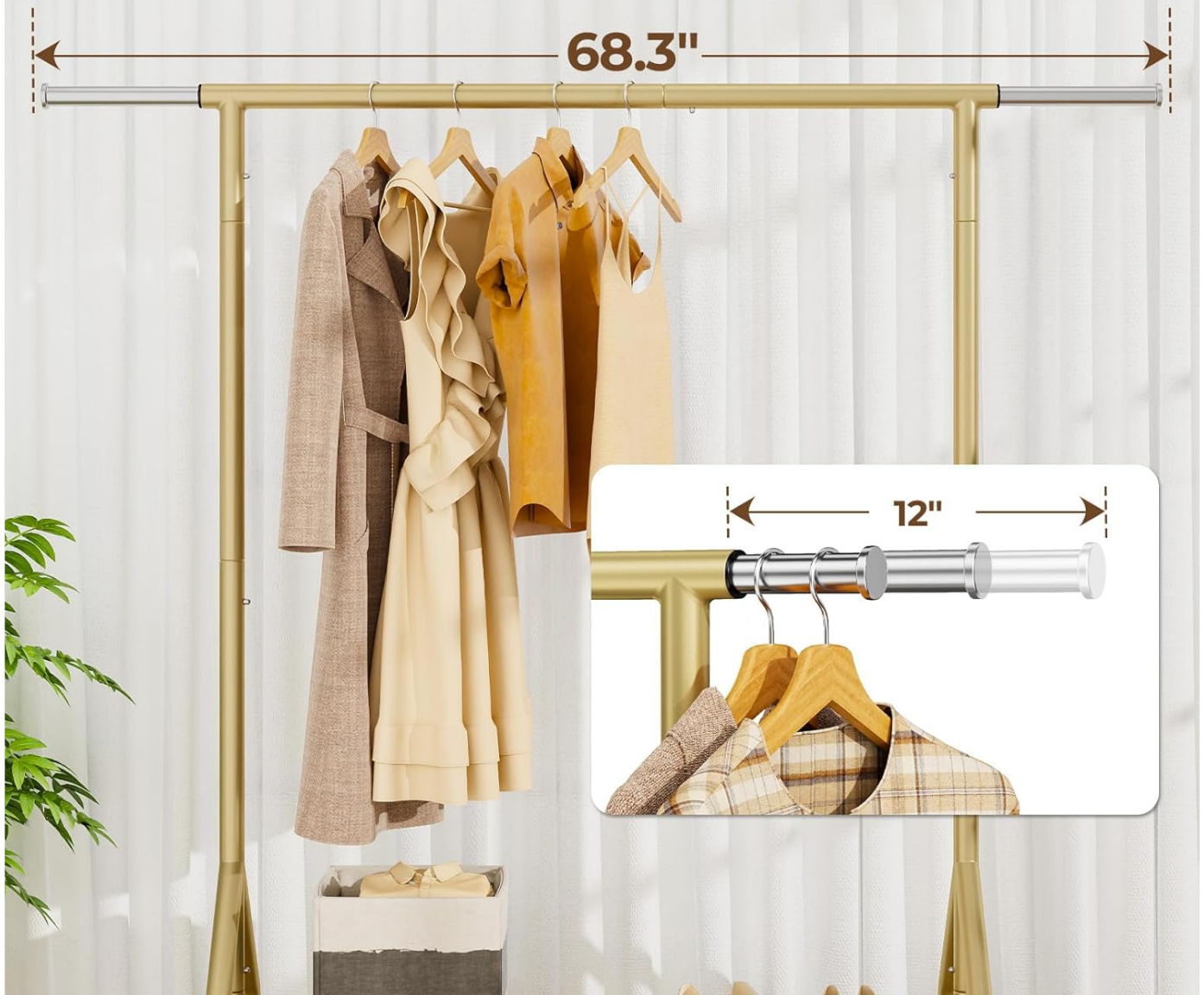
Image: A visual guide demonstrating how the clothes rack's length can be extended and its height adjusted to accommodate different clothing lengths and storage requirements.