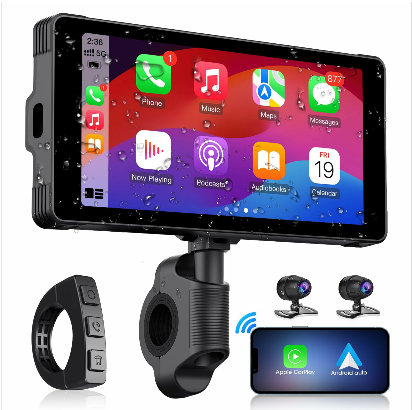
Image: The main AKAMATE dash cam unit, showing its compact design and display.

The AKAMATE Wireless CarPlay Portable Motorcycle Dash Cam is designed to enhance your riding experience with smart connectivity and recording capabilities. It features a 5.5-inch waterproof touch screen, dual 1080P HD cameras for front and rear recording, and supports wireless CarPlay and Android Auto. Integrated Bluetooth 5.3 allows for seamless connection to your smartphone and headset, enabling voice control and hands-free communication.