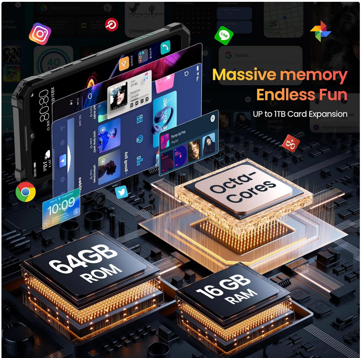
Image: Visual representation of the OUKITEL WP28E's internal specifications, including 16GB RAM, 64GB ROM, and 1TB TF card expansion capability.