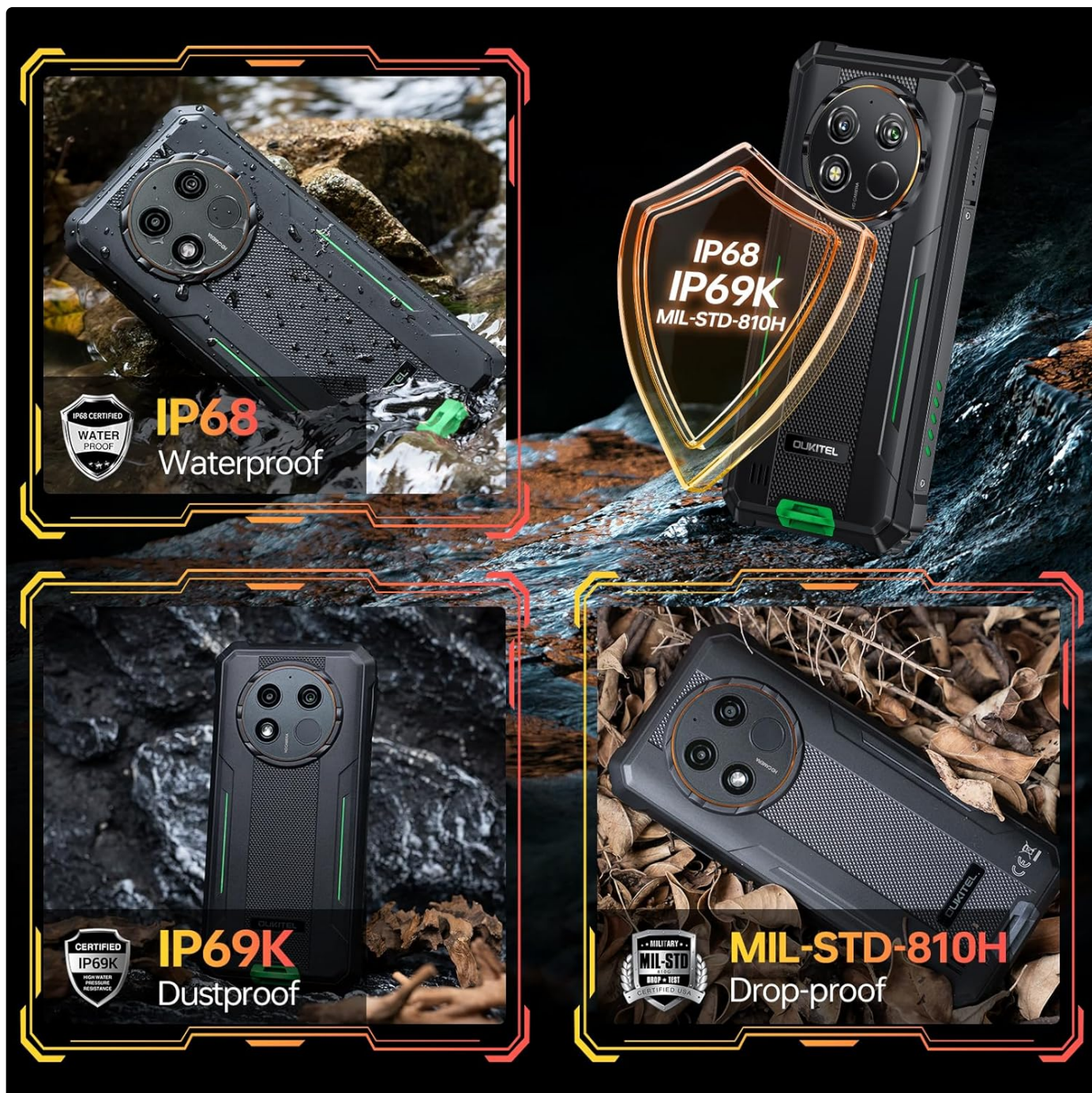
Image: The OUKITEL WP28E showcasing its rugged features, including IP68 waterproofing, IP69K dustproofing, and MIL-STD-810H drop resistance.

Your browser does not support the video tag.