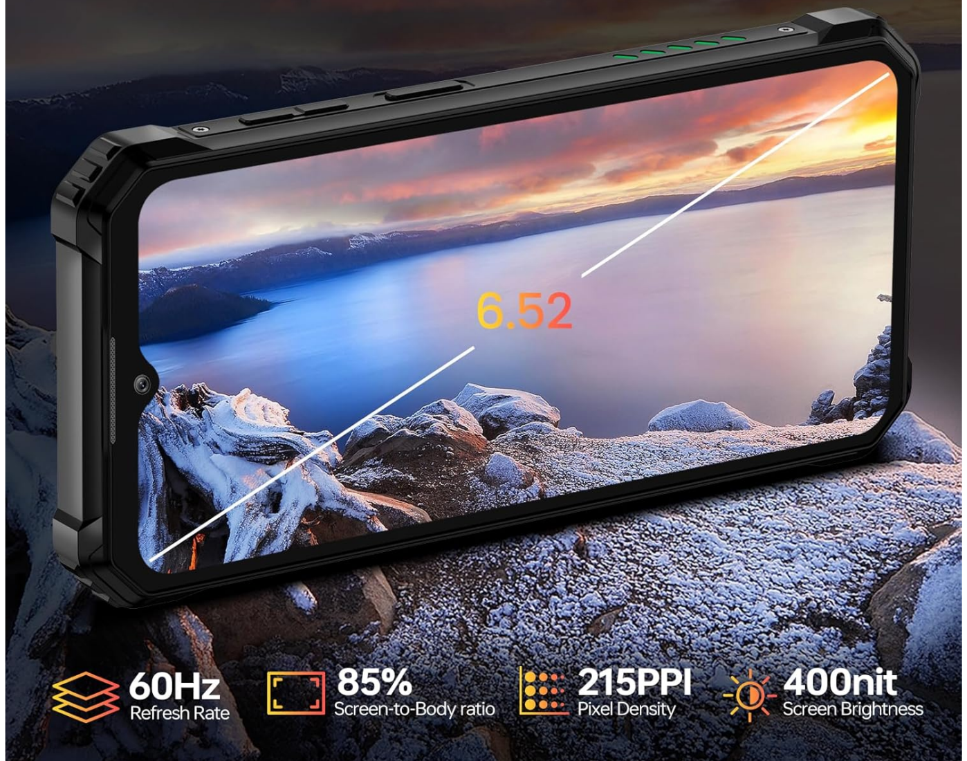
Image: The OUKITEL WP28E's 6.52-inch HD+ display, highlighting its size and visual clarity.

The world of vision has never been wider.