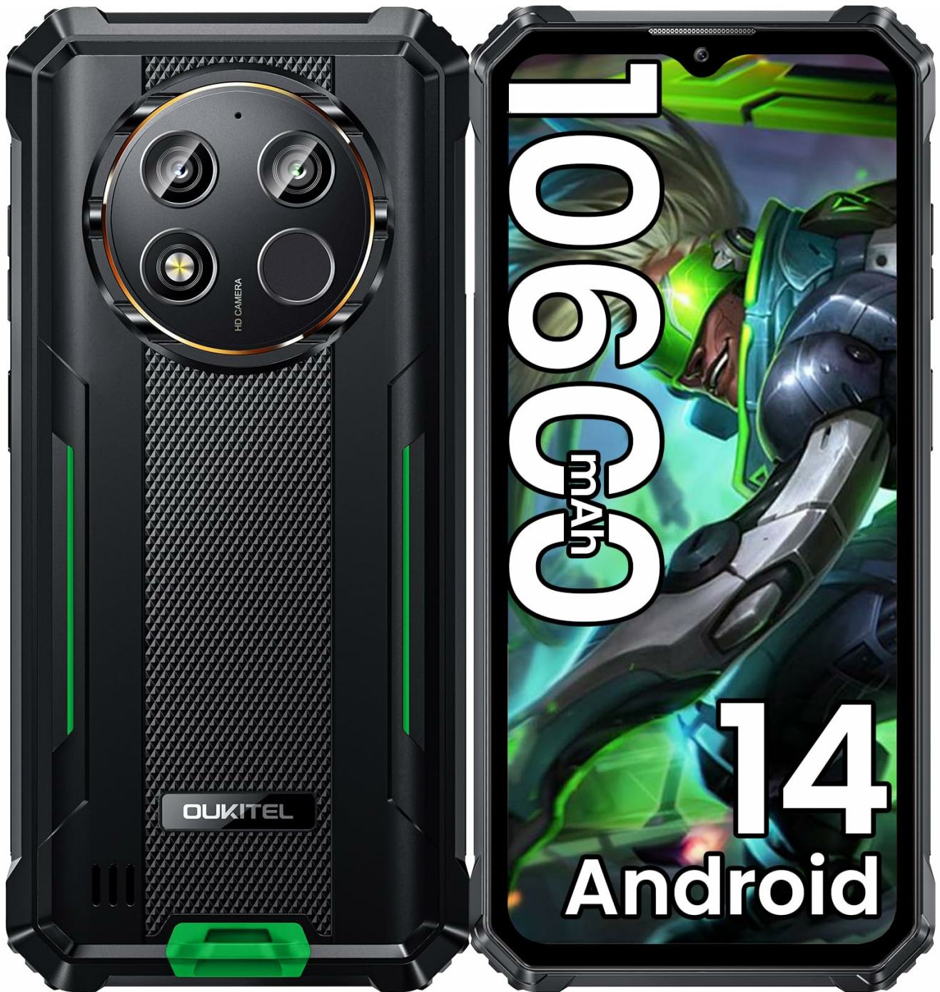
Image: The OUKITEL WP28E highlighting its 10600mAh battery capacity and 18W fast charging capability, along with estimated usage times.

Plug the adapter into a wall outlet. The phone features an 18W fast charging function. The 10600mAh battery provides extended usage times.