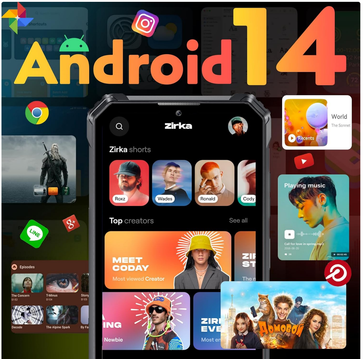
Image: The OUKITEL WP28E display showcasing the Android 14 operating system with multiple applications and widgets.