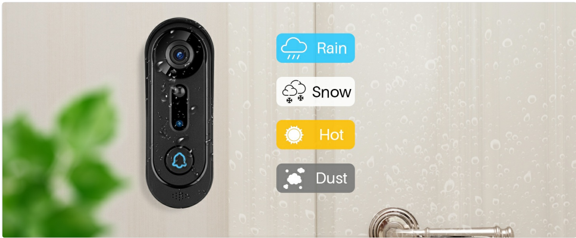
Image: The Eula Videns J4 doorbell camera shown with icons representing various weather conditions (rain, snow, hot, dust), illustrating its IP65 weatherproof durability.