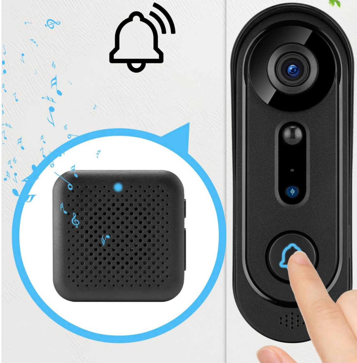
Image: All components included in the Eaula Videns J4 doorbell package, including the doorbell unit, indoor chime, mounting hardware, and charging cable.