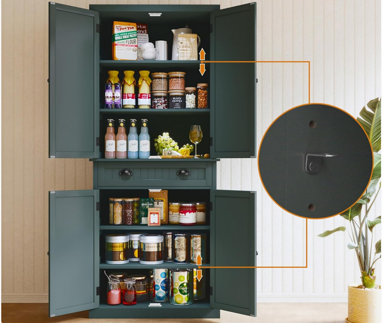
Figure 6: Adjustable Shelf Mechanism

Flexible storage space for different sized items