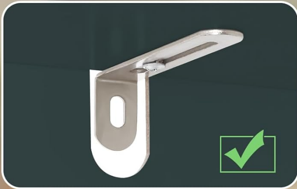
Figure 3: Anti-Toppling Device for Enhanced Safety