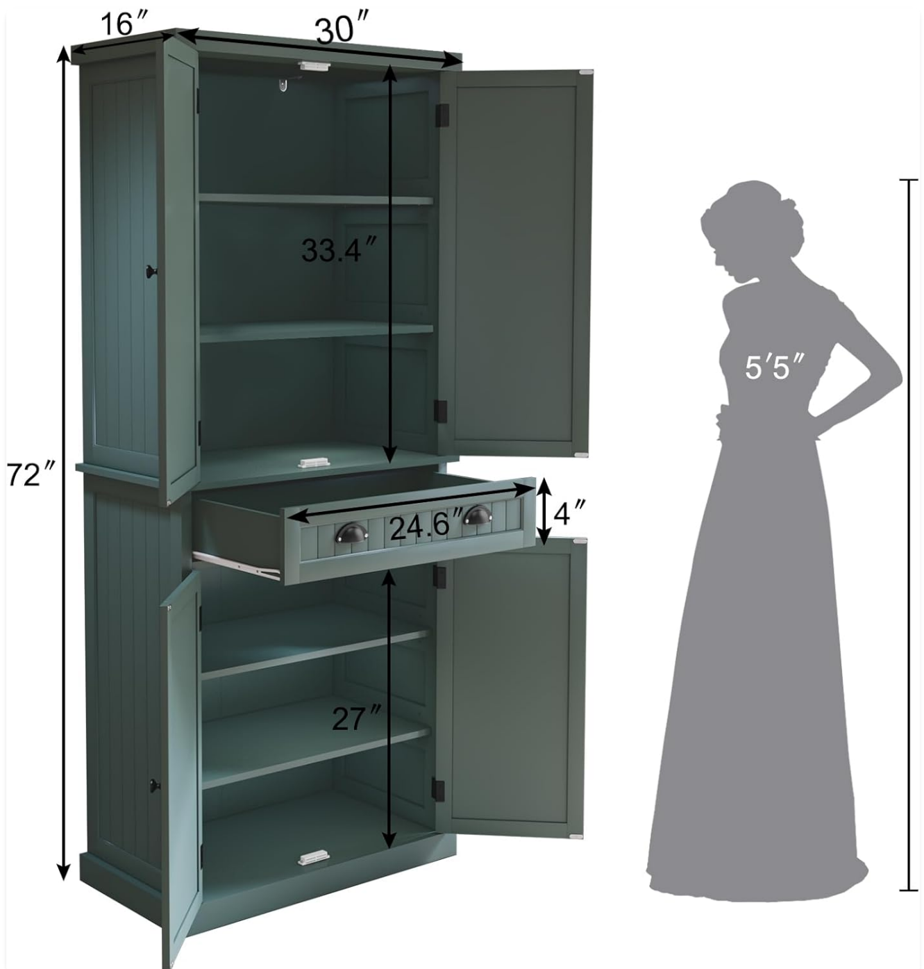
Figure 5: Product Dimensions for Assembly Planning