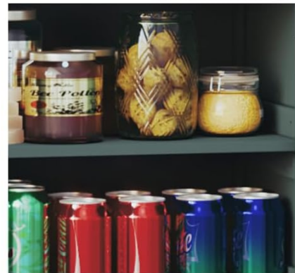
Figure 4: Key Storage Components