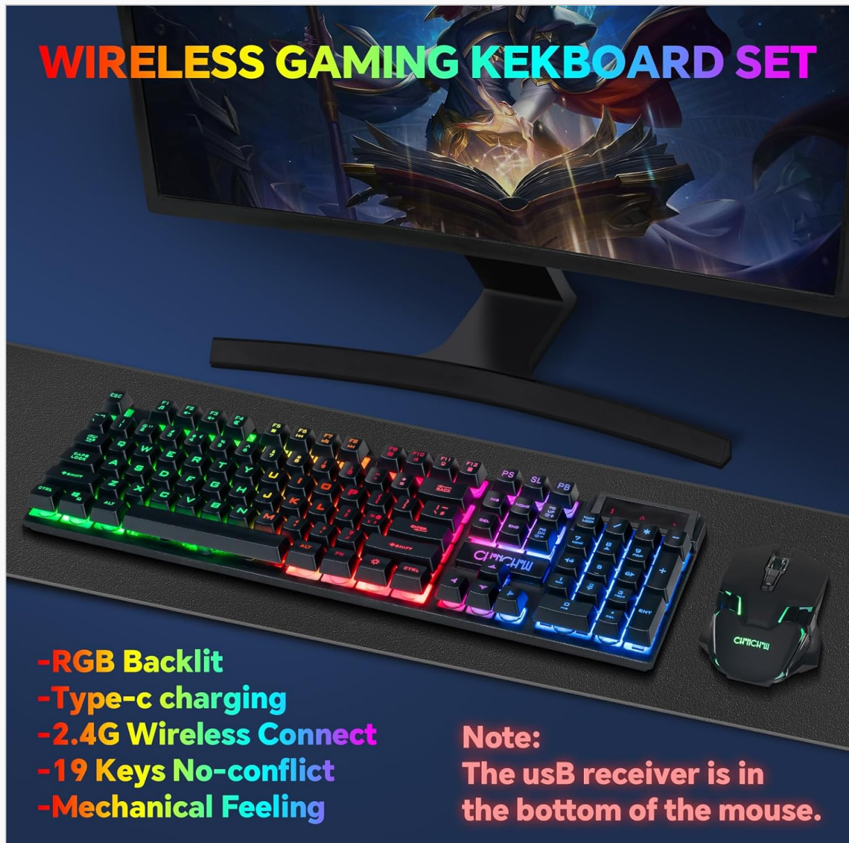
Image: CHONCHOW G220 Wireless Gaming Keyboard and Mouse Combo, showing the keyboard and mouse with RGB backlighting.