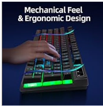
Image: Close-up of the keyboard showing detachable keycaps, illustrating the double injection keycap design for easy cleaning and fade resistance.