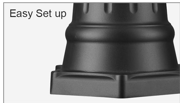
Image: Detailed view of the lamp post's metal frame, seeded glass, and base for easy setup.