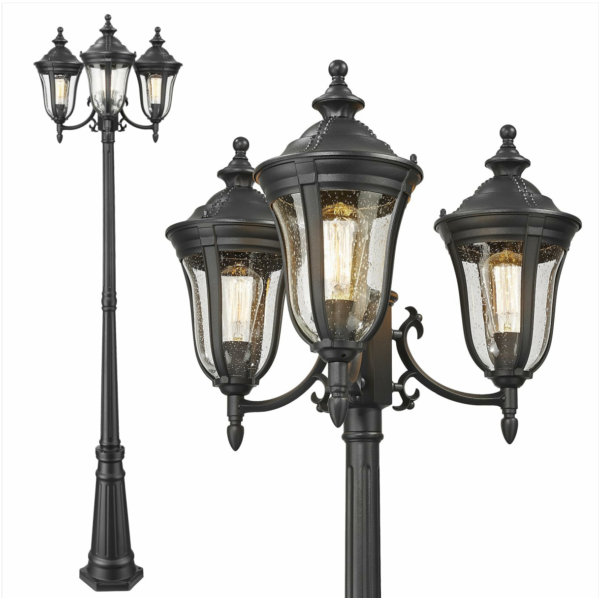
Image: Overall view of the Luminzone 3-Head Outdoor Post Lamp with seeded glass.