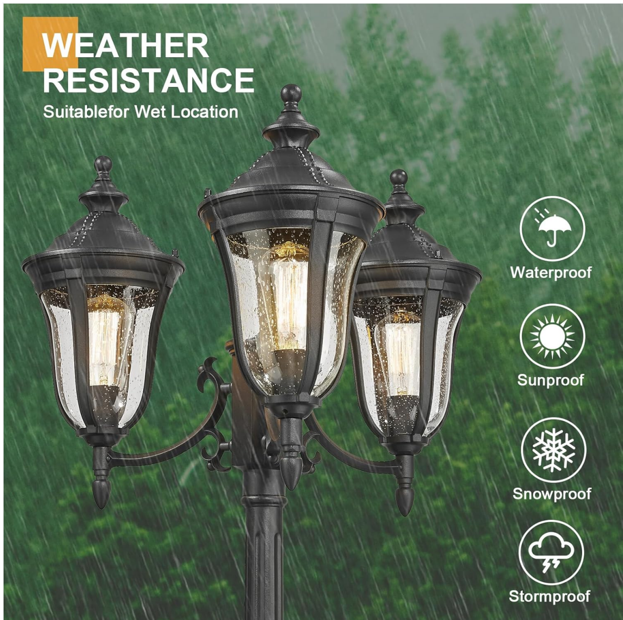
Image: Icons illustrating the weather-resistant features of the lamp: waterproof, sunproof, snowproof, and stormproof.