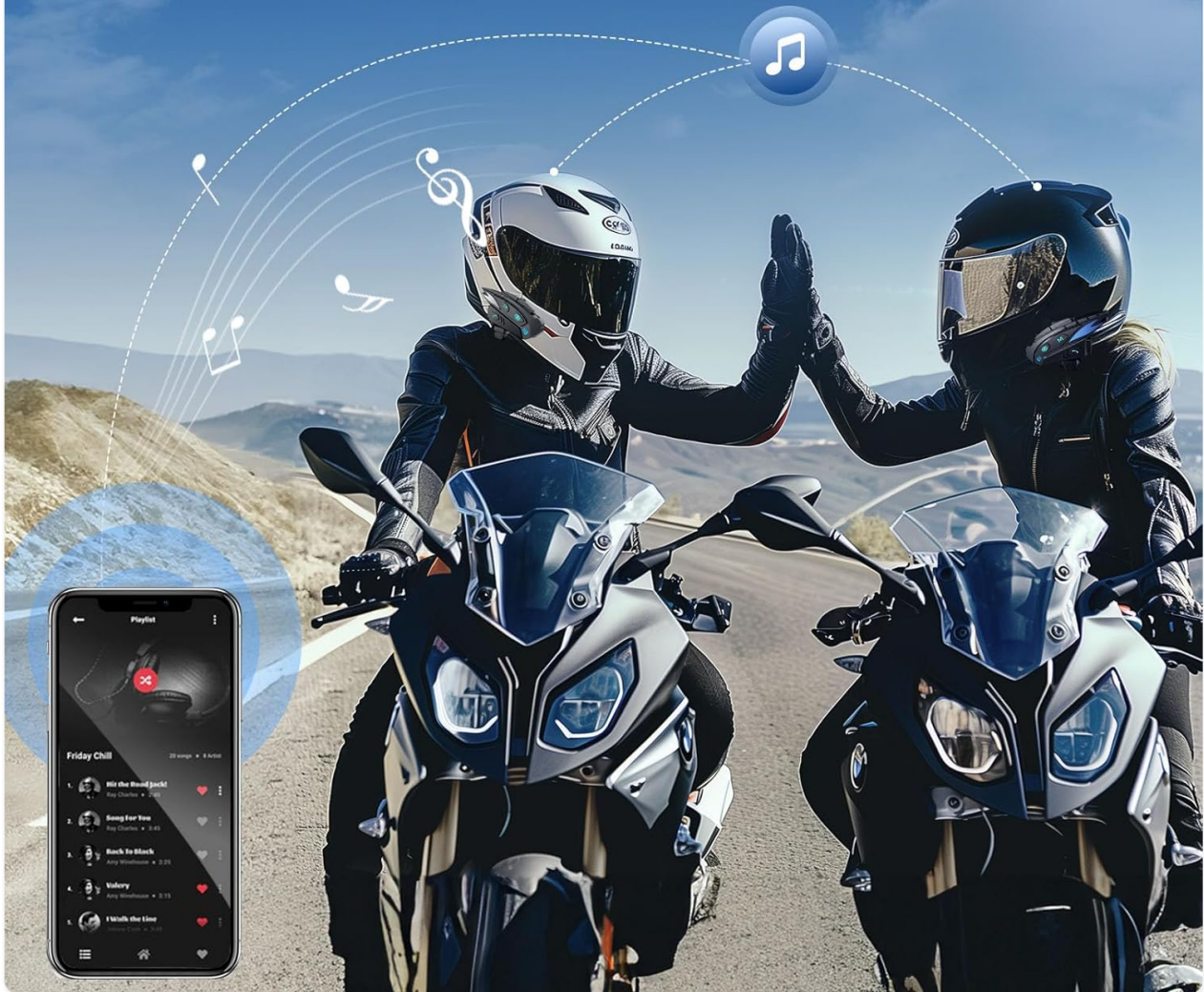
Image demonstrating the music sharing feature, allowing two riders to listen to the same audio.

Share the joy of music and bring each other closer