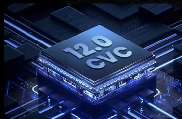
12th CVC Noise Cancelling