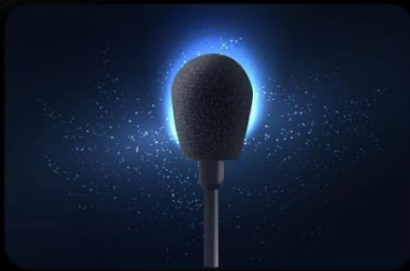
Windproof-Mic Noise Filtering