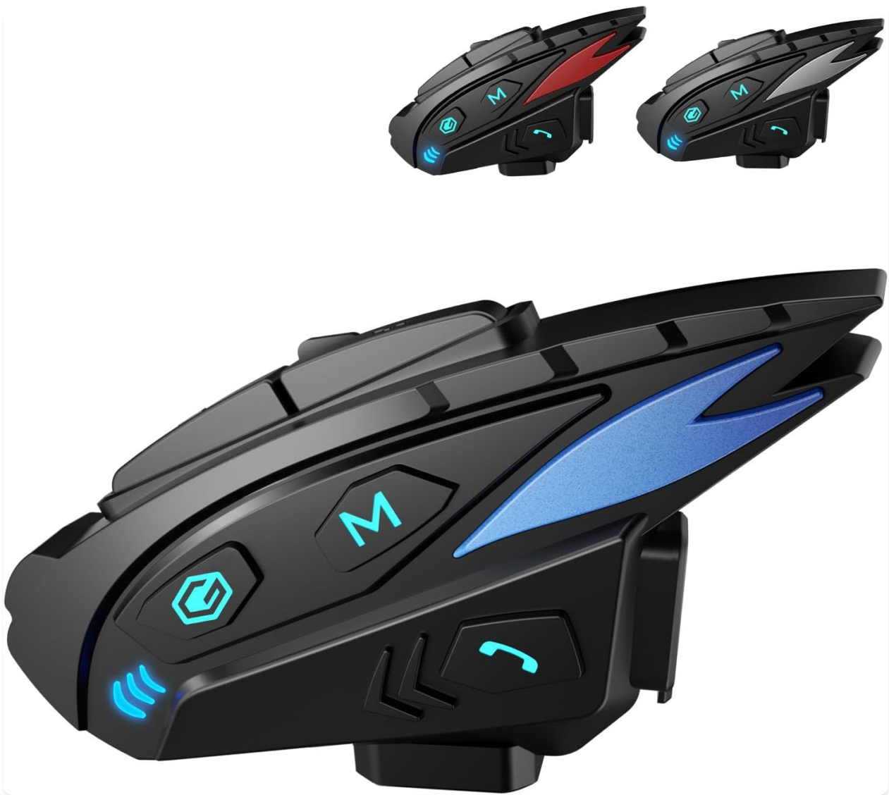
Image showing the main unit of the Gearelec Shark Pro Bluetooth Headset with its various buttons and indicators.