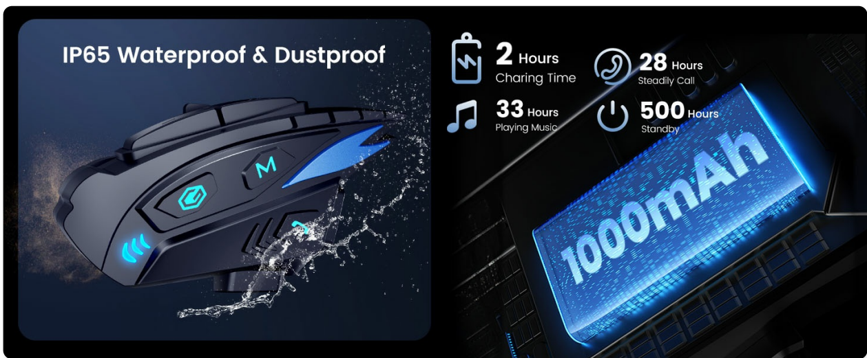
Image highlighting the IP65 waterproof and dustproof rating, alongside battery life details: 28 hours talk time, 33 hours music playback, and 500 hours standby.

The headset is IP65 waterproof and dustproof, allowing for use in various weather conditions. However, avoid submerging the device in water.