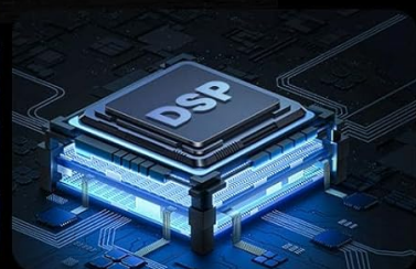
DSP Noise Reduction

Image illustrating the Gearelec Shark Pro Bluetooth Headset mounted on a motorcycle helmet, demonstrating its sleek profile. Position the speakers inside the helmet's ear pockets, ensuring they are aligned with your ears for optimal sound. Attach the microphone to a suitable location near your mouth, ensuring clear voice pickup.