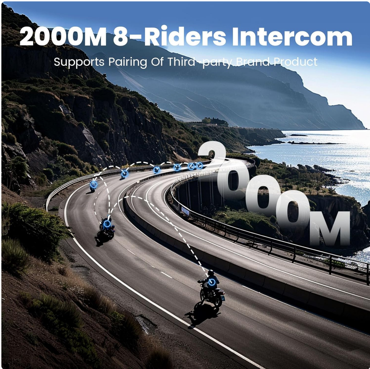
Diagram illustrating the 2000-meter, 8-rider intercom capability, showing multiple riders connected.

The Shark Pro supports up to 8 riders for intercom communication with a maximum range of 2000 meters in open terrain. Refer to the detailed pairing instructions in the included user manual for multi-unit intercom setup.