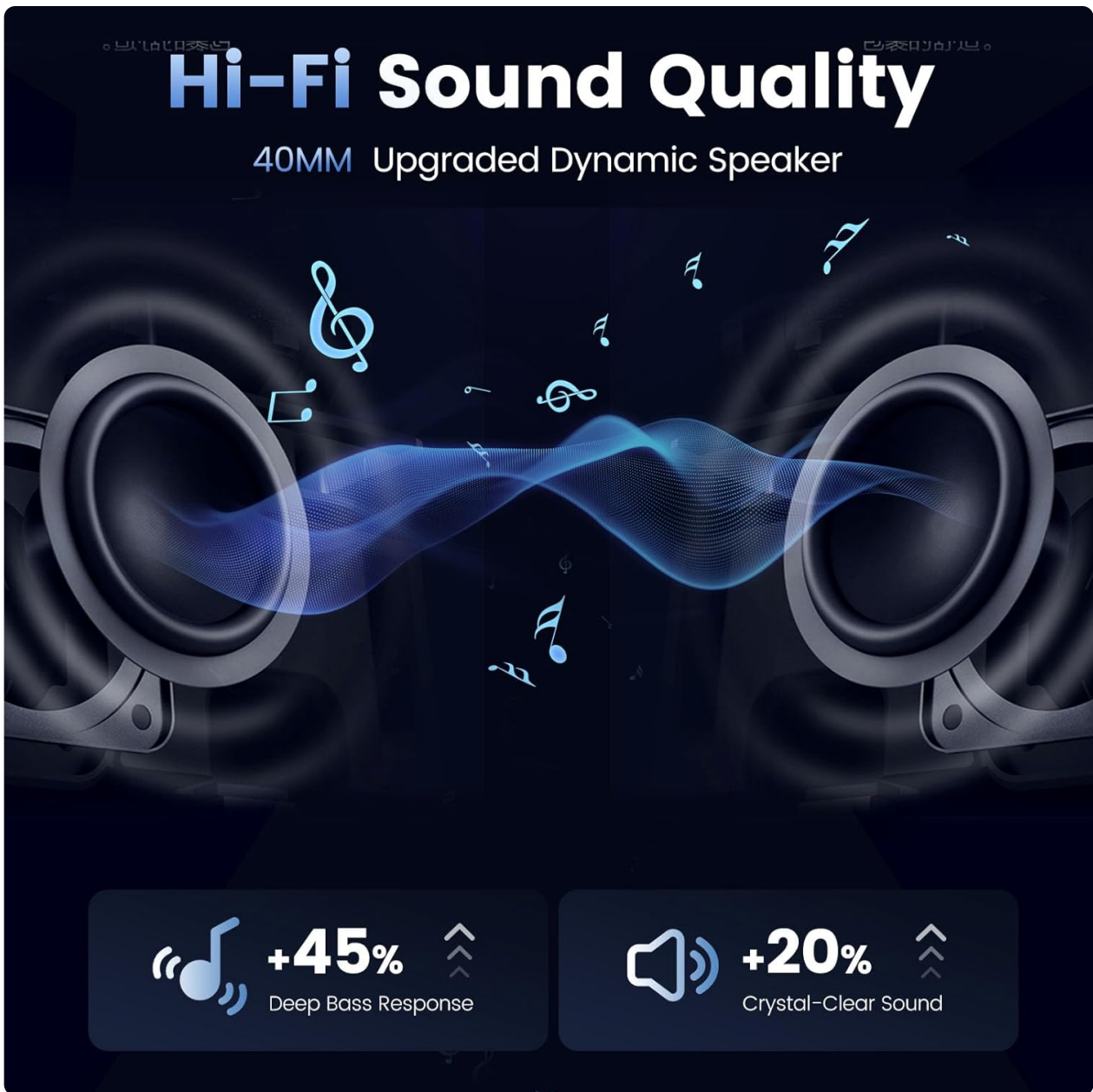
Graphic detailing the Hi-Fi sound quality with 40mm upgraded dynamic speakers, emphasizing deep bass and crystal-clear sound.