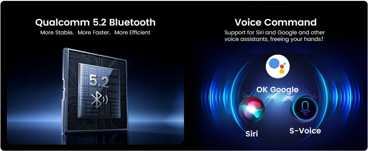
Image illustrating the Qualcomm 5.2 Bluetooth chip for stable connection and support for voice commands like Siri and Google Assistant.