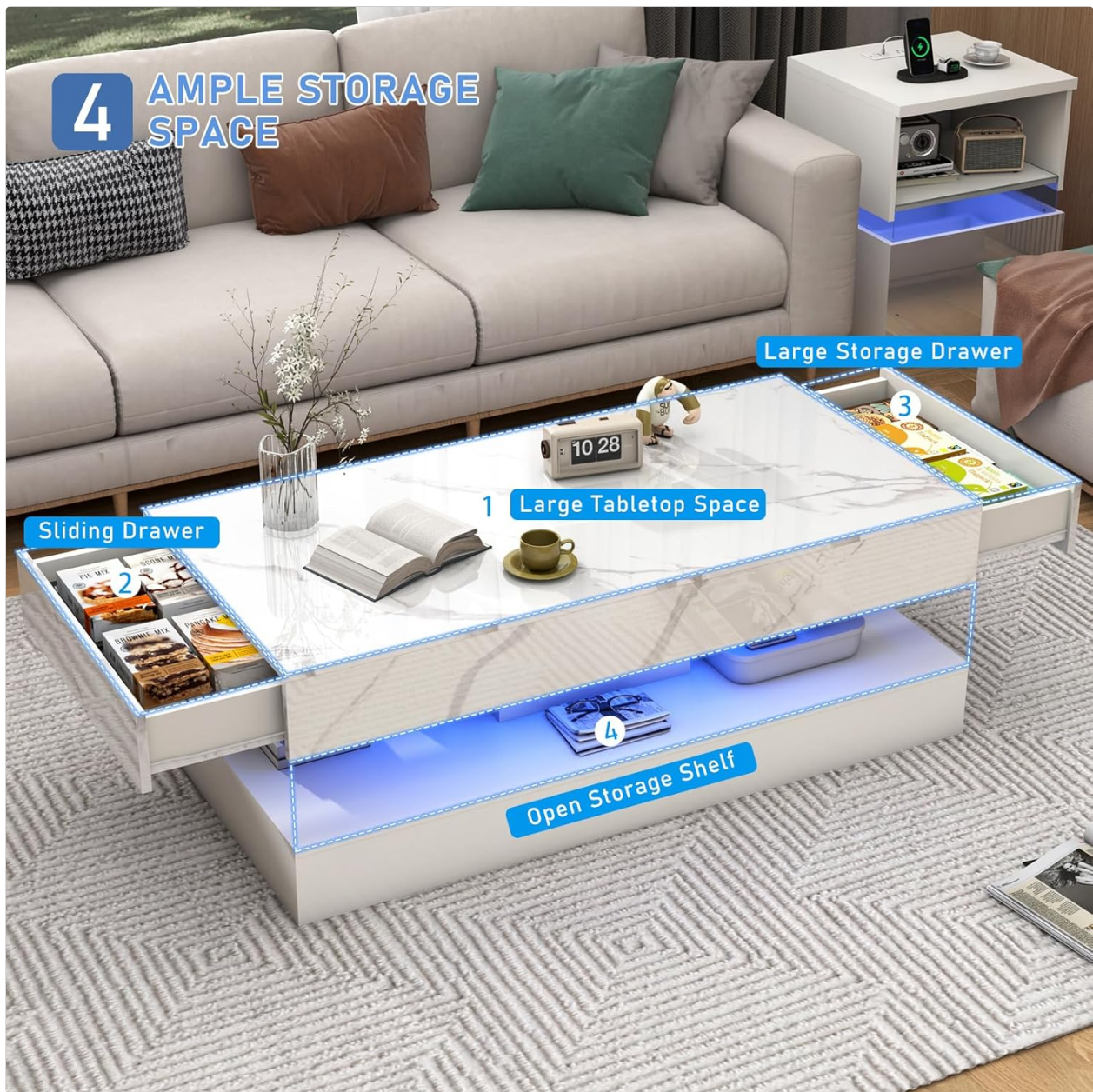
Figure 6.2.1: Ample Storage Space. This image demonstrates the various storage options provided by the coffee table, including the large tabletop, two sliding drawers, and an open storage shelf beneath the top surface.