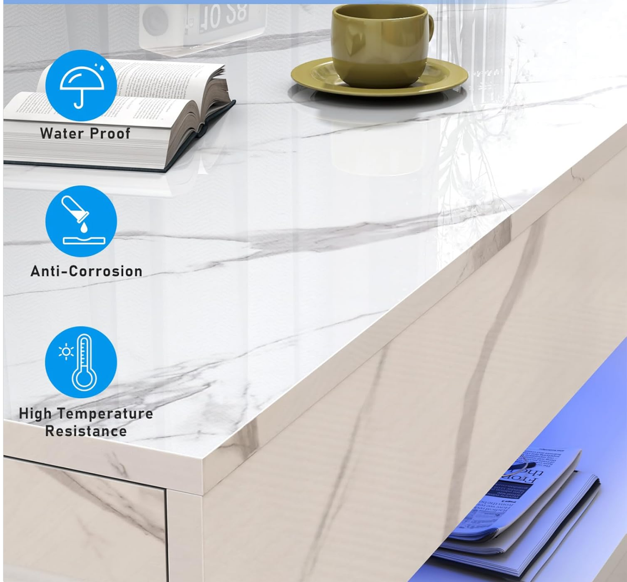
Figure 7.1.1: Premium Surface Features. This image details the durable properties of the table's high-gloss, marble-print surface, including its resistance to water, corrosion, and high temperatures, making it easy to clean and maintain.