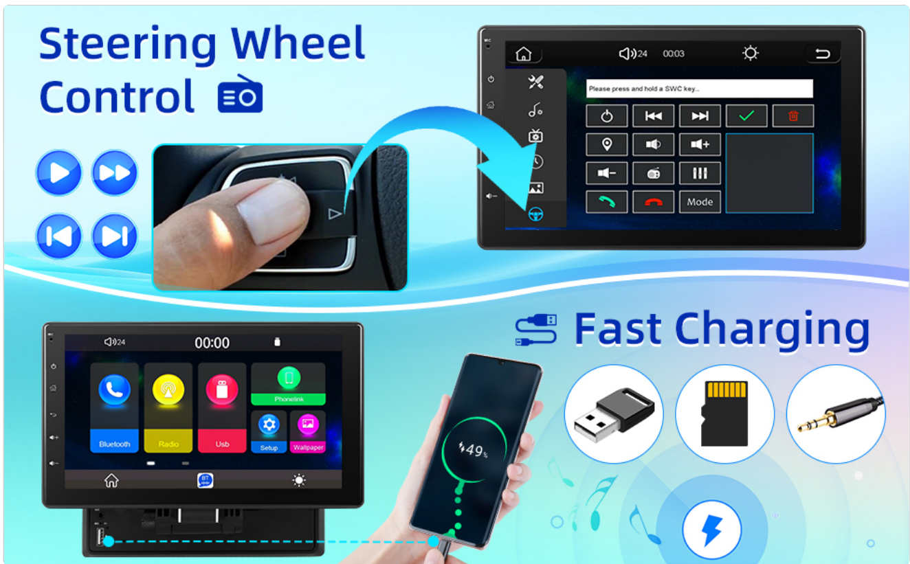
Image: Visual guide for setting up and using steering wheel controls, alongside an illustration of the USB fast charging capability.