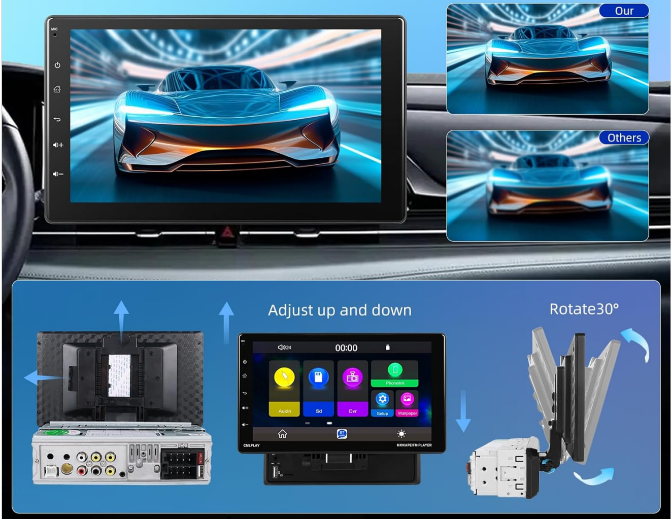
Image: Illustration of the detachable screen's adjustability, demonstrating how it can be moved vertically and rotated by 30 degrees for optimal positioning.

The detachable screen is easy to install and remove, and can be adjusted up and down, and the front and rear adjustment range is 30°. Full-screen touch, sensitive operation, 1024*600 display