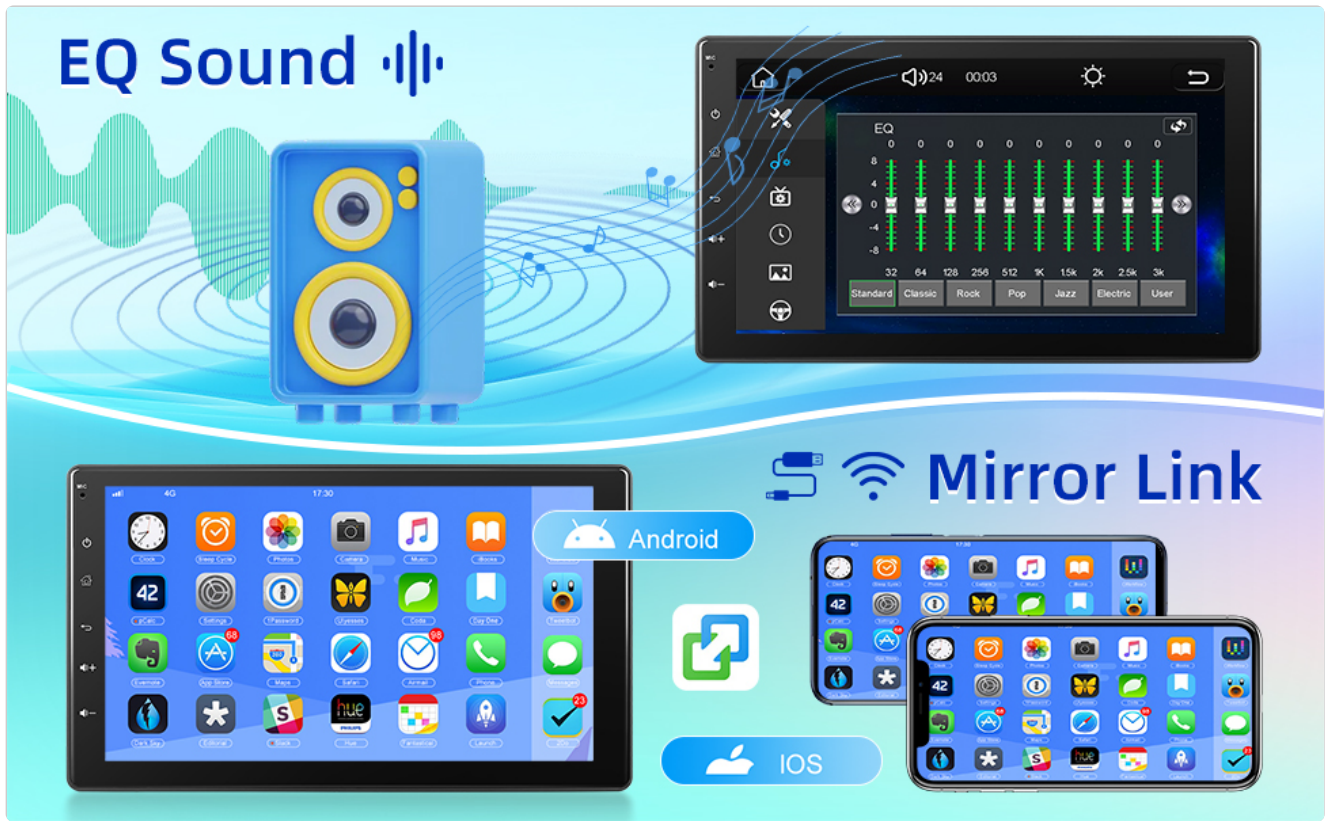
Image: The EQ sound settings interface with adjustable frequency bands and a demonstration of the Mirror Link feature displaying a smartphone screen on the head unit.

Customize your audio experience using the built-in EQ adjustment feature. You can fine-tune sound settings to match your personal preferences.