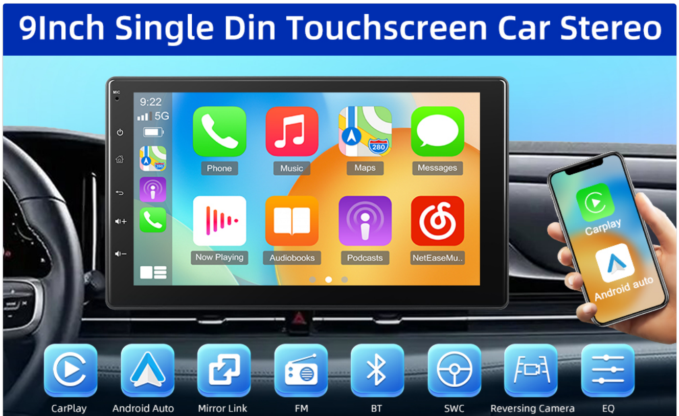
Image: Front view of the 9-inch detachable touchscreen car stereo displaying its user interface with various application icons.

The NHOPEEW Single Din Car Stereo features a 9-inch detachable IPS touchscreen, offering a comprehensive multimedia experience for your vehicle. It supports wireless CarPlay and Android Auto, Bluetooth connectivity, FM radio, Mirror Link, and steering wheel control. A backup camera is also included for enhanced safety.