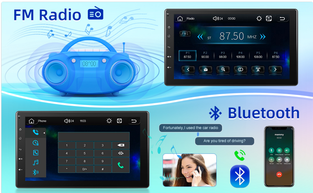
Image: Display of the FM radio tuning interface and the Bluetooth call screen, illustrating hands-free communication and audio playback features.

The unit features built-in Bluetooth for hands-free calls and audio streaming. An external microphone is included for clearer voice capture. The FM radio supports 18 preset stations for easy access to news, music, and sports.