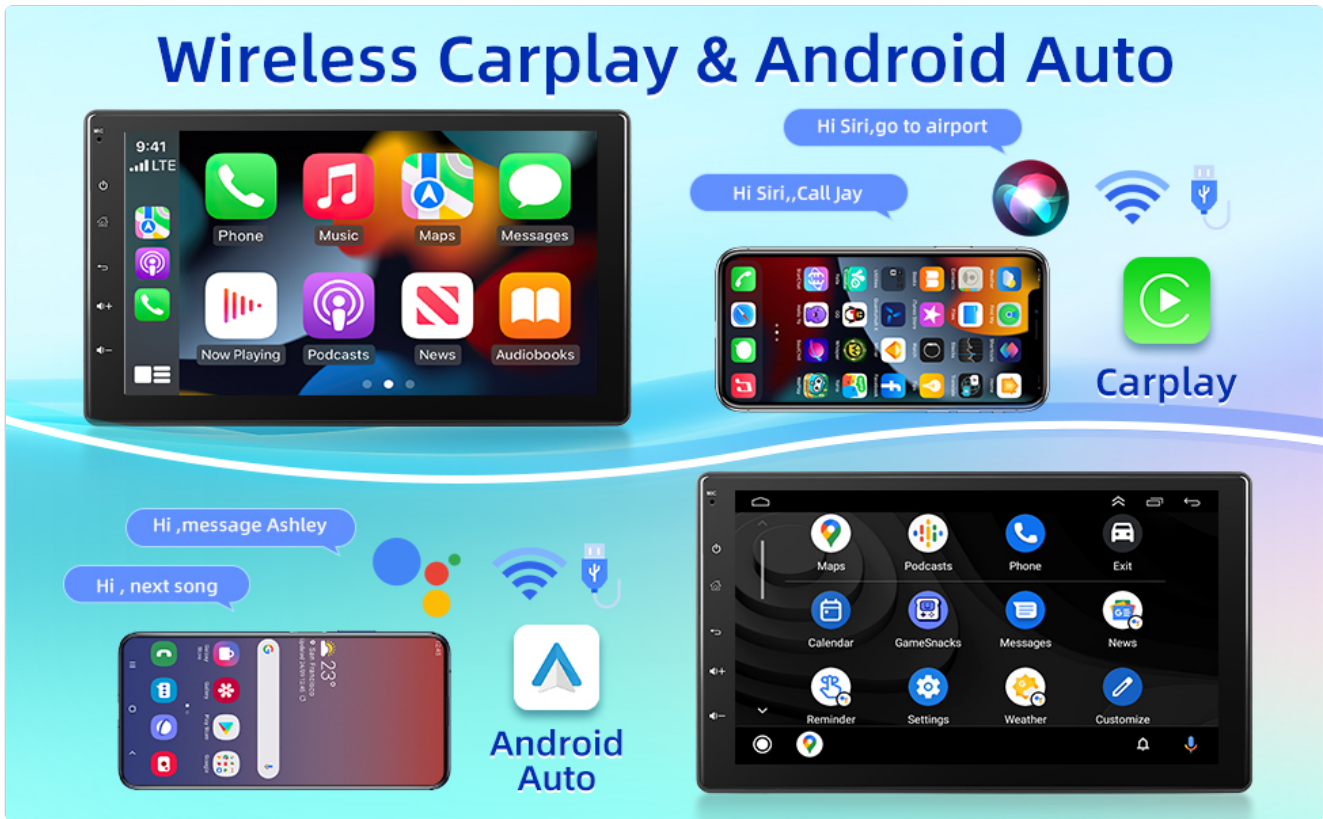
Image: Visual representation of Wireless CarPlay and Android Auto functionality, including voice commands and typical application layouts.