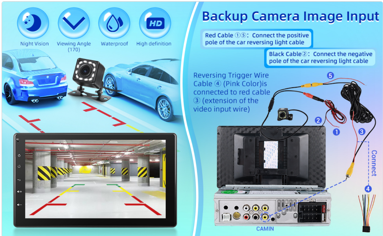
Image: Wiring instructions for the backup camera, detailing the connection points for power, ground, and the trigger wire to the car stereo.