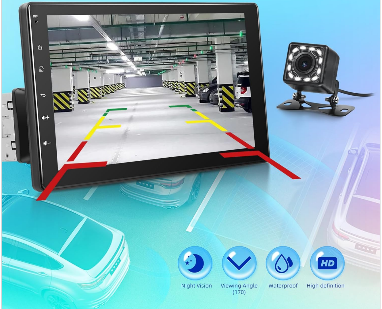
Image: The car stereo screen displaying the backup camera feed with parking assist lines, highlighting night vision, wide viewing angle, waterproof design, and high definition features.

You can connect the 12 LED rear view camera, and it will provide you with assistance in reversing