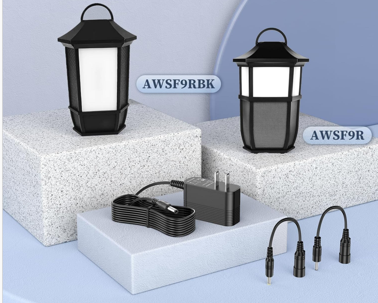
Image: Compatible Acoustic Research speaker models (AWSF9RBK, AWSF9R) and the charger with connectors.