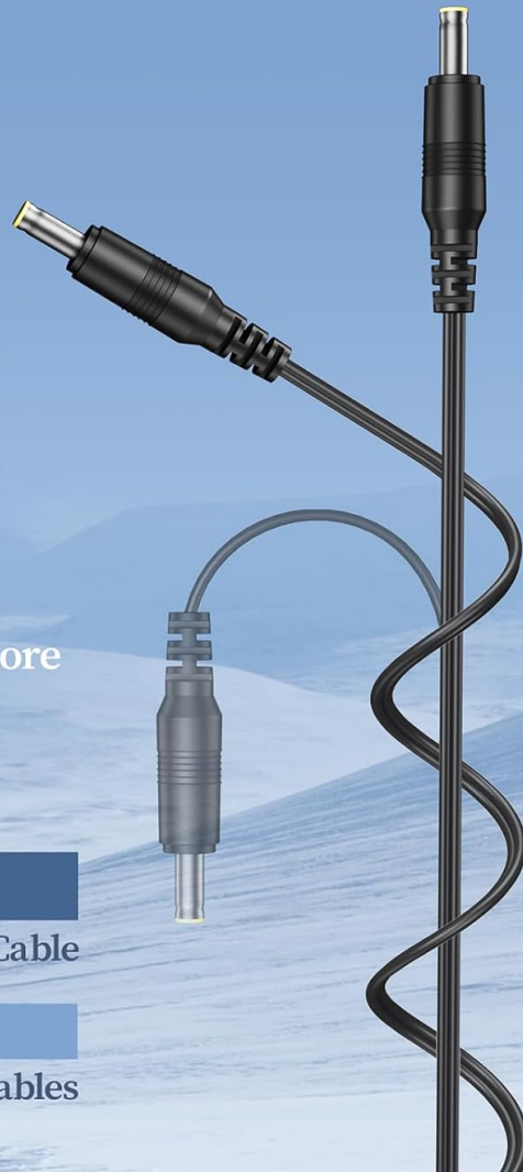
Image: Durable wire and pure copper core construction.