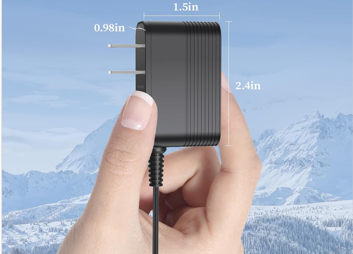
Image: Compact size and dimensions of the adapter.