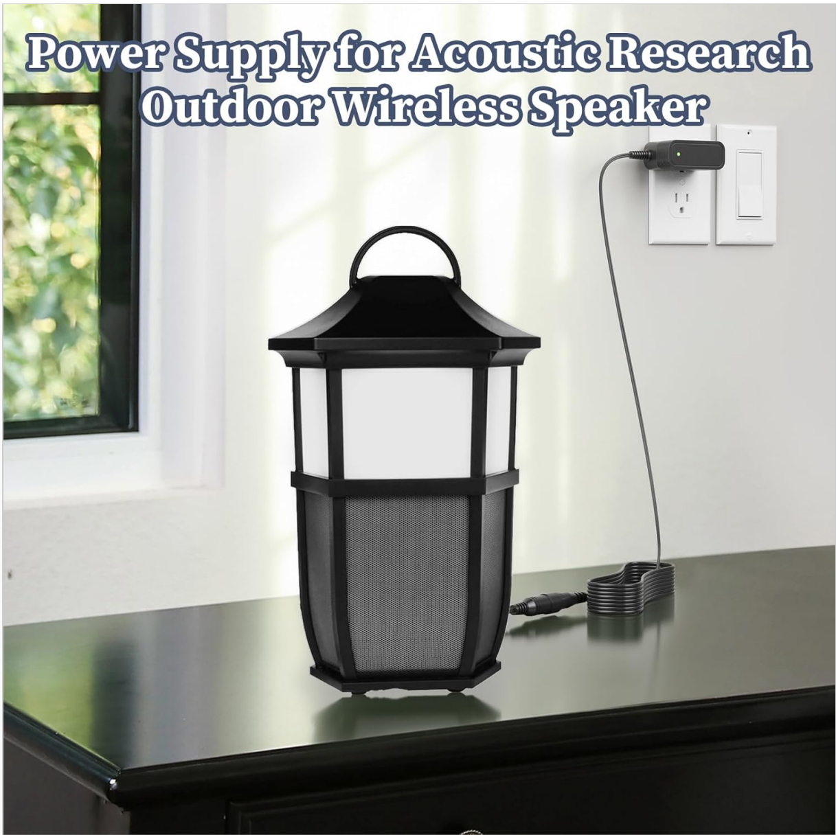
Image: Speaker connected to the charger and power outlet.