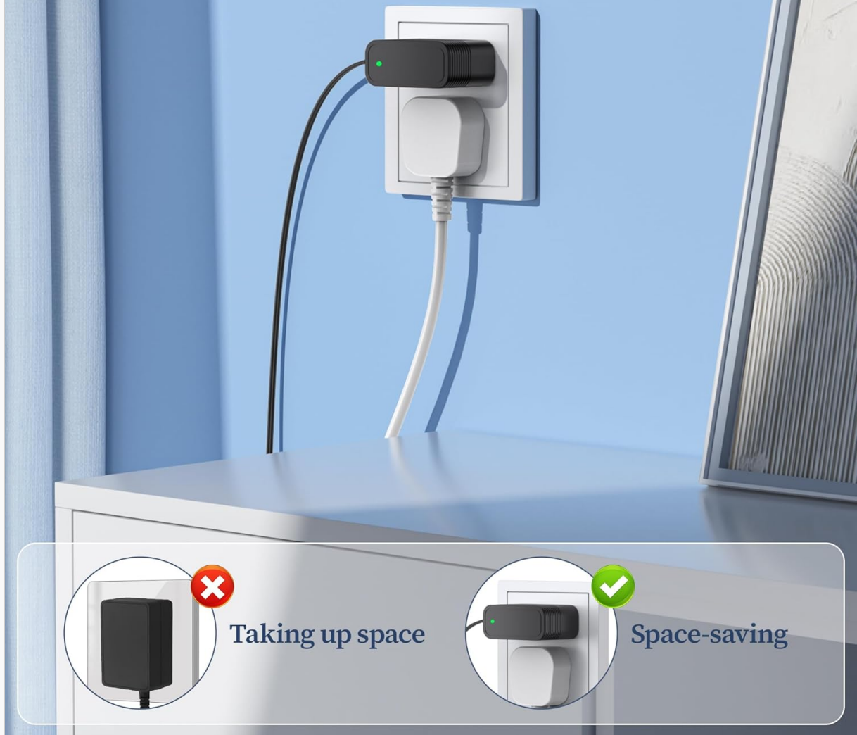
Image: Green indicator light on the adapter when plugged in.