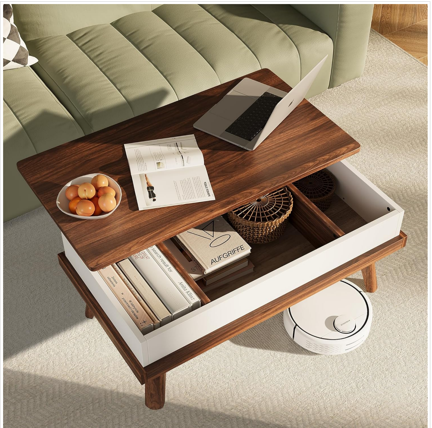
Image: The Meilocar coffee table with its top lifted, revealing a spacious hidden compartment filled with books and a basket. A laptop is on the elevated tabletop.