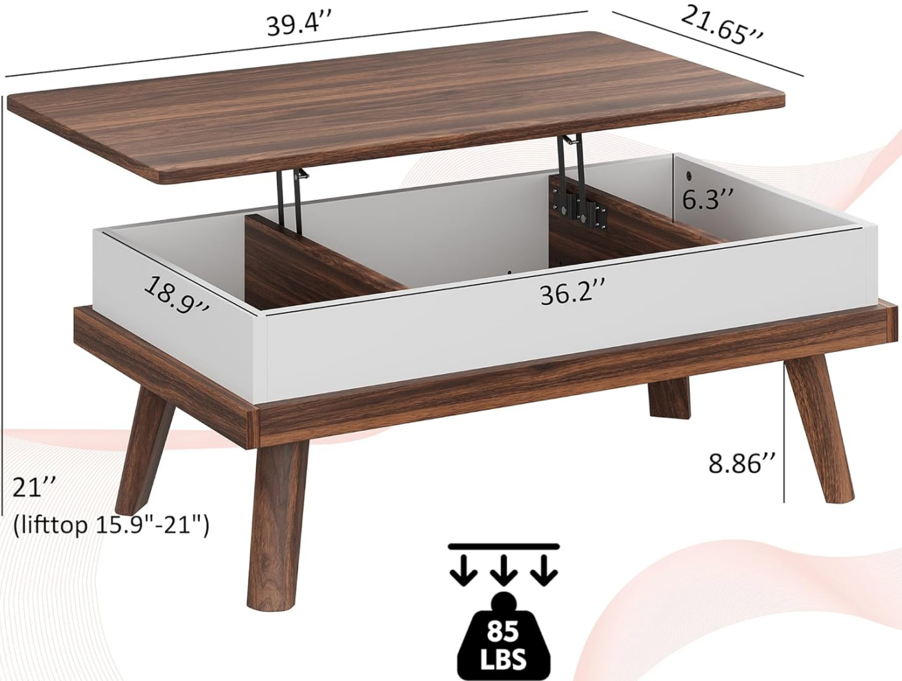
Image: Detailed product dimensions including length (39.4"), depth (21.65"), closed height (15.9"), and internal storage depth (6.3").