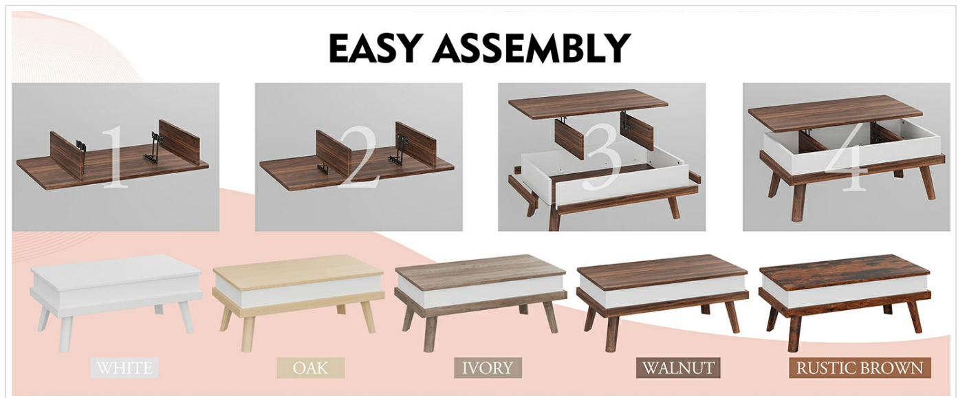
Image: Overview of the assembly process, showing four main stages from base construction to attaching the lift-top mechanism and tabletop.

The following images illustrate the general assembly process. Refer to the detailed diagrams included with your product for specific part identification and orientation.