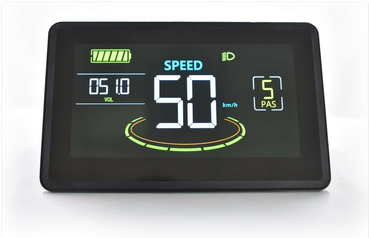
Image 1.1: The Mcezdy H6C-5-Core Ebike LCD Display, showcasing its vibrant interface with speed, battery charge, voltage, and pedal-assist system (PAS) level indicators.

Thank you for choosing the Mcezdy H6C-5-Core Ebike LCD Display. This advanced cycling computer is designed to provide essential riding data and enhance your electric bike experience. Featuring a colorful display, robust construction, and a convenient charging port for mobile devices, it is compatible with 24V-60V ebike systems utilizing the UART No. 2 communication protocol.