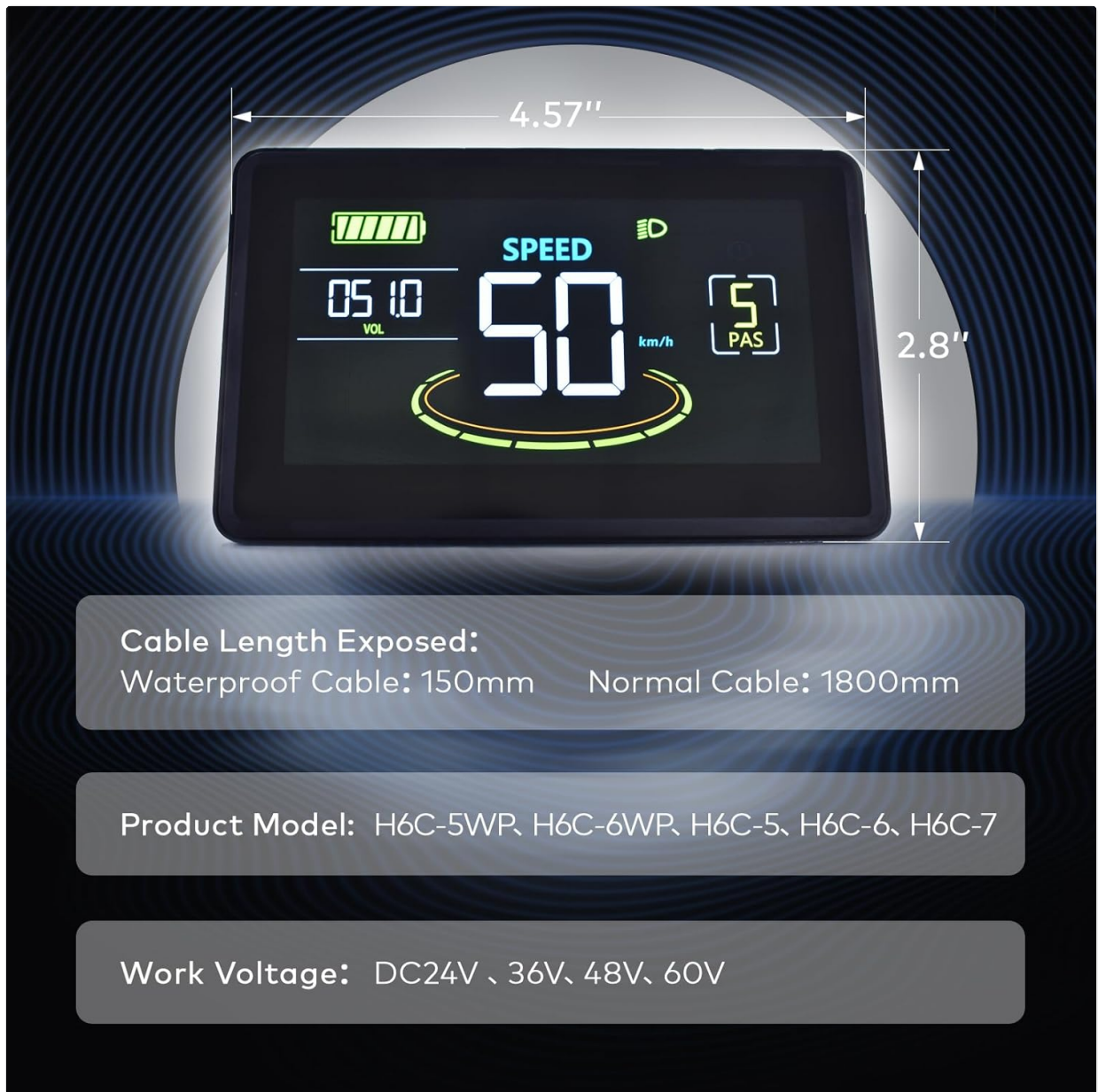
Image 10.1: Visual representation of the display's dimensions and a summary of key specifications.