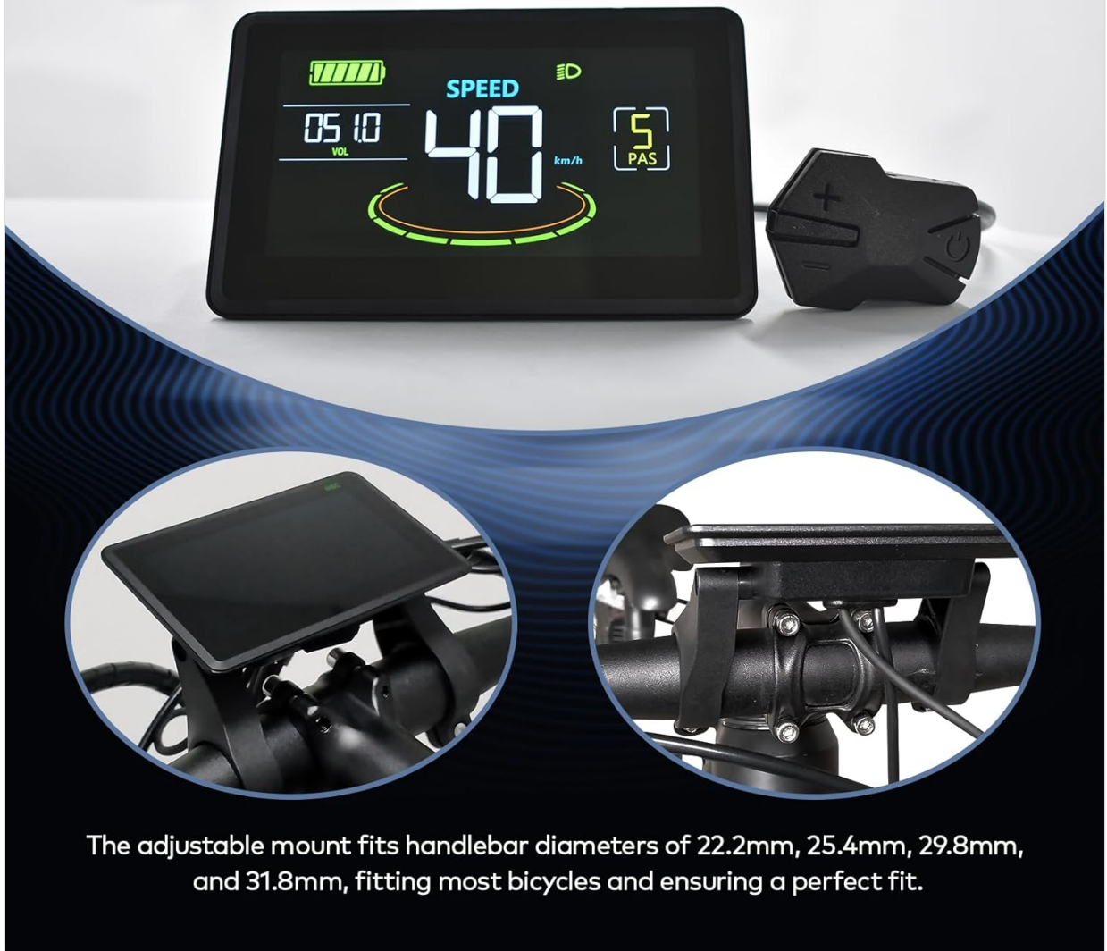
Image 4.2: The display mounted on an ebike handlebar, illustrating its universal fit for different handlebar diameters.