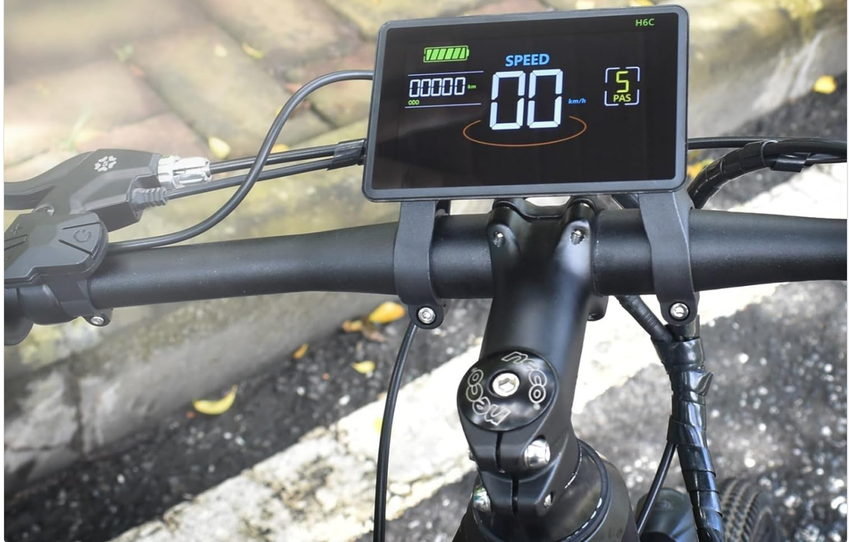
Image 4.1: A visual reminder to verify your ebike's compatibility with the UART No. 2 protocol before installation.

Please check if your ebike is compatible with the UART NO.2 Protocol