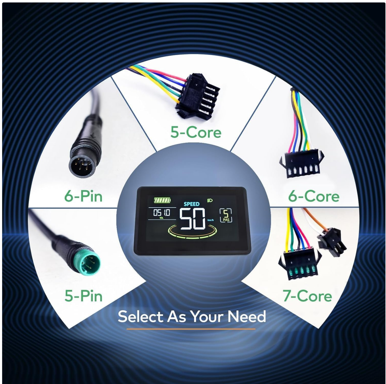
Image 4.3: An illustration of different connector types. Ensure you use the 5-Core connector for the H6C-5-Core model.