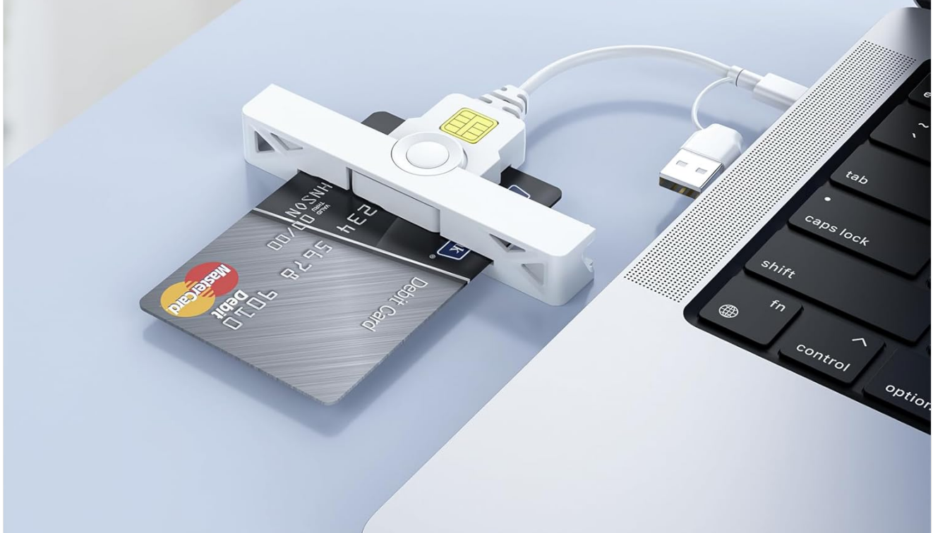
Image: The card reader shown with various types of smart cards, including government IDs and bank cards, demonstrating its broad compatibility for common access.