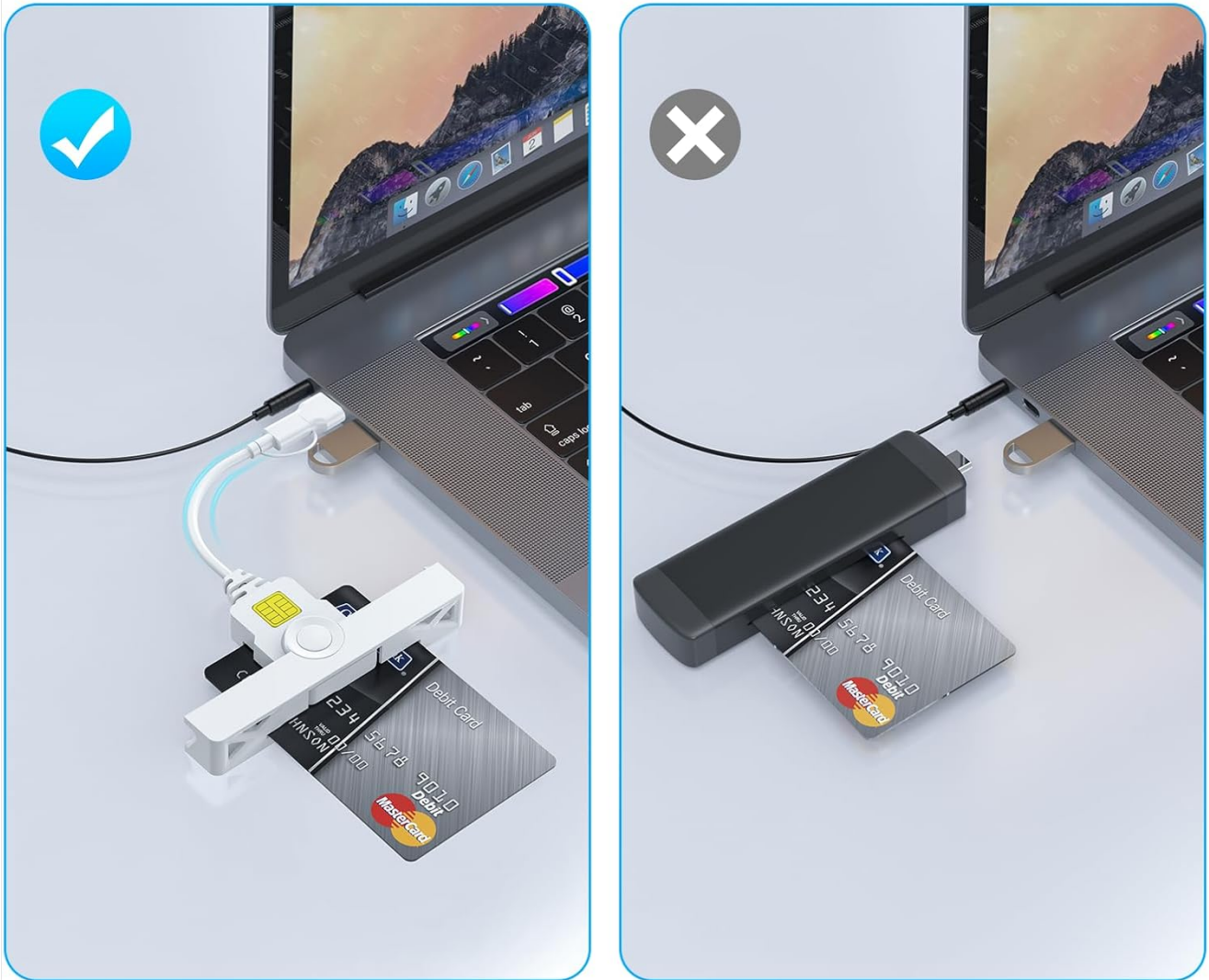
Image: A visual comparison demonstrating how the Rocketek reader's slim profile prevents it from obstructing adjacent USB ports, unlike bulkier alternatives.