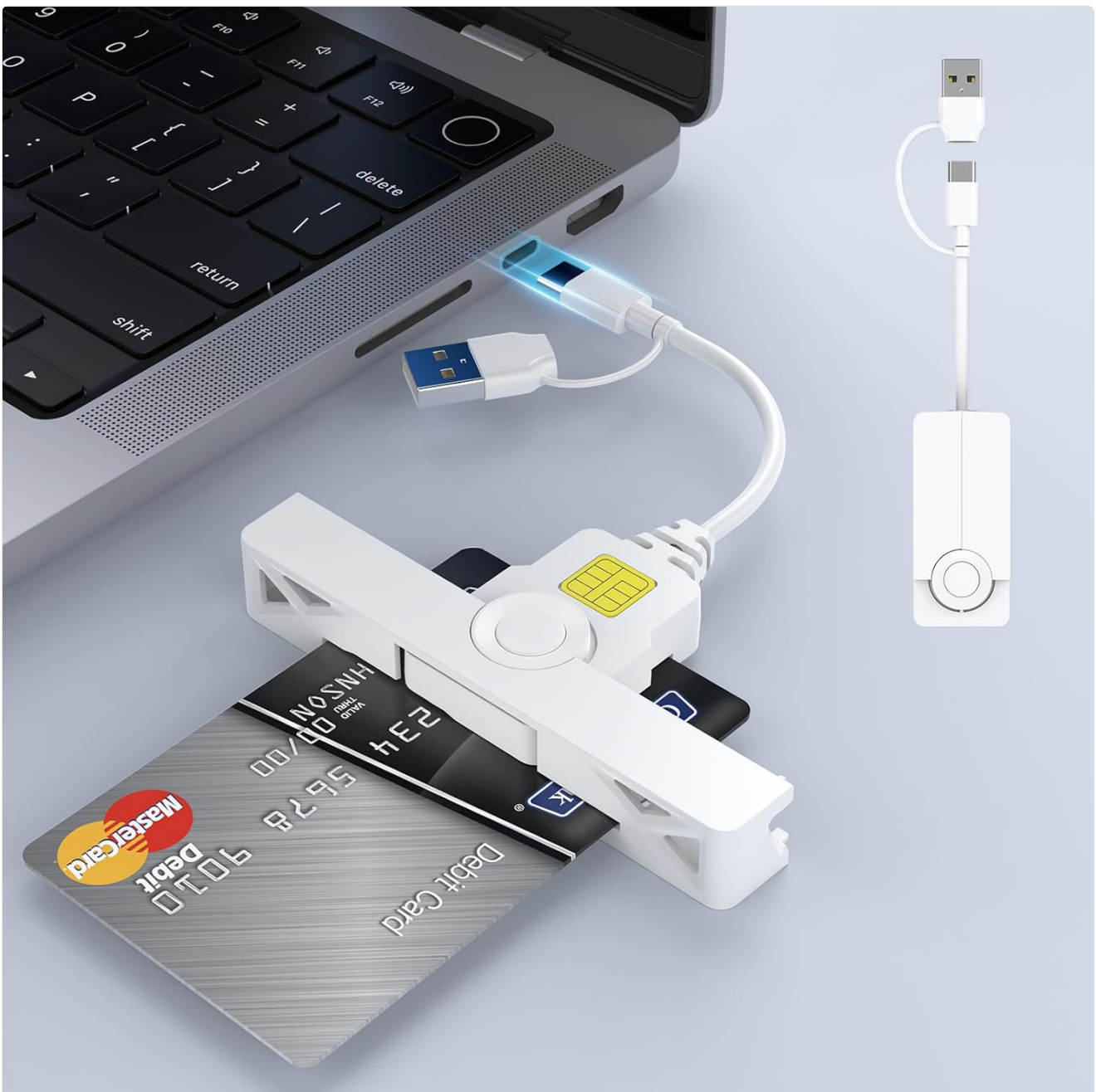
Image: The Rocketek CAC Card Reader connected to a laptop, demonstrating its compact design and dual USB-A/Type-C connectivity. A smart card is shown inserted into the reader.