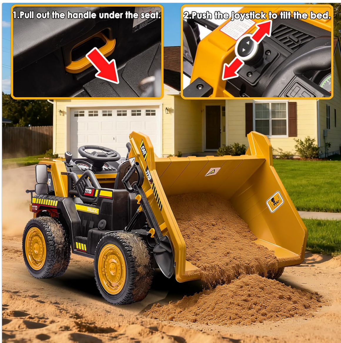
Image Description: The NEWQIDA 24V Ride on Dump Truck is shown with its electric dumping bed in action, demonstrating how to pull a handle under the seat and use a joystick to tilt the bed for unloading. An included shovel is also visible.

Your browser does not support the video tag.