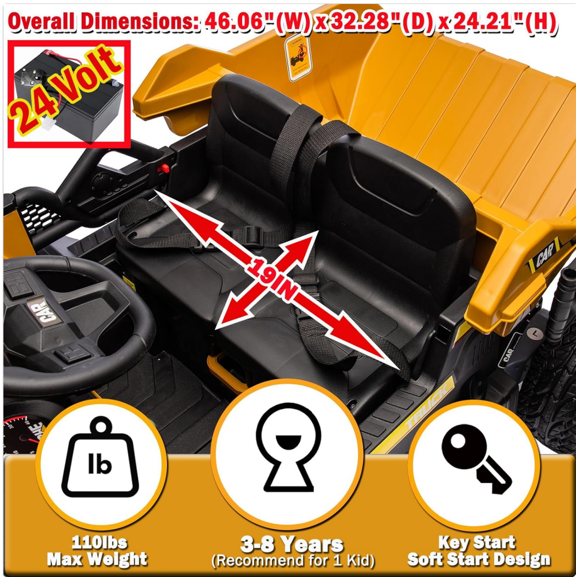
Image Description: An overhead view of the NEWQIDA 24V Ride on Dump Truck with two children seated, illustrating the spacious 19-inch seat, 110 lbs maximum weight capacity, and recommended age of 3-8 years. Key features like key start and soft start design are also highlighted.