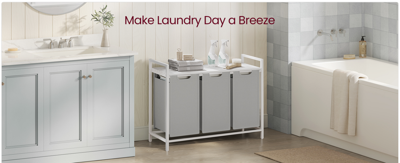
Image: The assembled VASAGLE UBLH301W03 Laundry Hamper with three bags and a top shelf, ready for use in a laundry room.