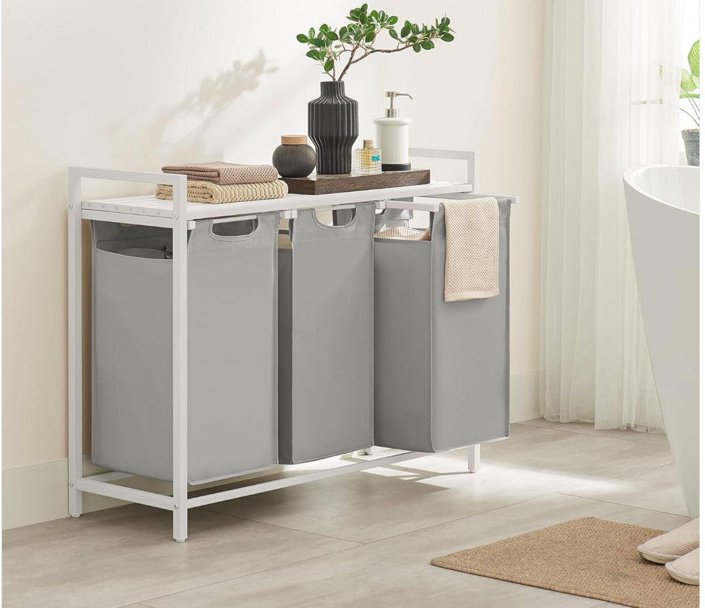
Image: A visual representation of the 3-compartment design, highlighting its 31.7 Gallon (120 L) capacity for sorting various laundry loads.