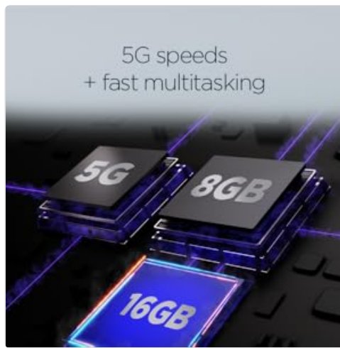
Image 3: Illustration of the MediaTek Dimensity 930 processor, emphasizing 5G speeds and multitasking.