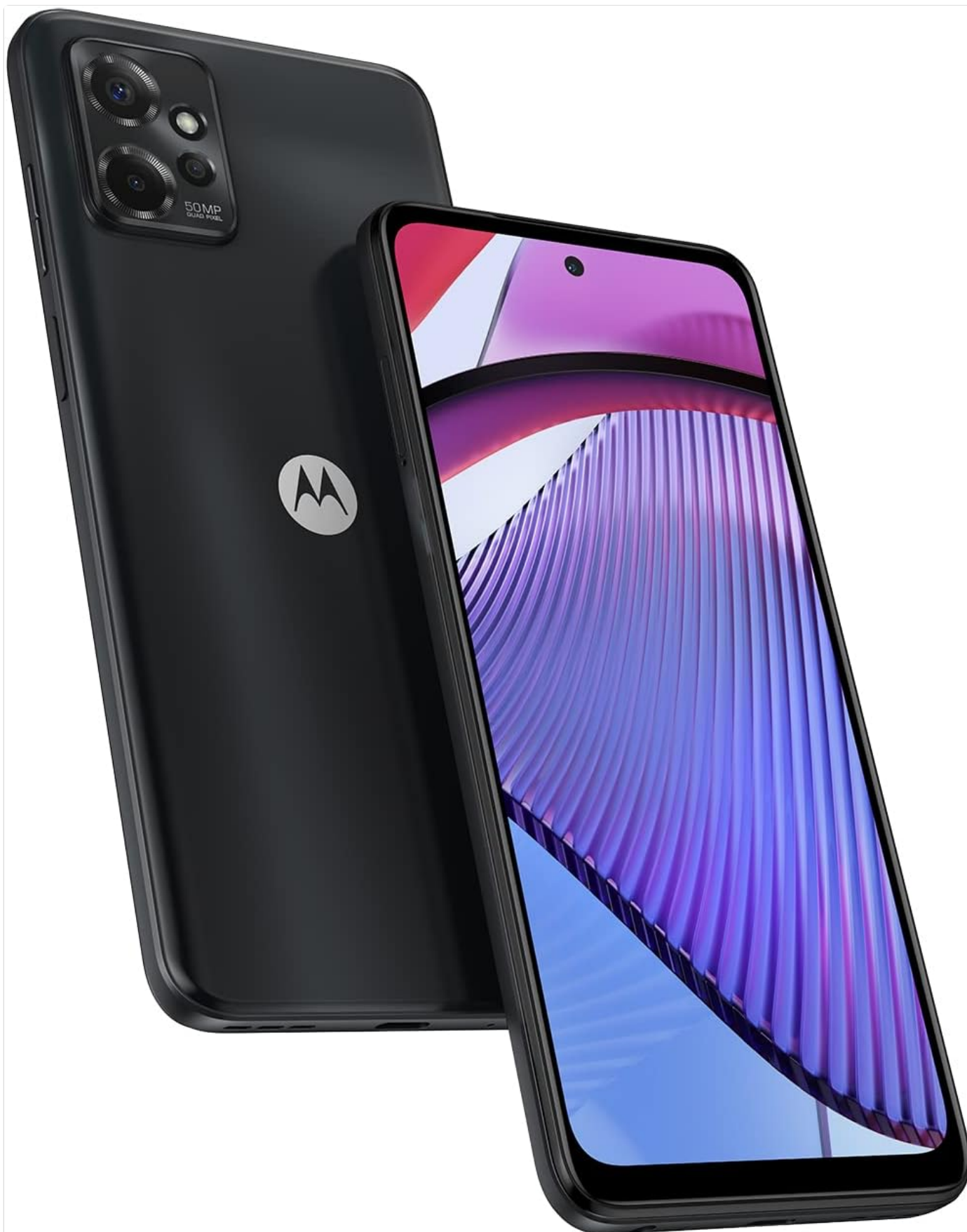
Image 1: Front and back view of the Motorola Moto G Power 5G (2023) in Mineral Black.