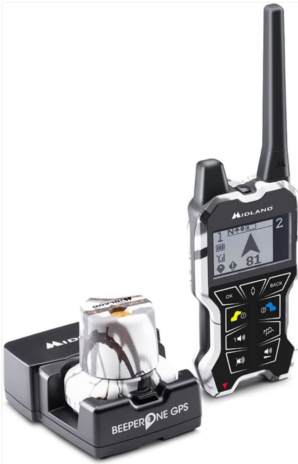
Image: The Beeper One GPS system, showing the remote control, the GPS collar, and its charging base.