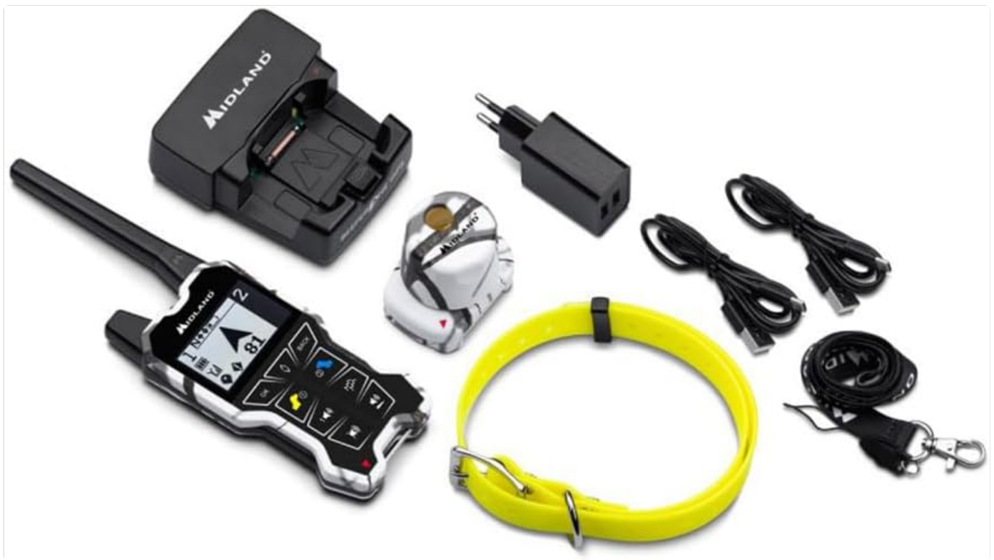
Image: A complete view of all items included in the Beeper One GPS package, including the remote, collar, charger, strap, and cables.