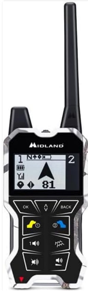
Image: A detailed view of the Beeper One GPS remote control, highlighting its screen and control buttons for easy operation.