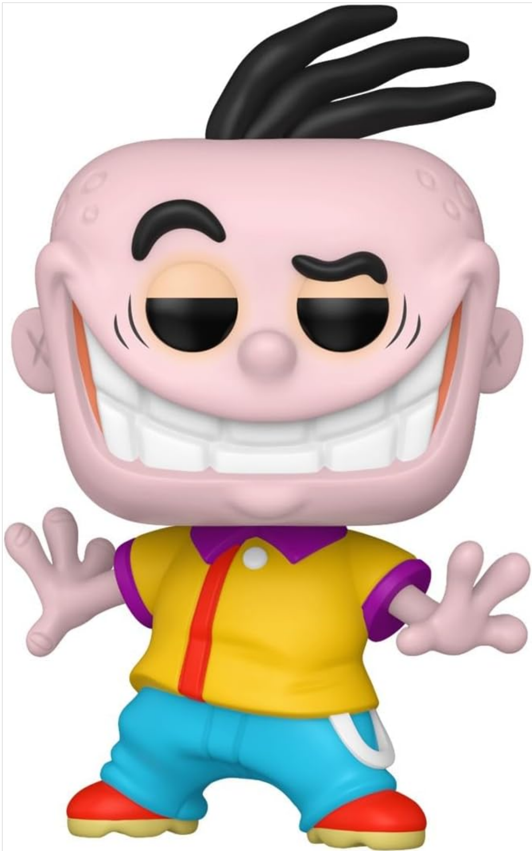
Image 1.2: Funko Pop Eddy figure removed from its packaging, ready for display.