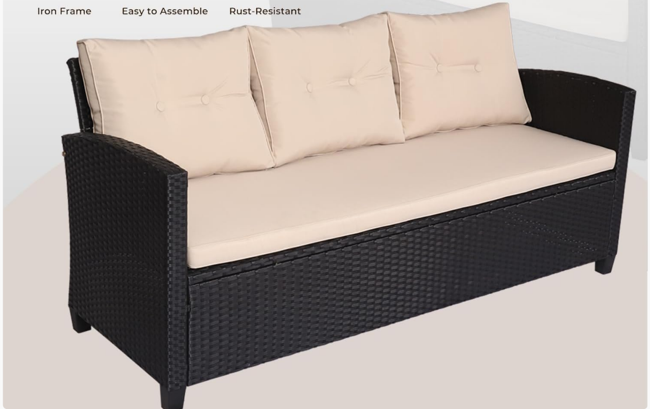
Image: Illustration highlighting the powder-coated steel frame, emphasizing its ease of assembly and rust-resistant finish.