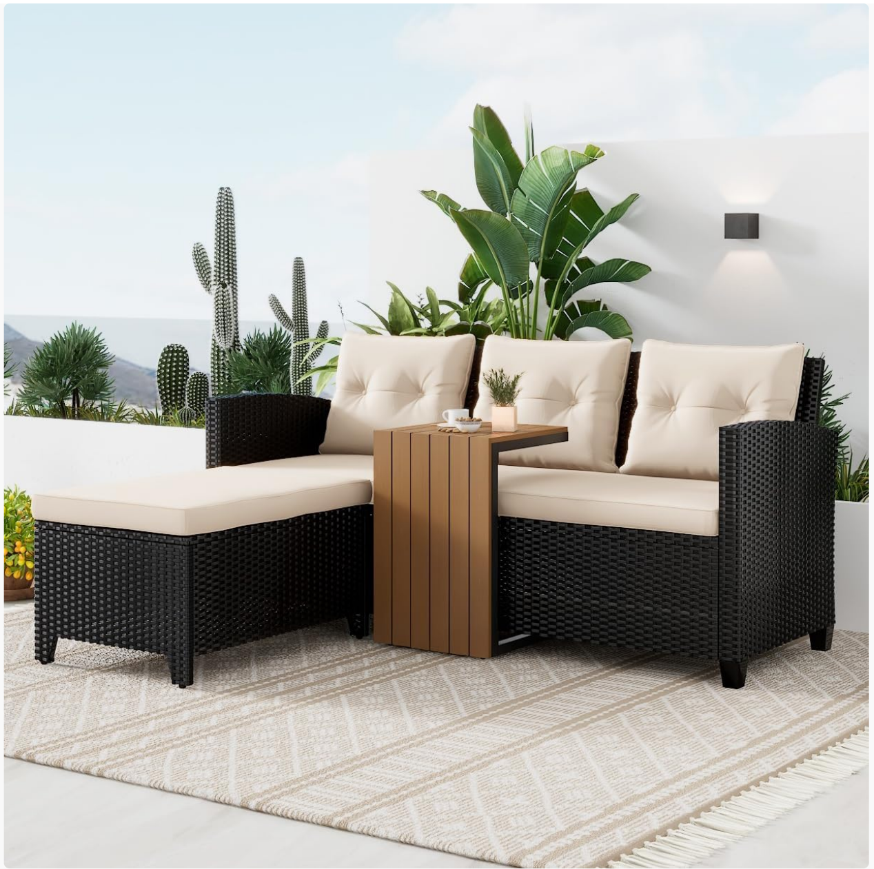
Image: The patio furniture set arranged in an L-shaped configuration, demonstrating its suitability for outdoor spaces.