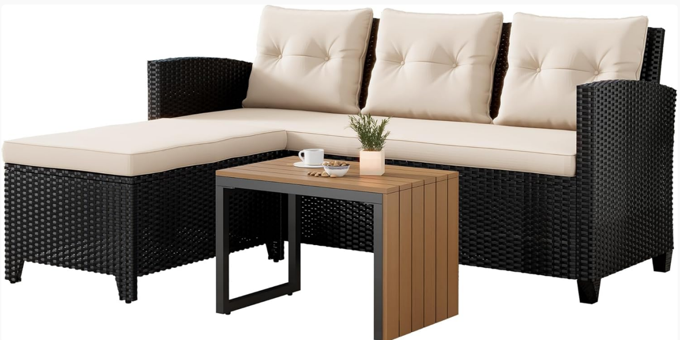
Image: The Suntone 3-piece patio furniture set, showcasing the L-shaped sofa configuration with the ottoman and the versatile coffee table. The set features black wicker and beige cushions.

Constructed with a heavy-duty rust-resistant steel frame and hand-woven PE wicker, this set is built for year-round outdoor use and designed to withstand various weather conditions. The cushions are made with 2.5-inch thick sponge padding and covered with fade-resistant, water-repellent fabric for comfort and easy maintenance.