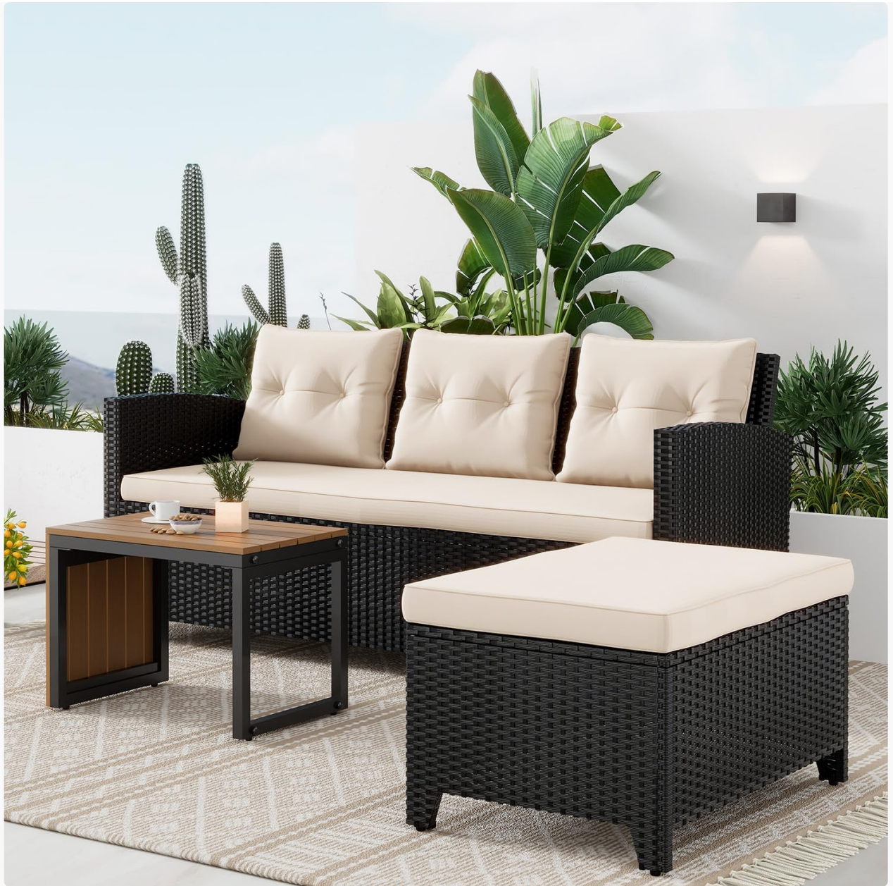
Image: The patio furniture set with the 3-seater sofa, ottoman, and coffee table positioned as individual pieces, showcasing a flexible seating arrangement.