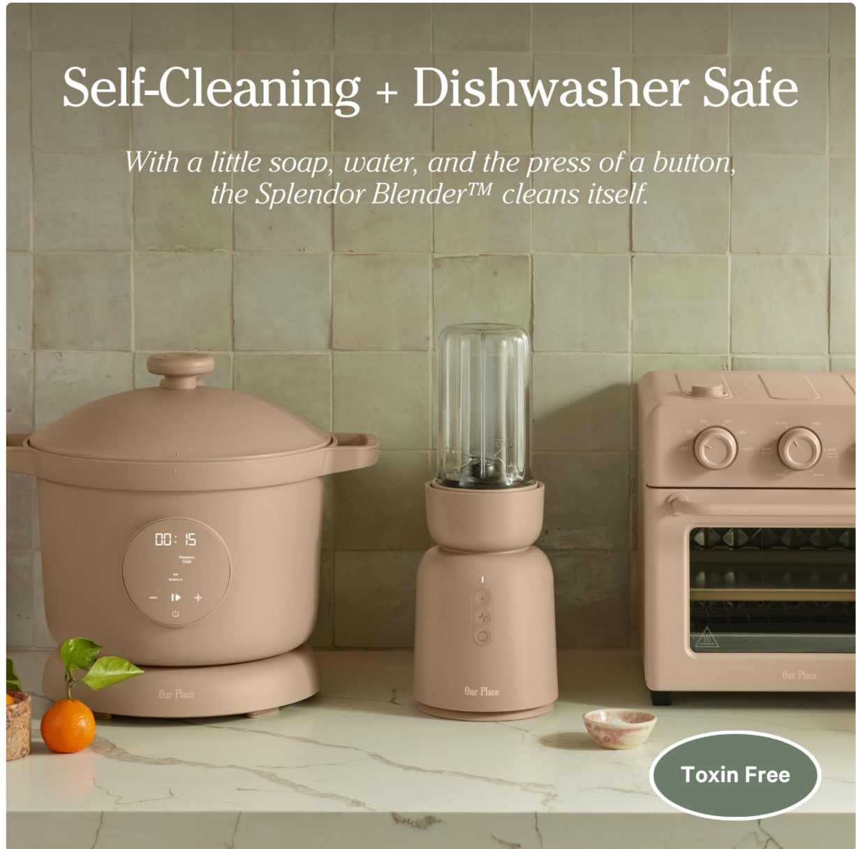
Image: The Splendor Blender in a kitchen setting, emphasizing its easy cleaning process.

Regular cleaning ensures the longevity and optimal performance of your Splendor Blender.