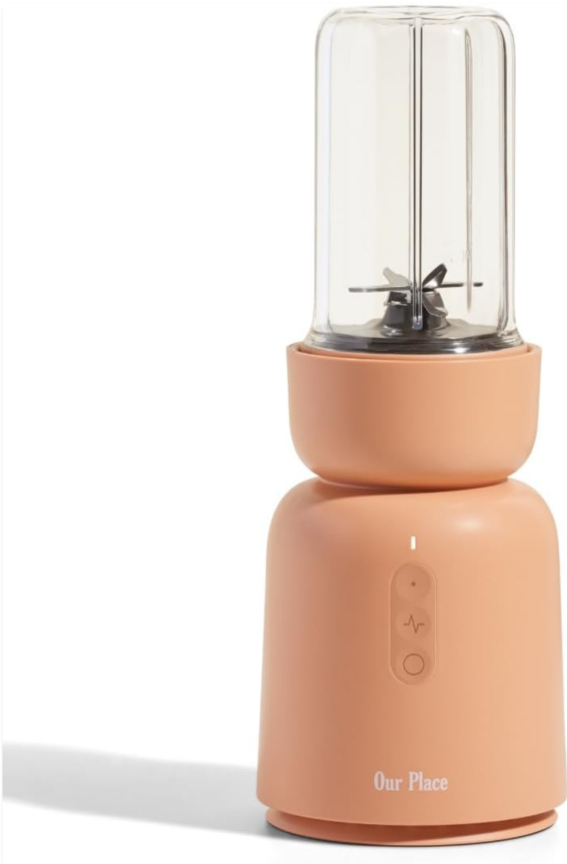
Image: The Our Place Splendor Blender, showcasing its compact design and personal blending vessel.