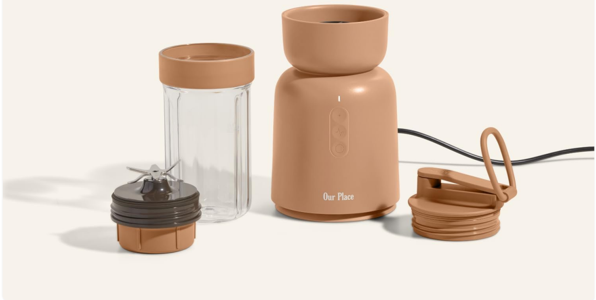
Image: All included components of the Splendor Blender.