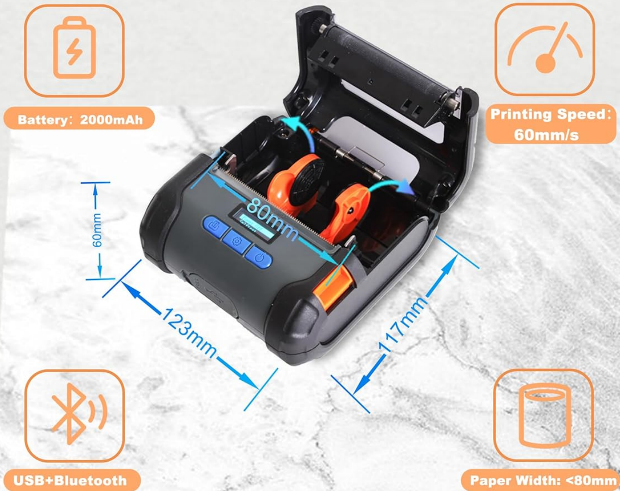
Figure 4: Physical dimensions and core specifications of the ZM04 printer.

USB+Bluetooth Supports receipt printing and label printing