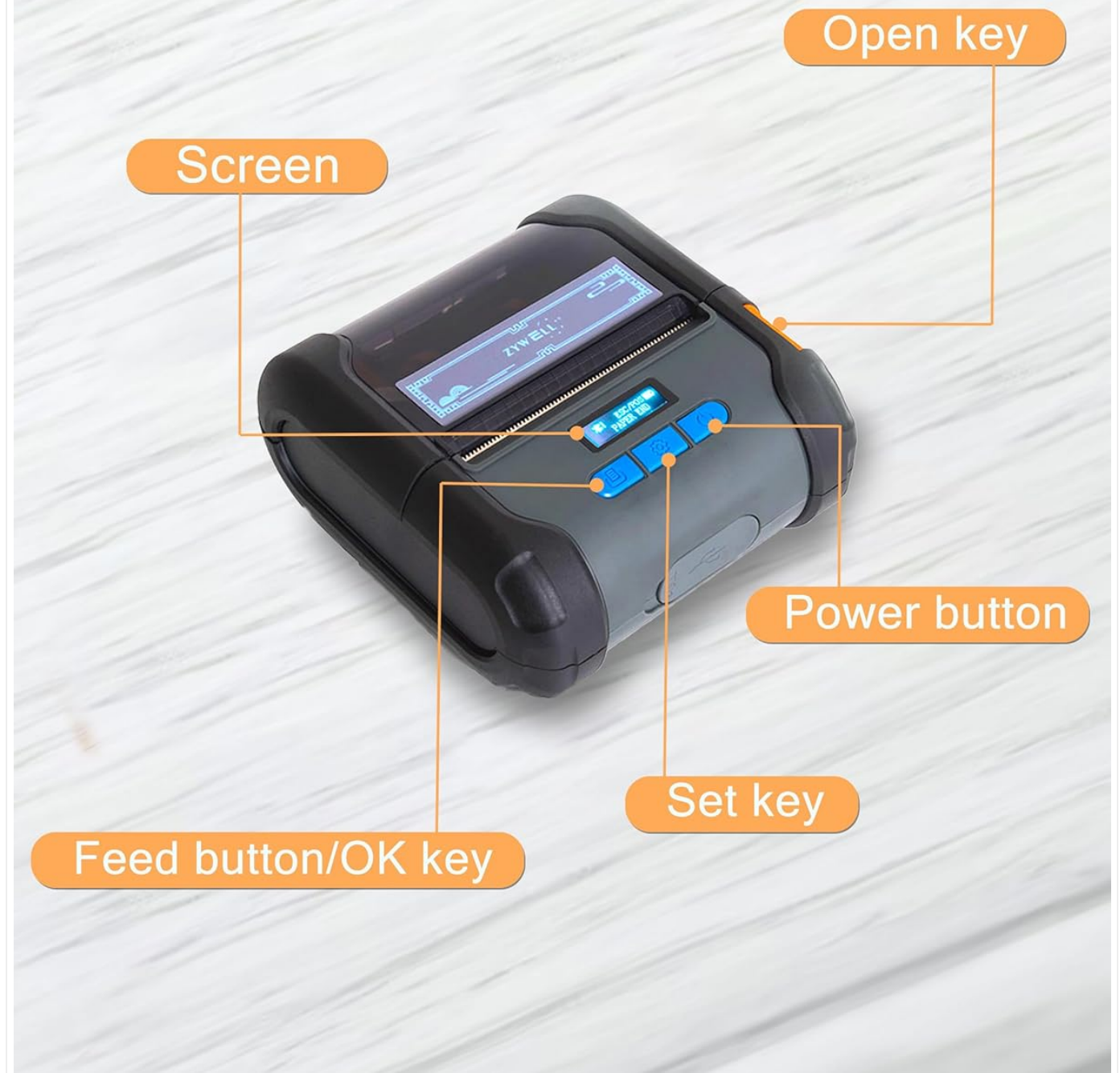
Figure 3: Key operational components of the ZM04 printer.