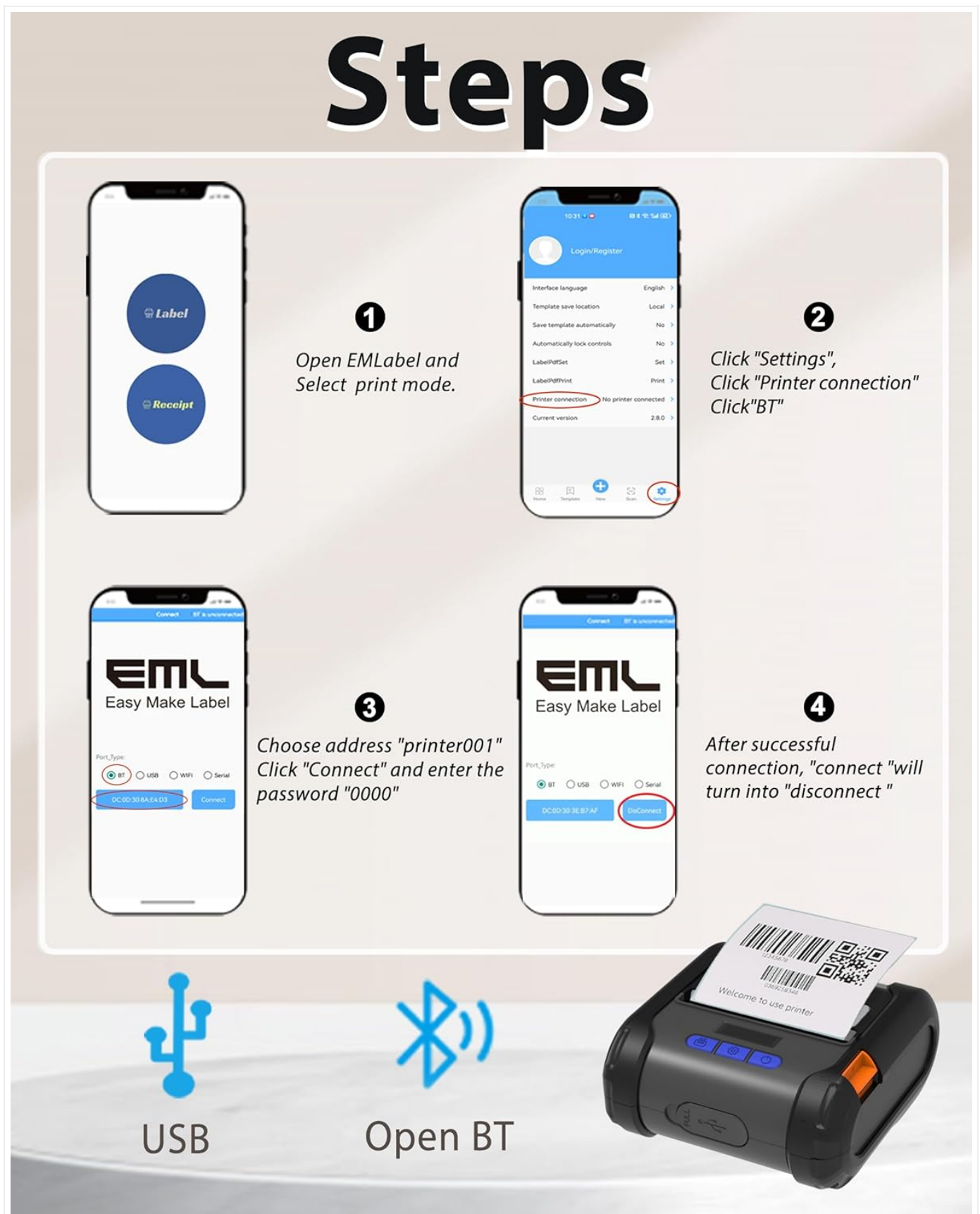
Figure 7: Step-by-step guide for connecting and printing using the mobile application.