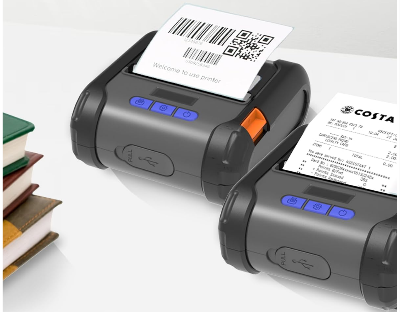
Figure 6: The ZM04 printer supports both receipt and label printing modes, indicated by the display.

Receipt Mode " ESC ", Label Mode " TSPL ", Face Sheet Mode " CPCL "