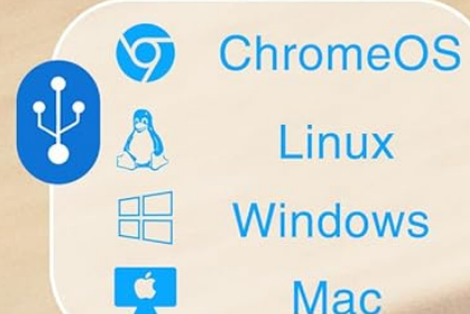
Figure 5: Overview of Bluetooth and USB connectivity for the ZM04 printer.